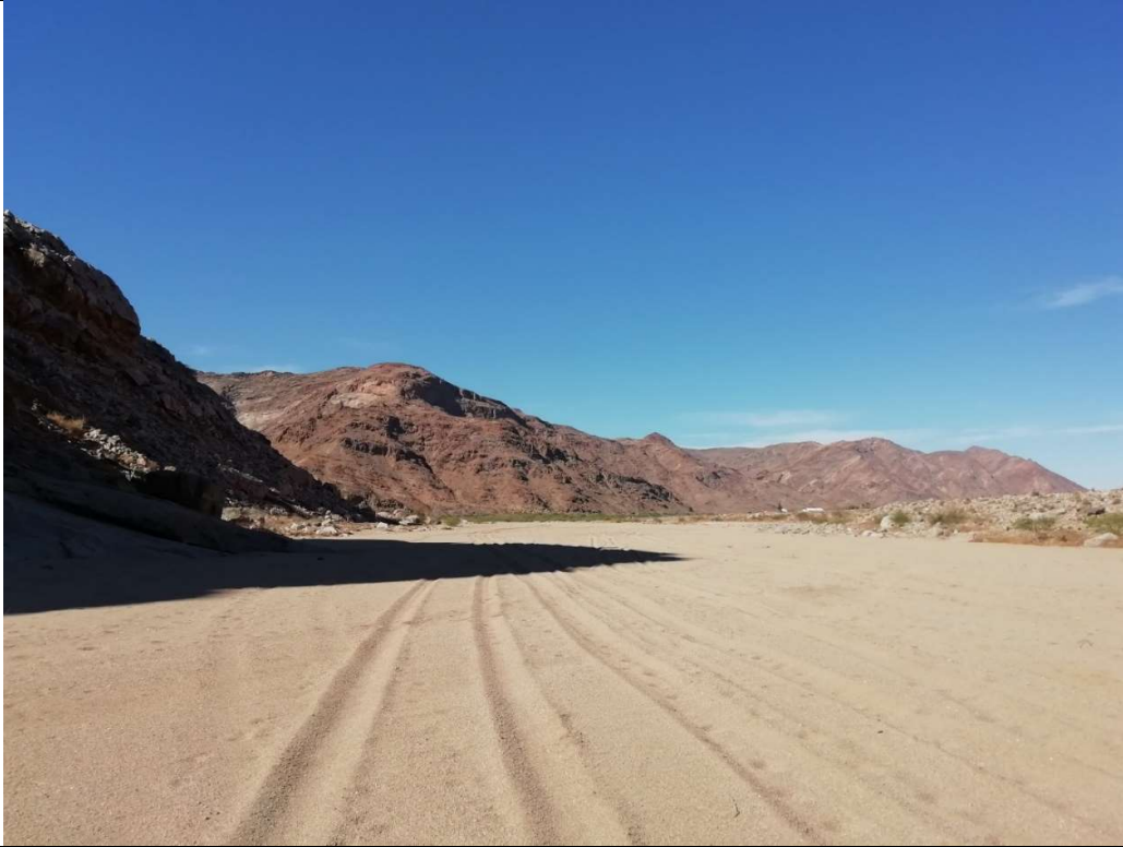
Plate 3: Section of Te Goob Se Laagte, a tributary of the Orange River which lies in close proximity to the foot of the mountain range pictured. The proposed new bulk water pipeline will traverse a section of the Te Goob Se Laagte on its way to the Pella Drift Water Treatment Plant.