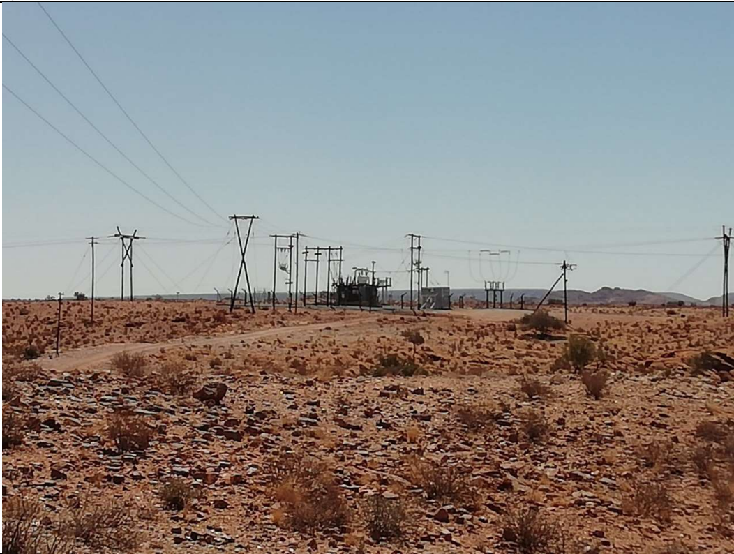
Plate 6: The existing Midway substation which will require upgrading to allow for the booster pump station to be upgraded due to a lack of additional capacity.