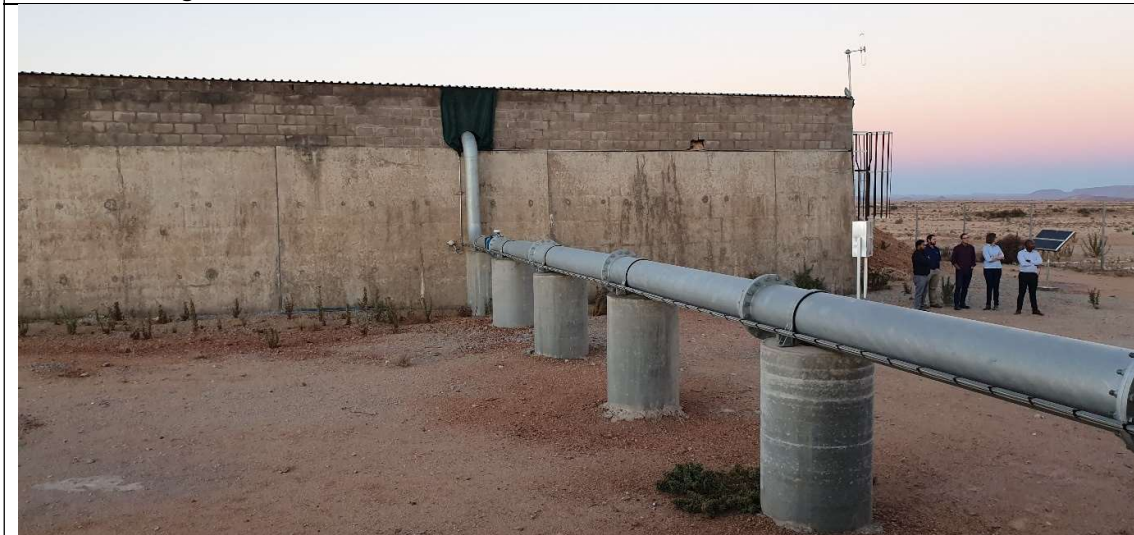
Plate 9: Existing Horseshoe Reservoir 2