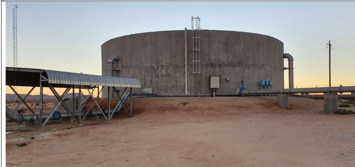
Plate 8: Existing Horseshoe Reservoir 1