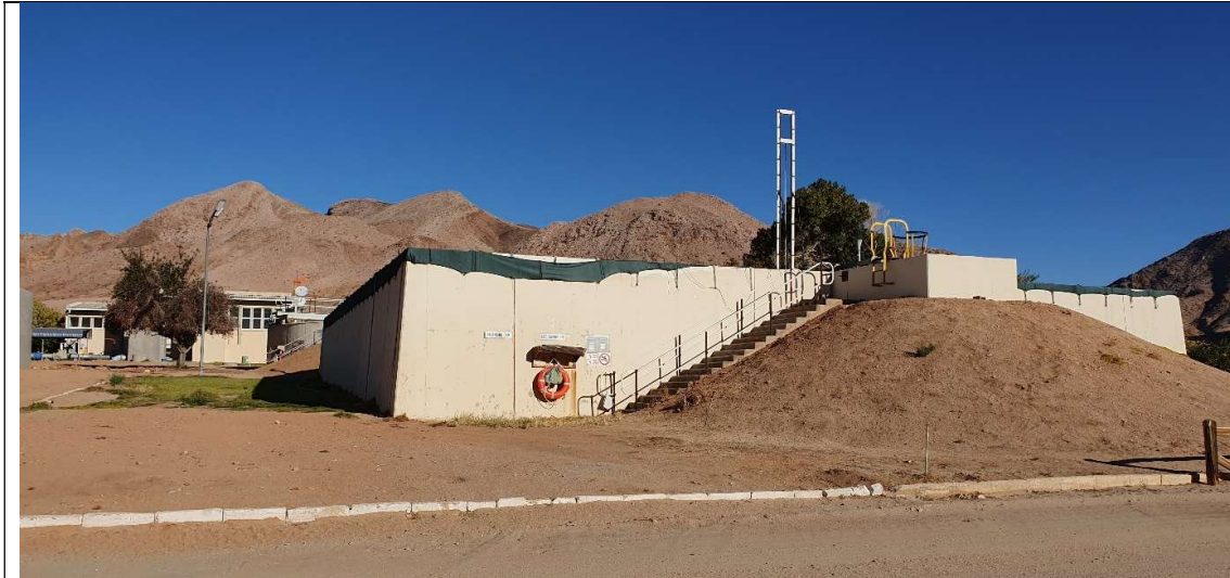
Plate 7: Existing Water Treatment Plant