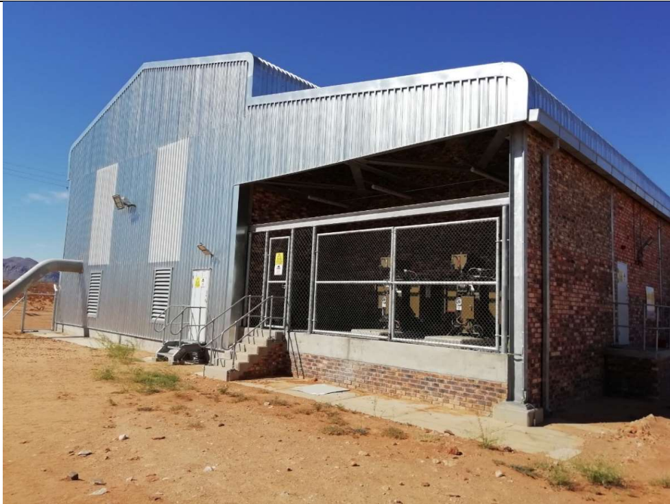
Plate 5: Photo of the booster pump station which will be upgraded as part of the proposed project.