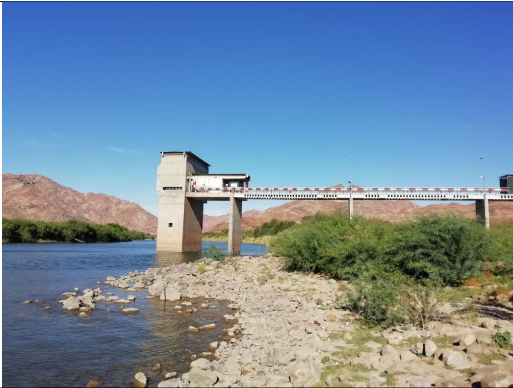
Plate 4: The Pella Drift abstraction tower housing the extraction pumps required to supply the water treatment plant with raw water.