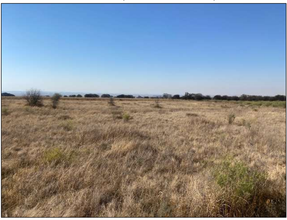
Plate 3: The site (taken towards the east).