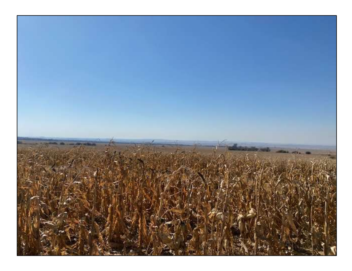
Plate 1: The site (taken towards the north)