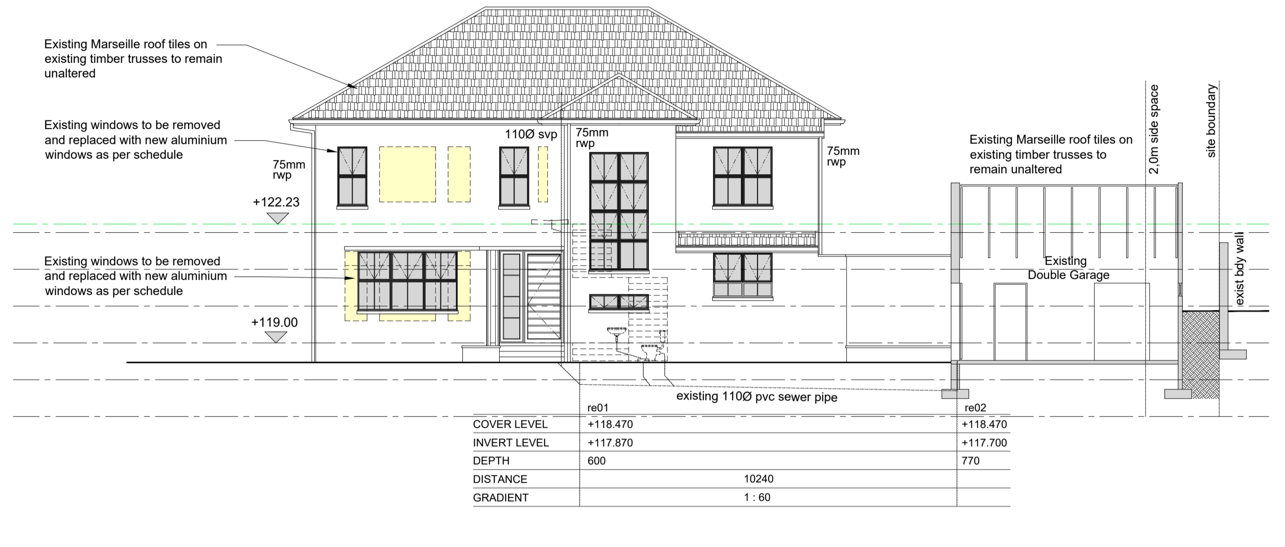
SOUTH EAST ELEVATION SCALE 1: 100