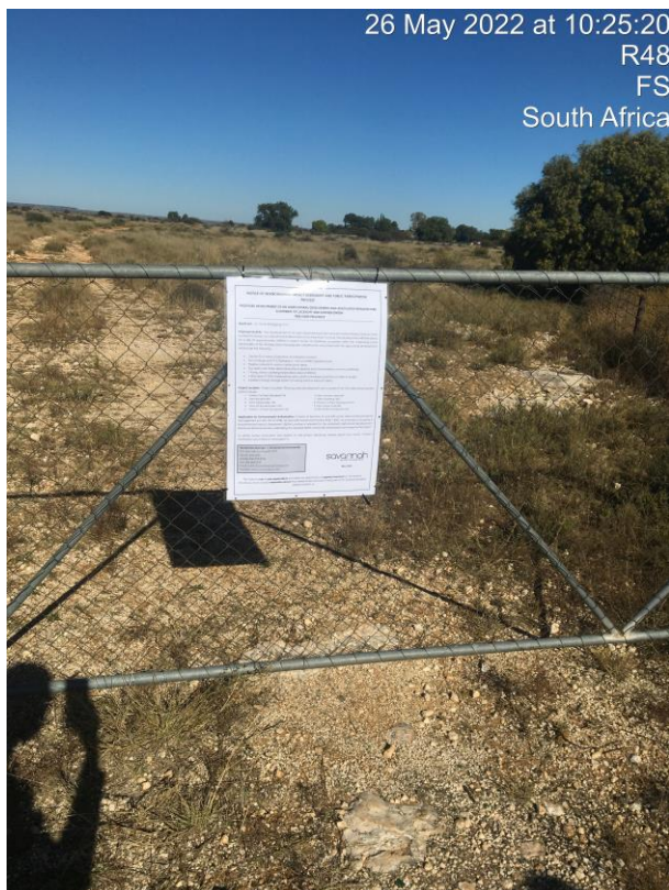
Site 2 – 29.19.20.529S; 25.2.42.11 E