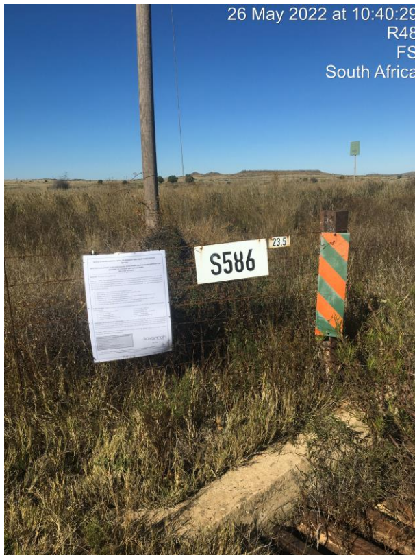
Site 5 – 29.19.18.63S; 25.2.44.179 E