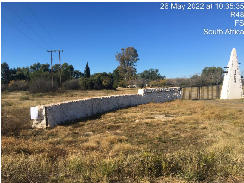
Site 4 – 29.19.31.789S; 25.2.14.059 E