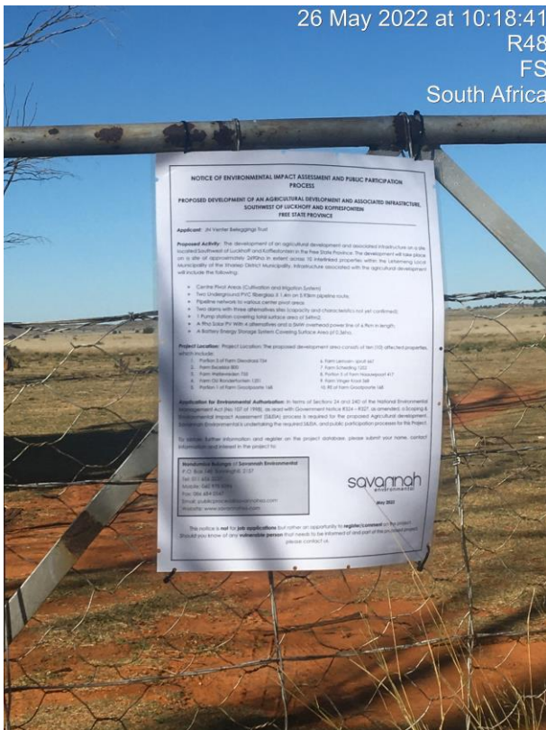
Site 1 – 29.18.20.389S; 25.5.10.055 E