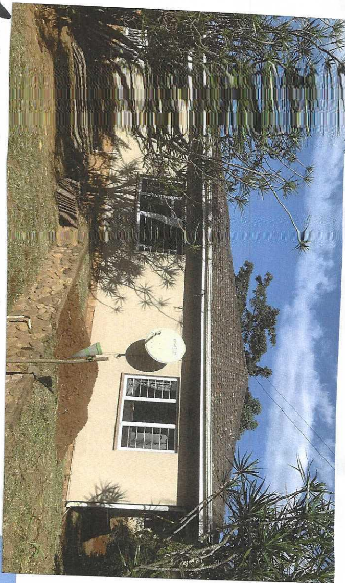
↑ N - E. Elevation - Ancillary Unit