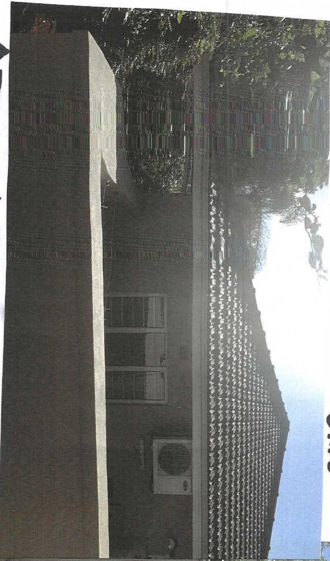
↑ Port S. W. Elevation - Ancillary Unit