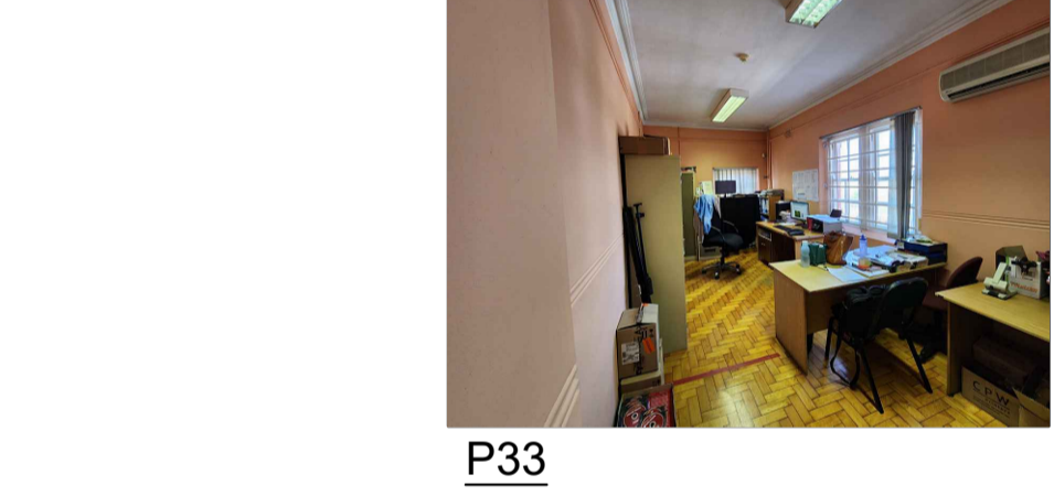
PHOTOS - EXISTING BUILDING