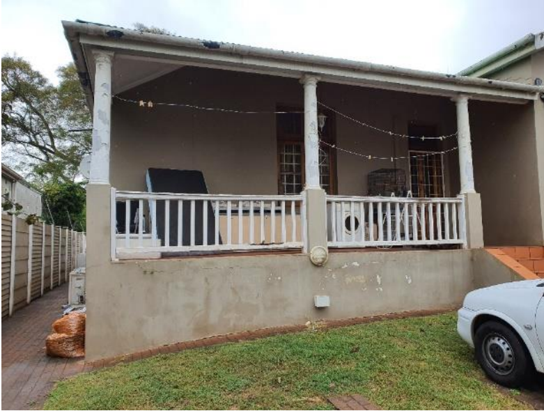
Veranda with the side veranda enclosed.