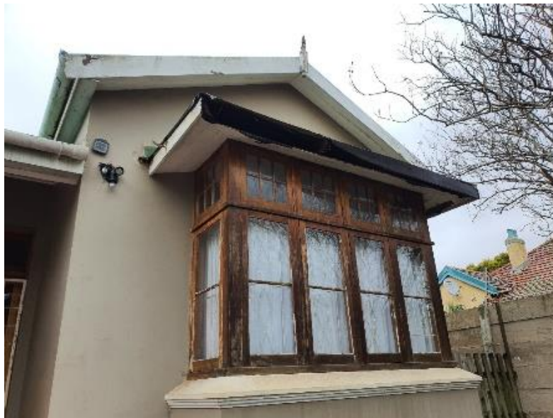
Asymmetrical gable with bay window.