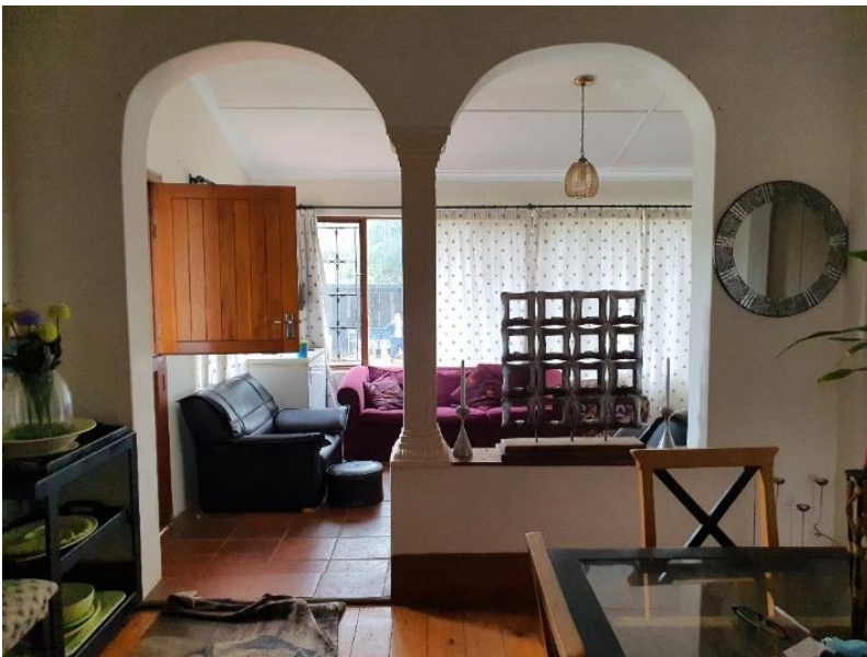
Inappropriate internal alterations