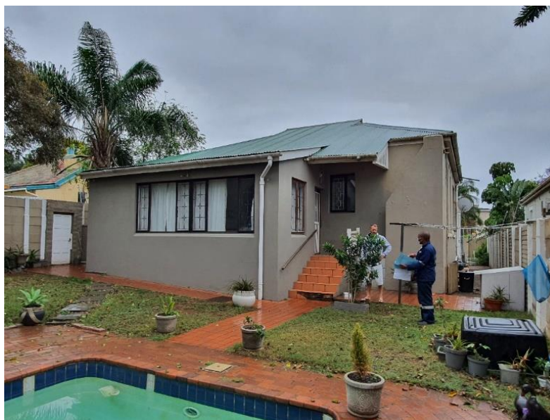
South elevation with inappropriate addition.