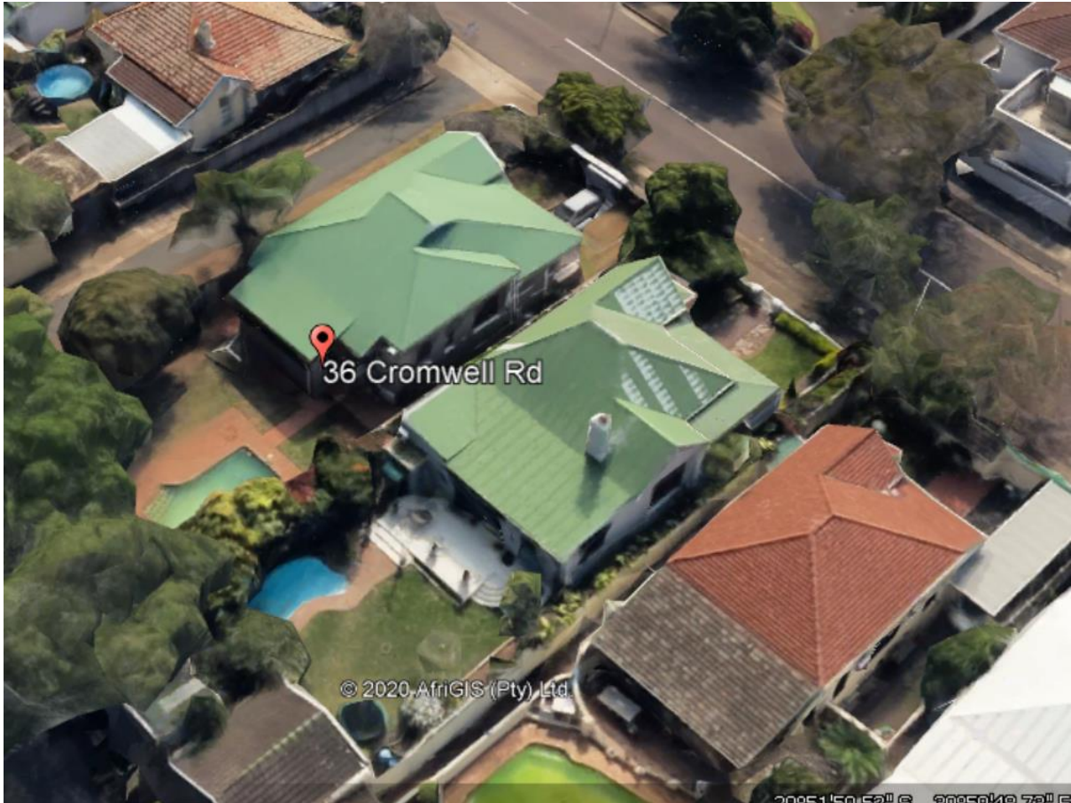
This house has been reroofed as a single entity. The veranda roof has been incorporated into the main roof.