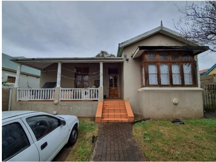
North elevation, veranda with asymmetrical gable