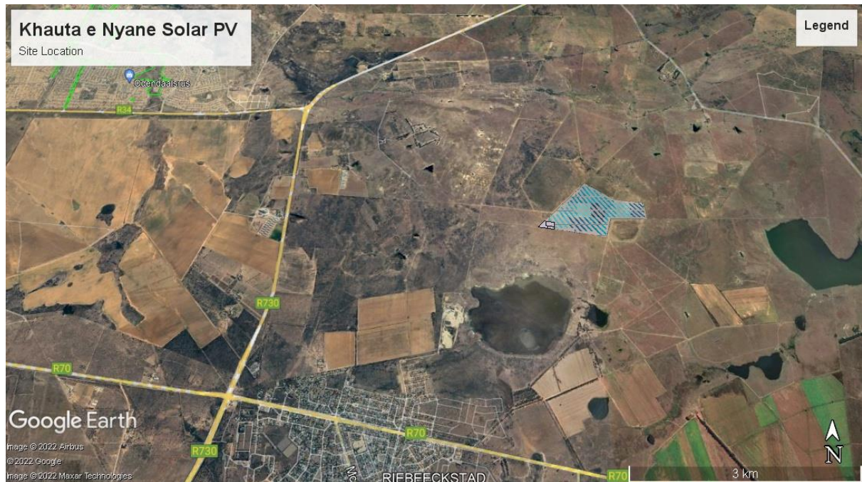
Map 1-1: Site locality