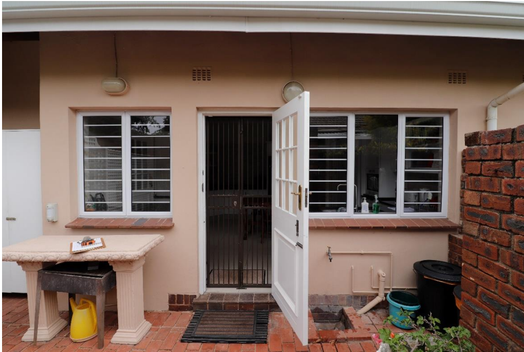
Kitchen door and flanking north facing windows.