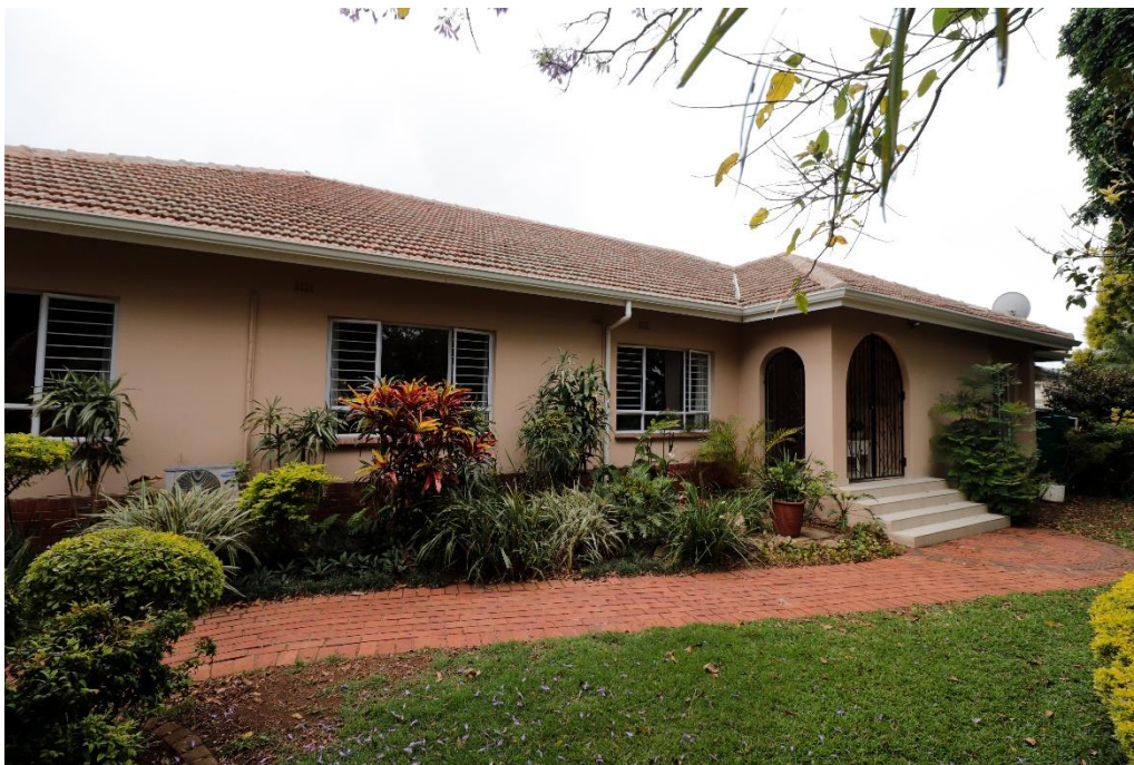
Part south elevation, facing St Kilda Avenue.