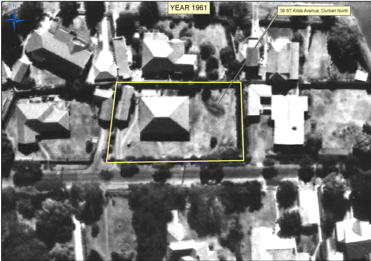
Aerial photo from 1961, proving that the house is over 60 years old.