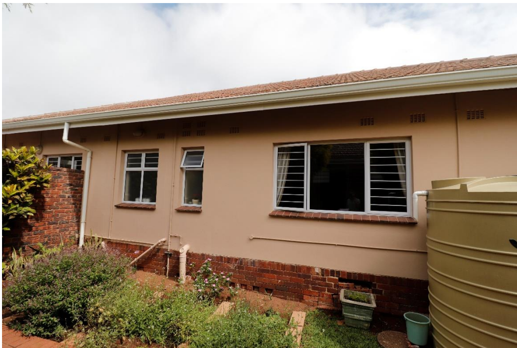
North facing back garden.