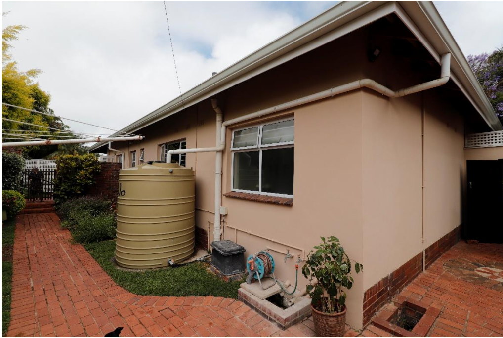
North west corner.