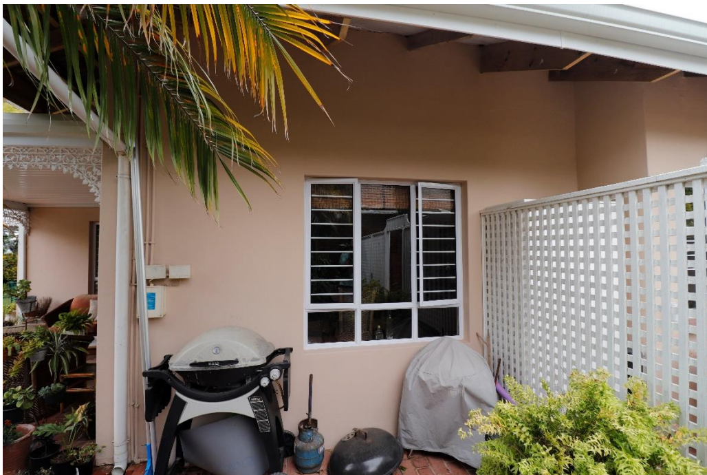
Part north facing façade.