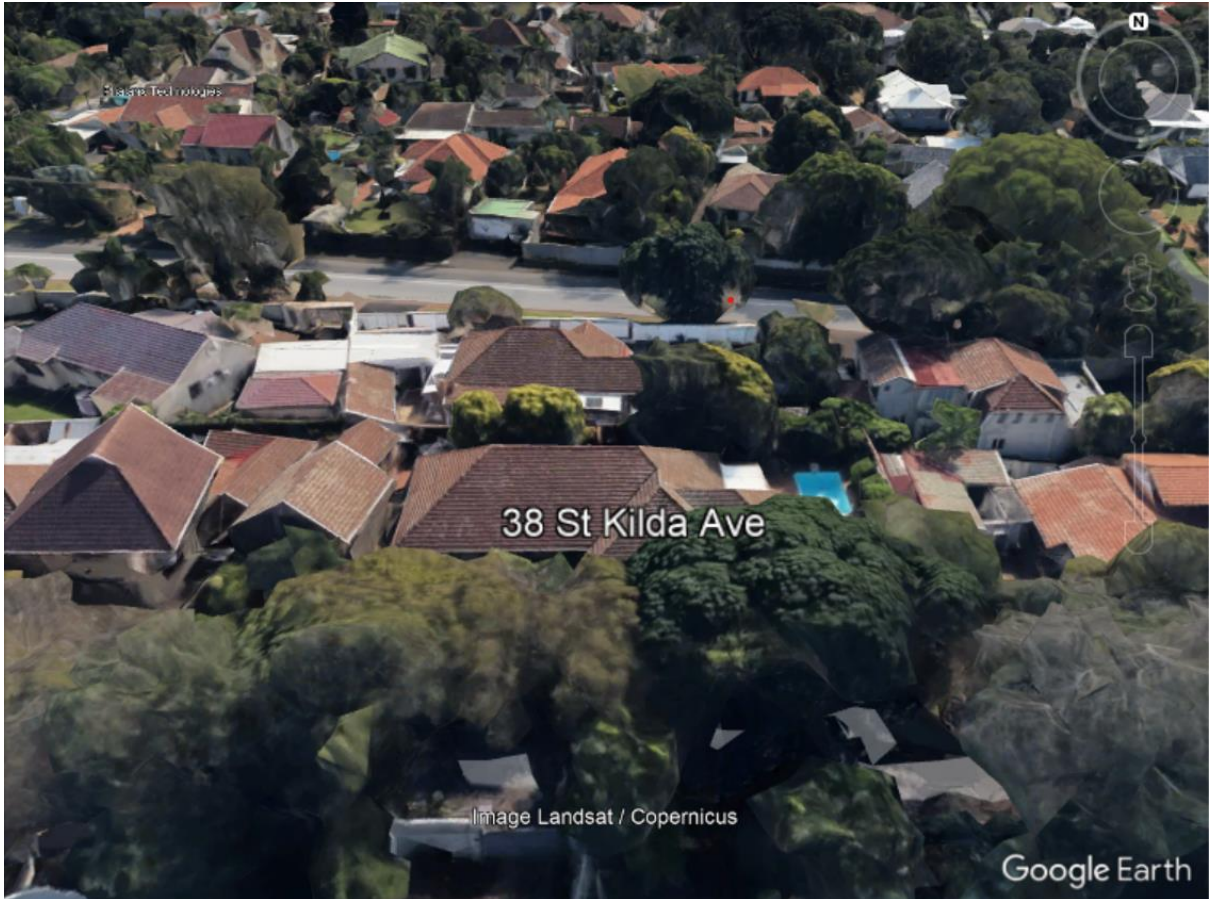
The aerial view from the south.