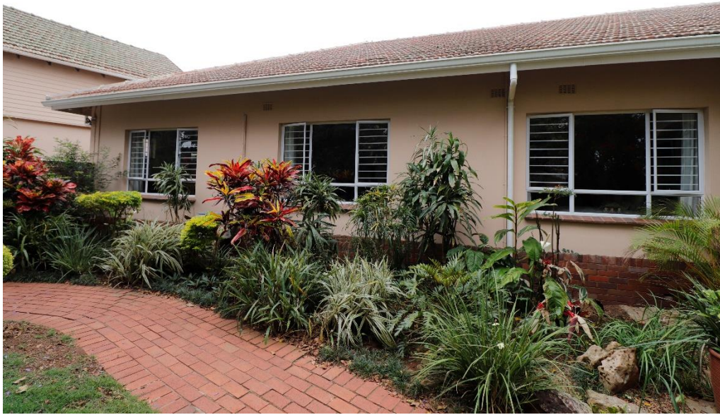
Part south elevation.