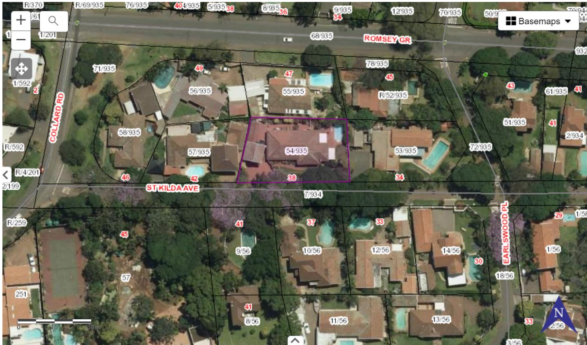
Context of 38 St Kilda Avenue. The Ellis Construction Company Pty Ltd stipulated the roof forms and materials through a clause in the Title Deeds.