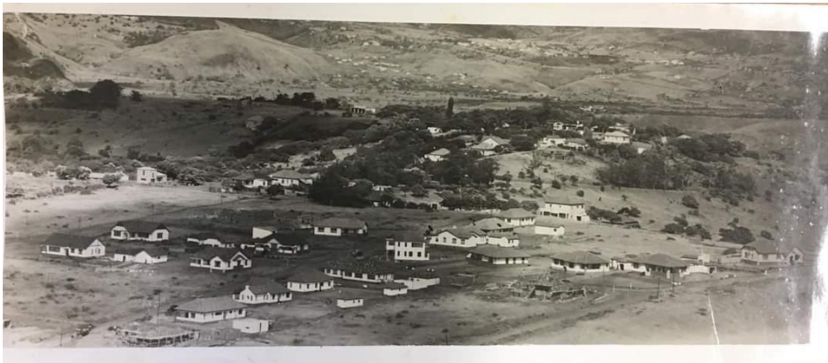
Early photograph of Ellis Park, 1941.