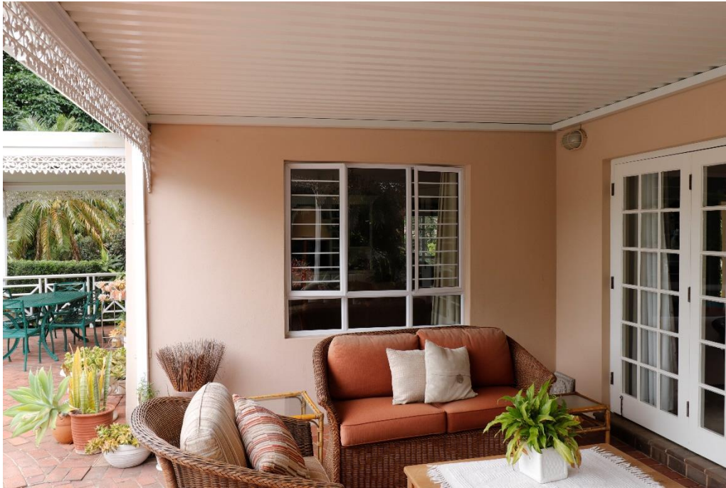
North east facing veranda.