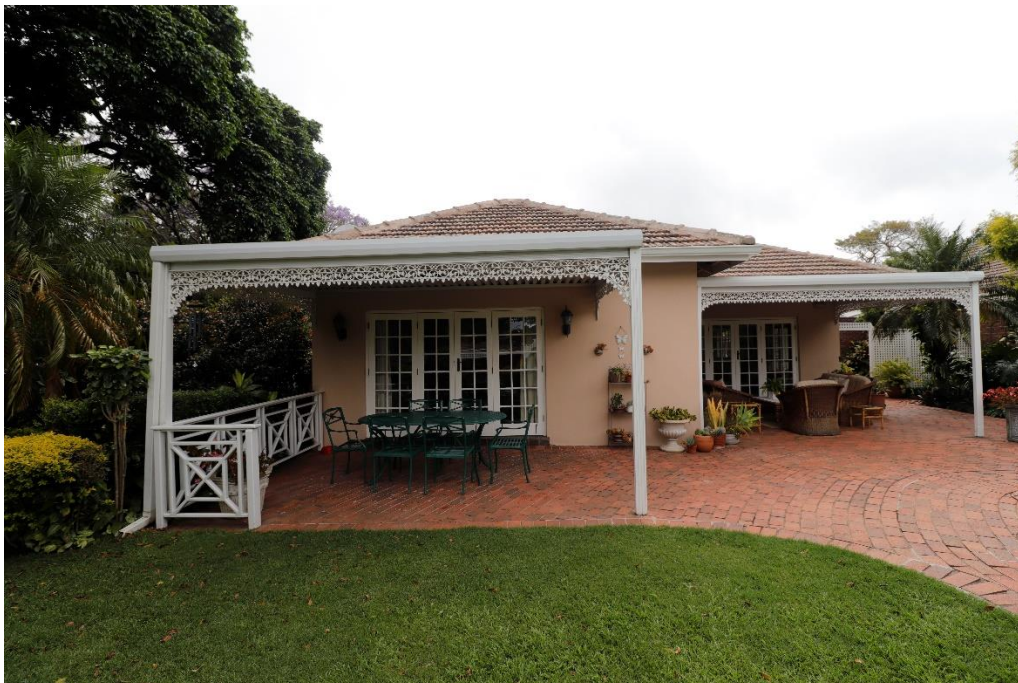
East facing existing aluminium awnings and timber doors.