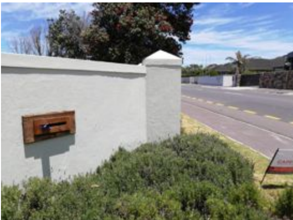
Main Rd Hermanus