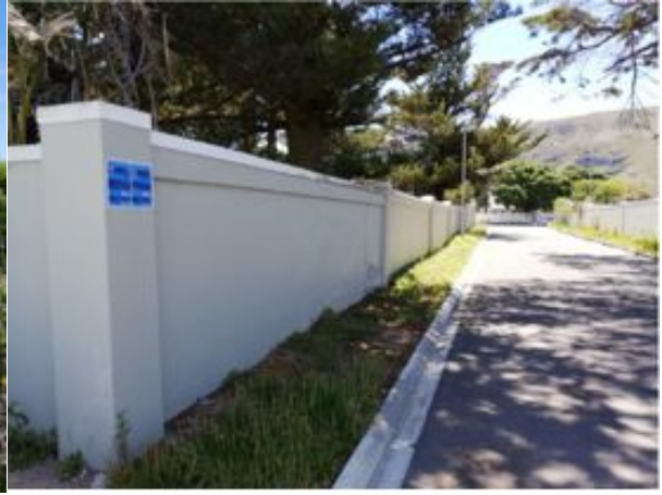
Road off Main Rd Leading to Slevers Point