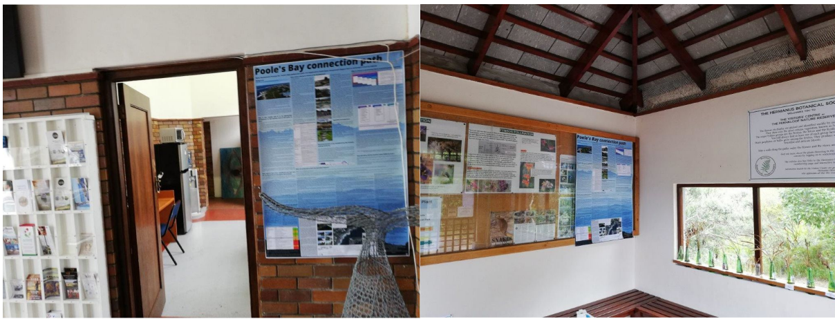
Hermanus Tourism Bureau