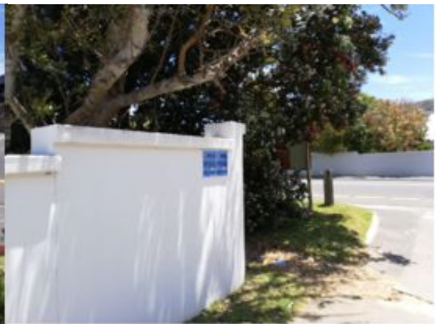
Main Rd Hermanus