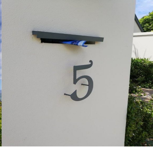
5 Linaria Rd