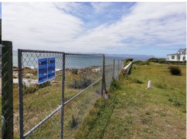
Vacant plot Protea Rd