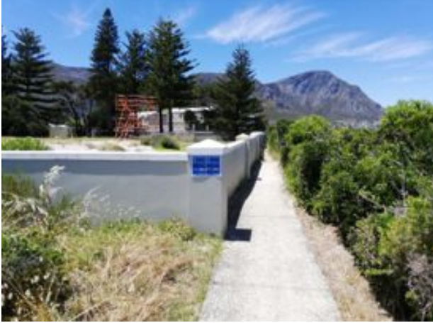
Cliff path near Slevers Point