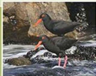
African Black Oystercatcher

BIRDS: African Black Oystercatcher, Amethyst Sunbird, Barthroated Apalis, Cape Batis, Cape Bulbul, Cape Spurfowl, Cape Sugarbird, European Swallow, Fork-tailed Drongo, Grassbird, Hadedda Ibis, Gulls: Kelp, Hartlaubs and Grey-headed, Karoo Prinia, Lesser Double-collared Sunbird, Malachite Sunbird, Olive Thrush, Orange-breasted Sunbird (occasional on coast), Robin Chat, Sandwich Tern, Sombre Bulbul, Whitebreasted Cormorant & Spotted Eagle Owl