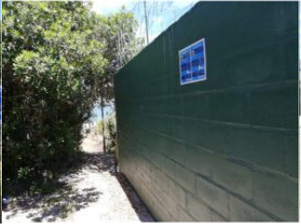
Pathway to Cliff path Off Main Rd opposite Sim Street