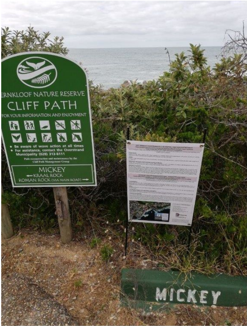
East End of Poole's Bay (Mickey)