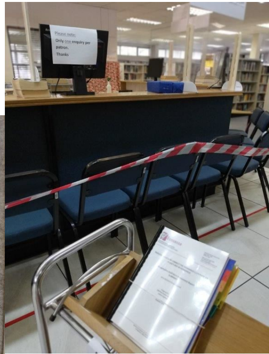
Hermanus Library (Report)