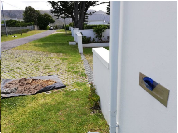
11 Protea Rd