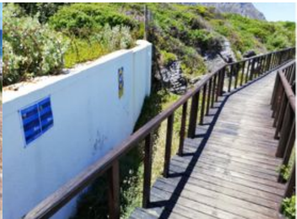
Walk Way Between Slevers Point and Kwaiiwater