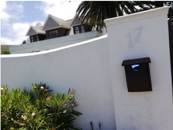
17 Stemmet St