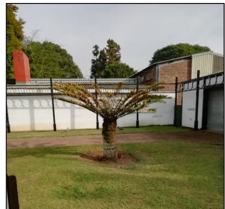
Plate 12: Indigenous plants and trees planted in various parts of the site for ornamental purposes as 'garden' species.