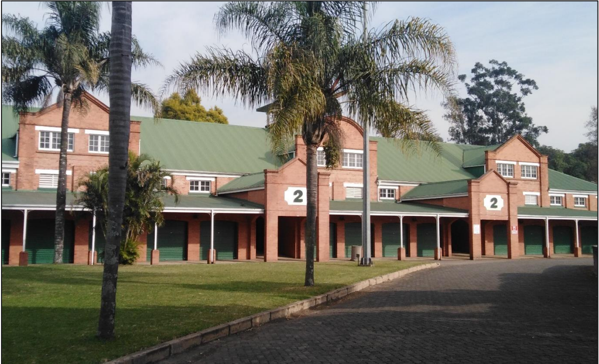
Plate 8: Industrial Hall which constitutes an important heritage building.