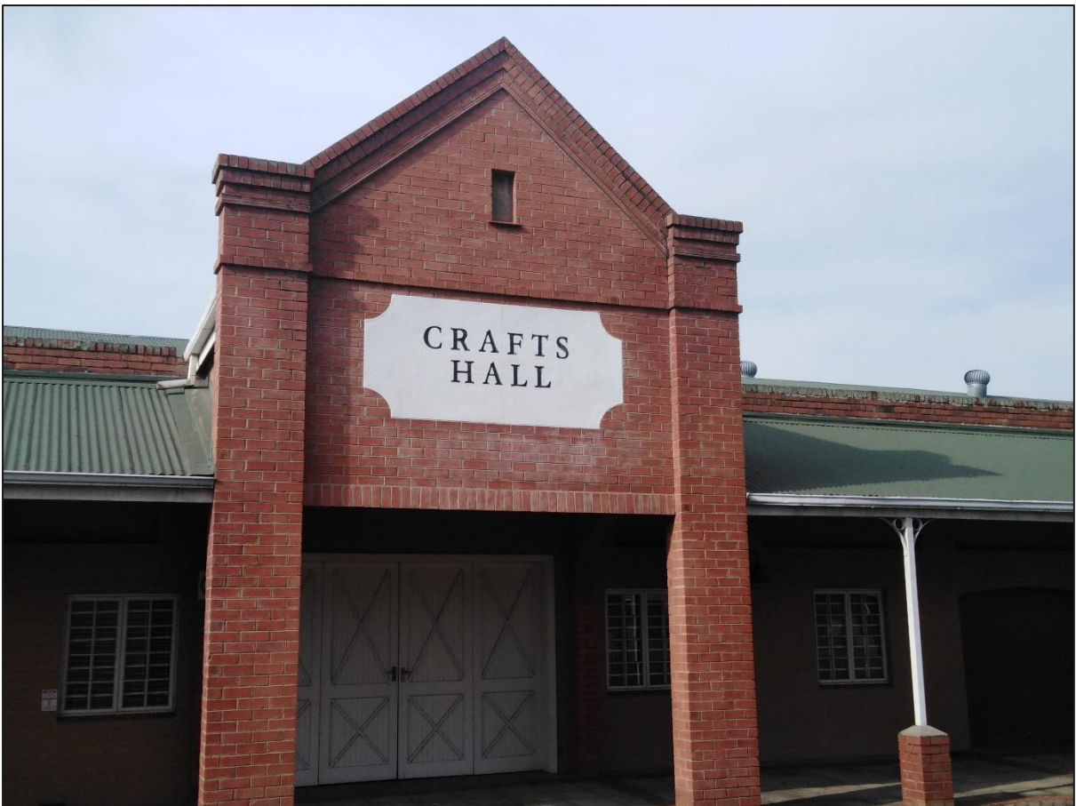
Plate 9: Crafts hall which constitutes an important heritage building.