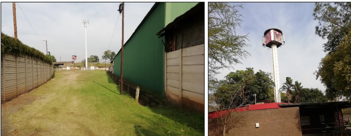
Plate 5: Communications infrastructure (reception towers) within the site.