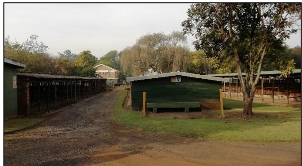
Plate 11: Existing temporary animal pens used to house livestock temporarily during the annual shows.