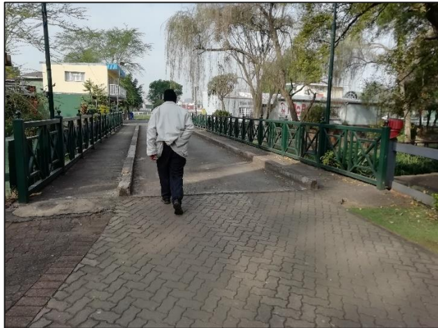
Plate 2: Examples of some of the bridges crossing the Dorpspruit River.