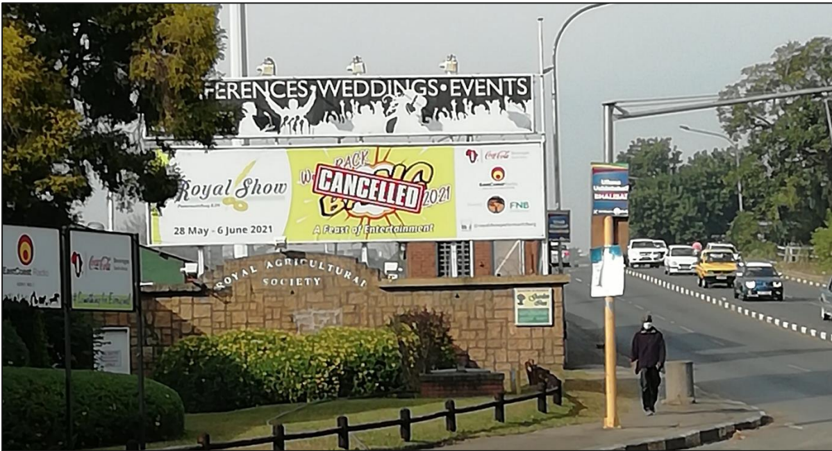
Plate 6: Billboard located within the site.