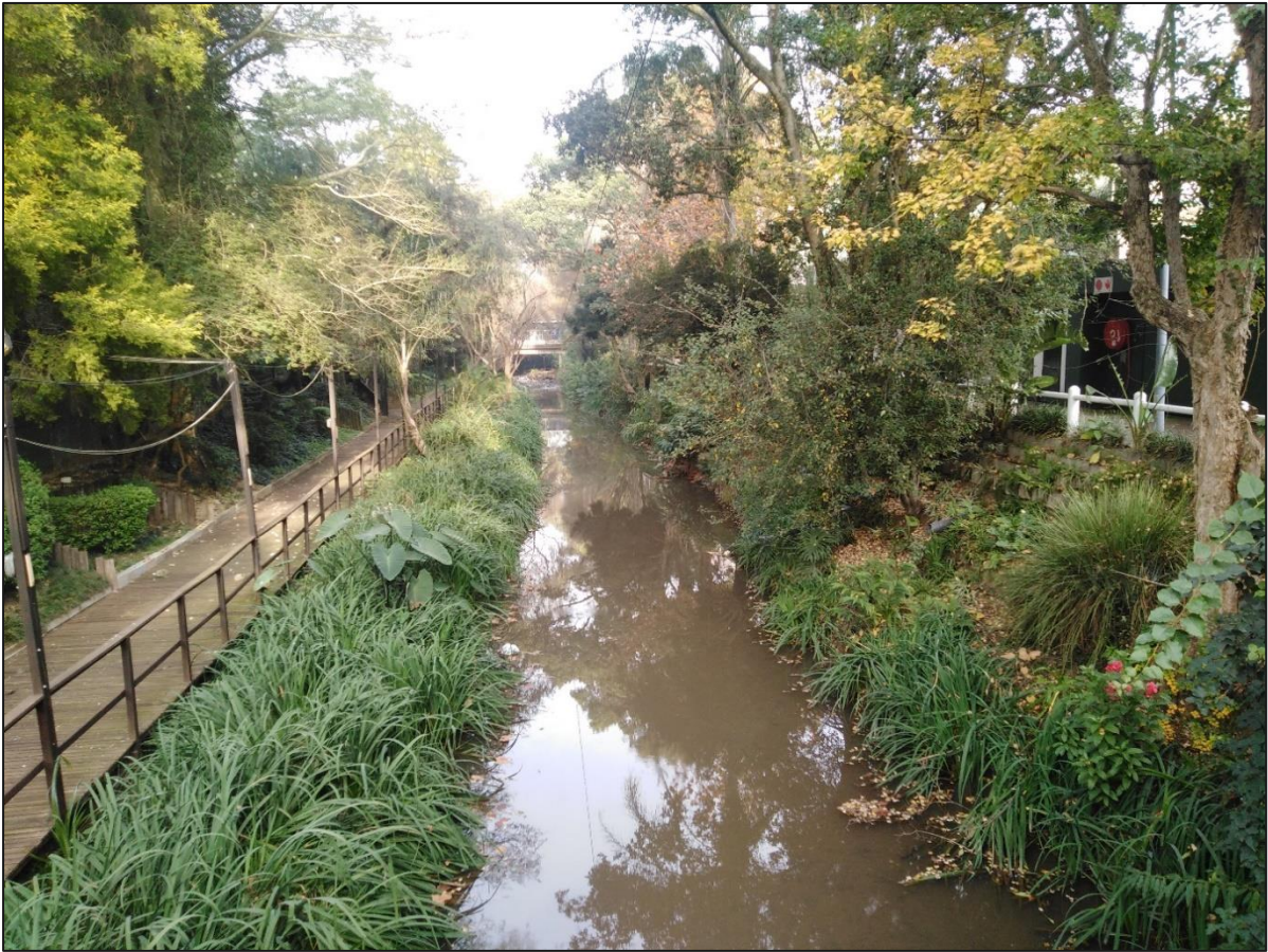
Plate 1: The Dorpspruit River which is in a canalised state, with a walkway along the side.