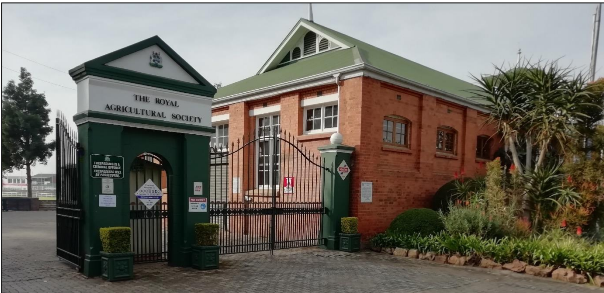
Plate 7: Main Gate Post and Gate House which constitutes an important heritage structure.