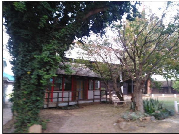
Plate 10: Some of the many existing buildings within the site.