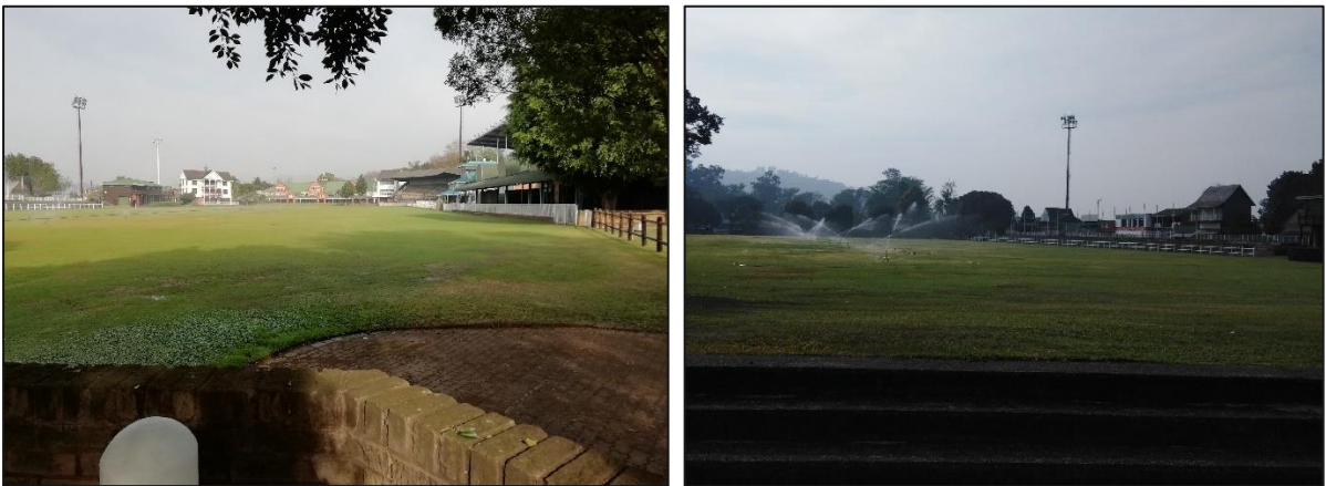
Plate 4: Manicured lawn fields within the site.