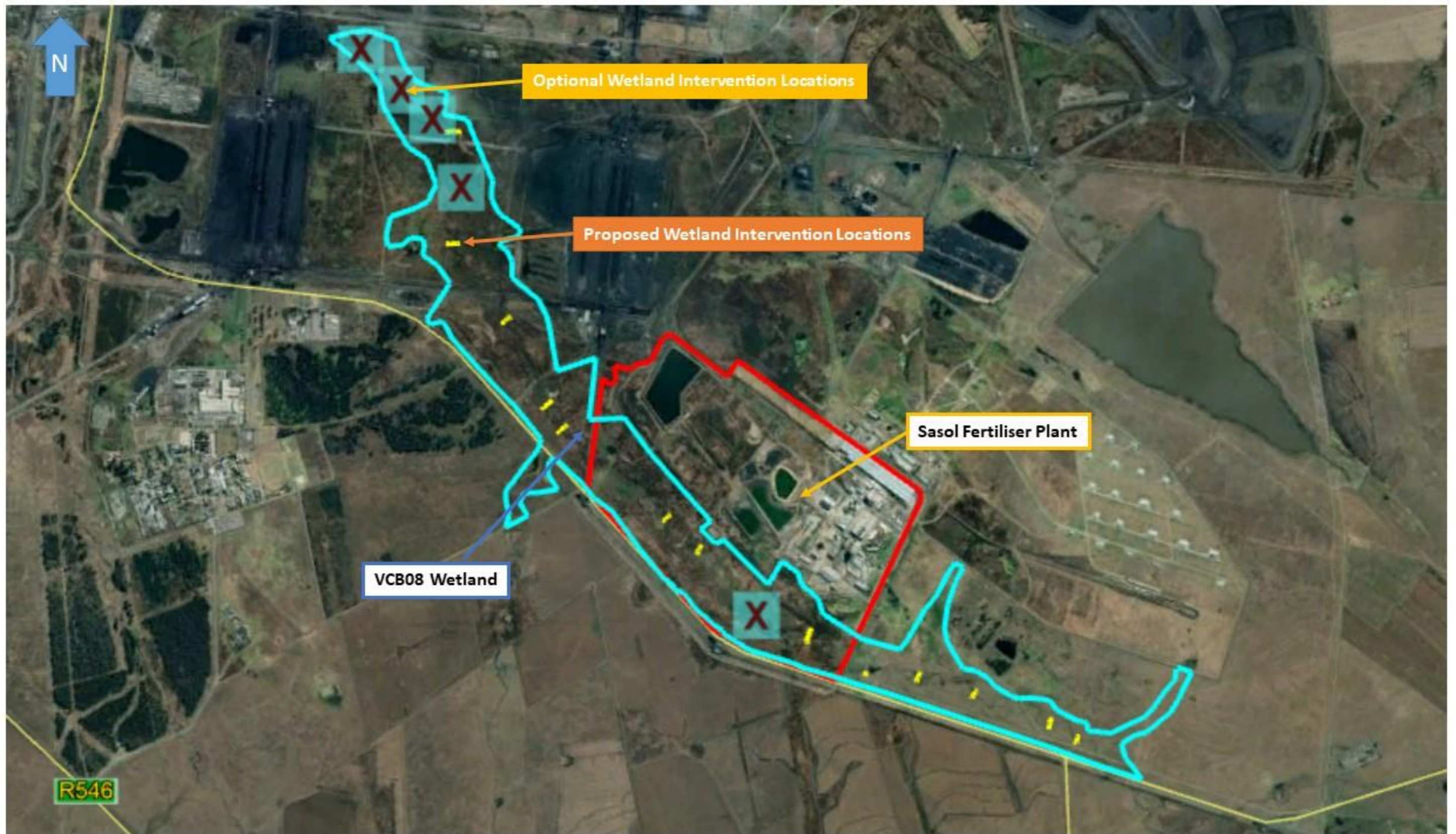
Figure 1: Site Locality Map