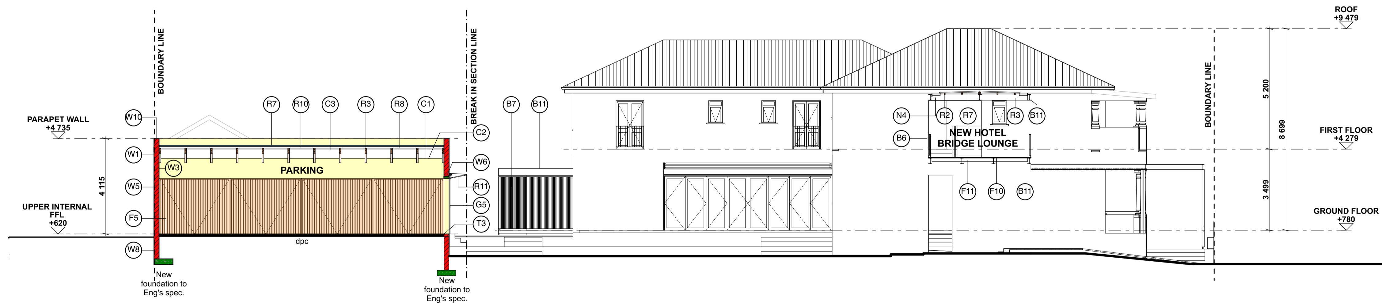
SECTION: B-B 1:100