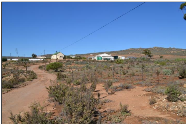
Approach to town of Kotzesrus from desalination plant