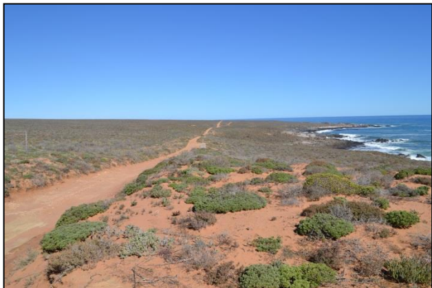
Coastal gravel road leading towards desalination plant