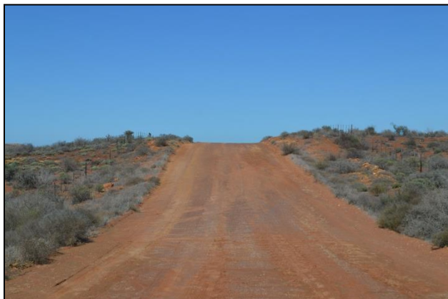
Existing gravel road between Kotzesrus and Zandkopsdrift Mine