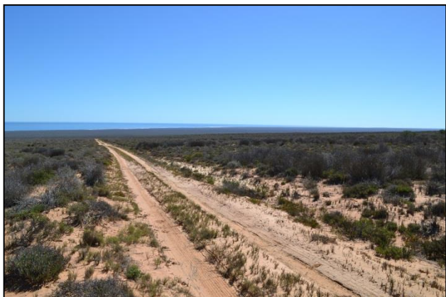
Existing 4 x 4 tracks on Farm Strandfontein 559