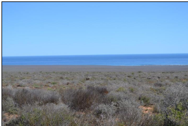
Namaqualand Coastal vegetation on Farm Strandfontein 559