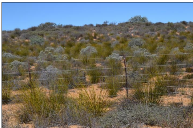
Sensitive Sand Fynbos vegetation en route towards Kotzesrus