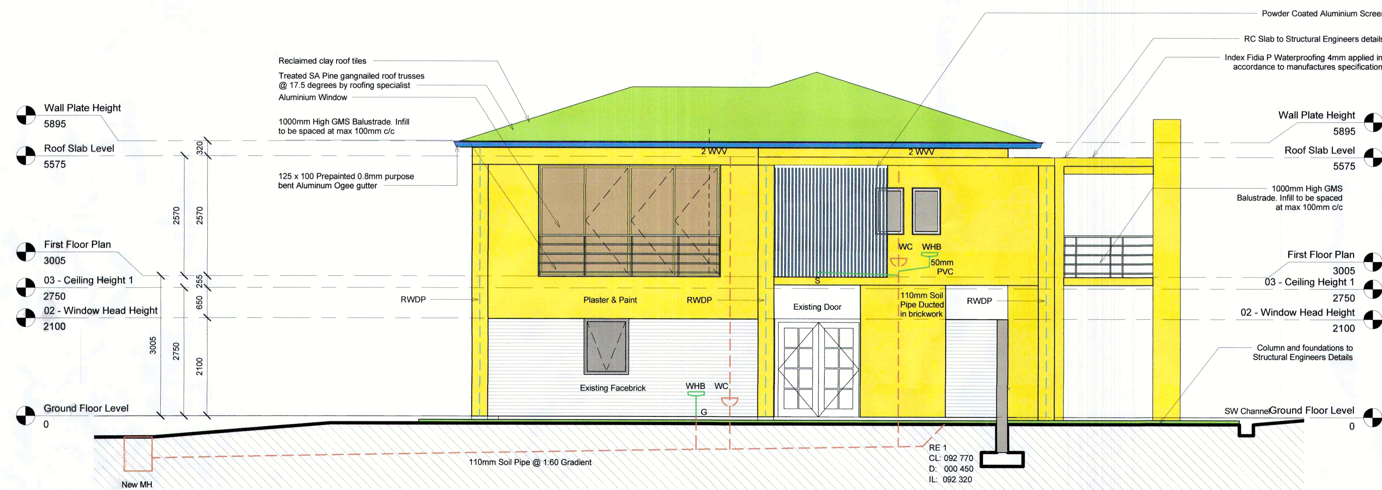
2 West Elevation 1 : 50