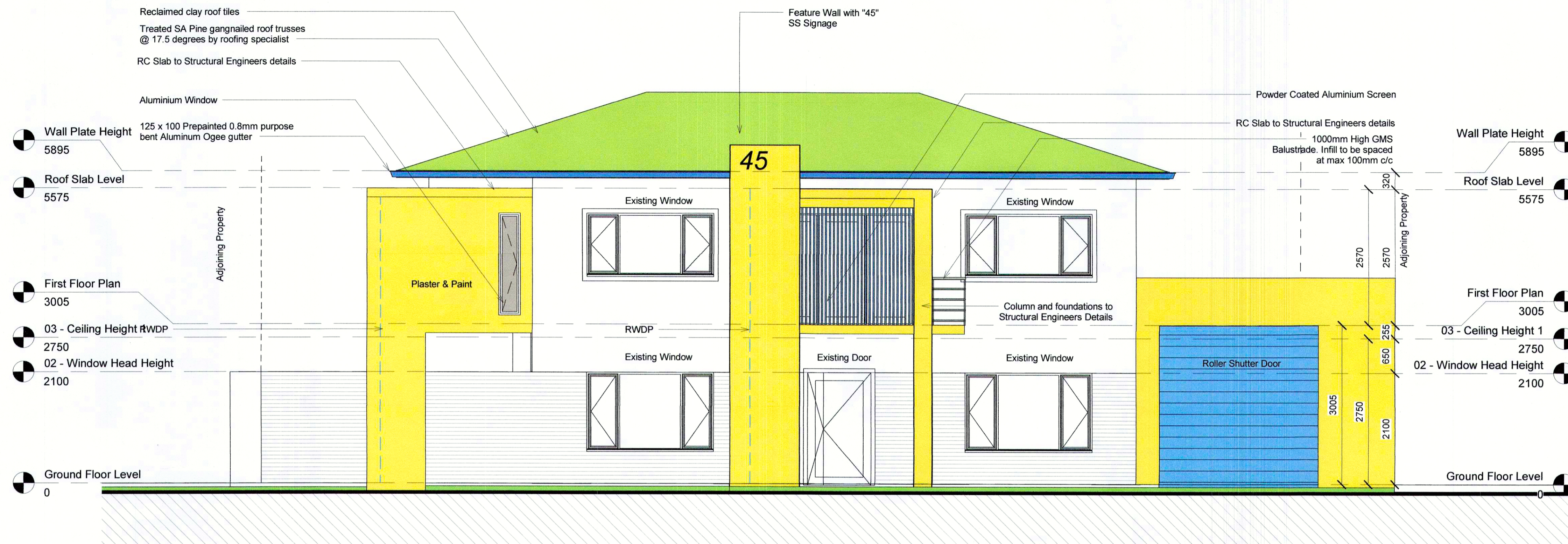
1 South Elevation 1 : 50