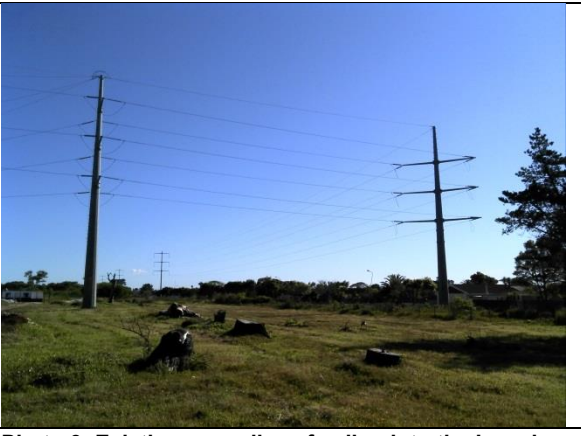
Photo 2: Existing powerlines feeding into the Lorraine Substation and most western point of the proposed line