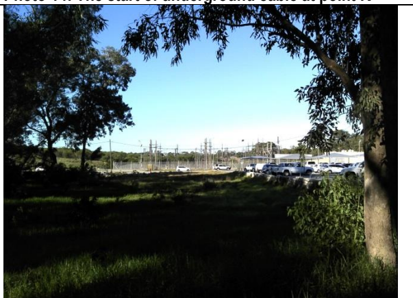
Photo 16: View towards William Moffett Road and the existing 17th Avenue 132 kV Substation