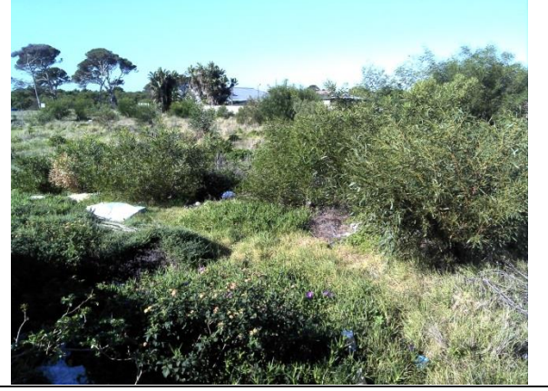
Photo 4: Proposed alignment over Erf 271 with mainly alien vegetation and illegal dumping observed (point D)