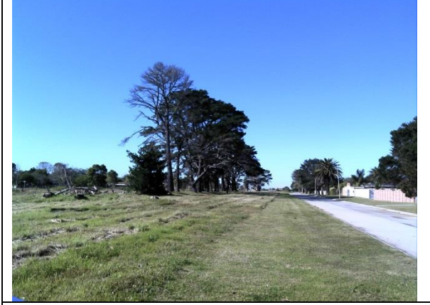
Photo 3: Proposed alignment adjacent to the railway line and Macon Road, Lorraine