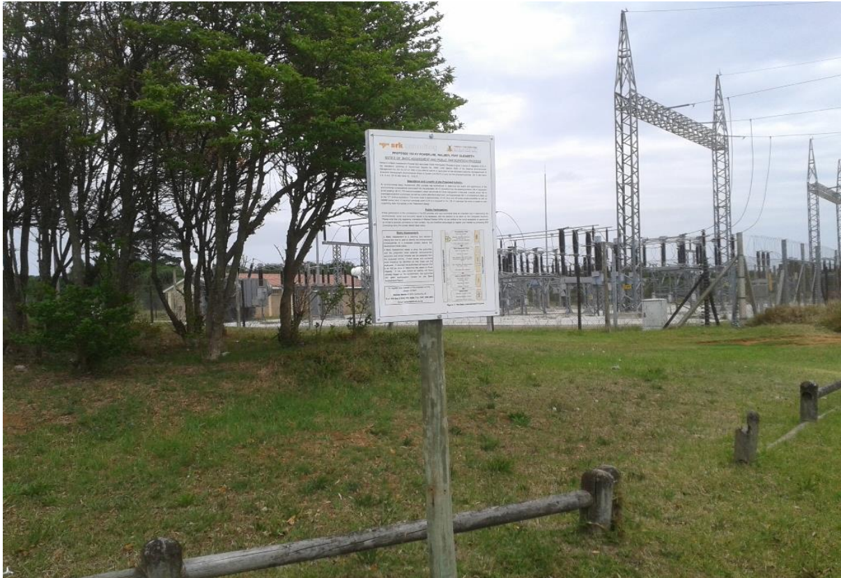
On-site poster placed next to the existing Lorraine 132 kV substation