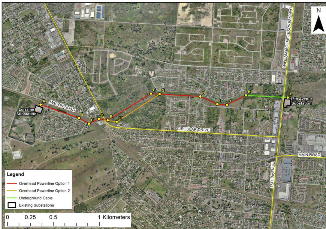
Figure 2: Locality of proposed Walmer 132 kV powerline

To receive further communications regarding this development, please register by sending the completed and signed registration sheet at the back of this document to SRK Consulting.