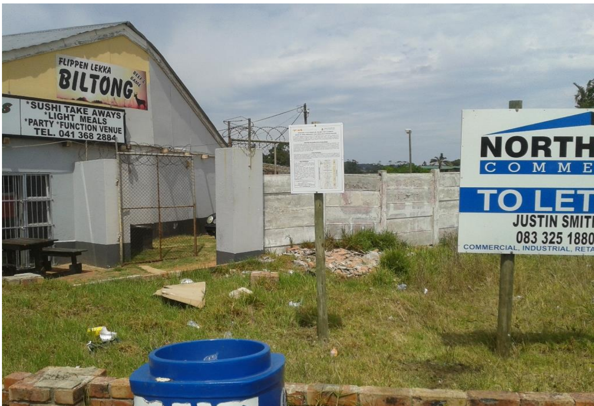
On-site poster placed next to business node in Circular Drive, Lorraine