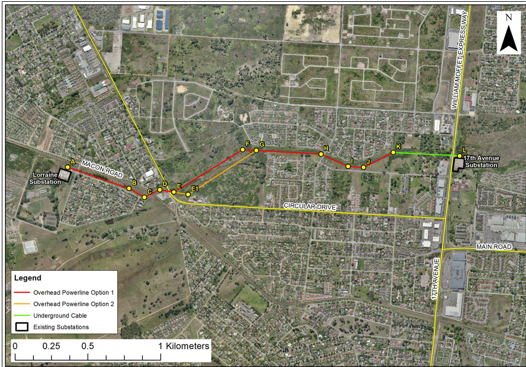
Figure 1: Site locality map for proposed 132kV Walmer Powerline