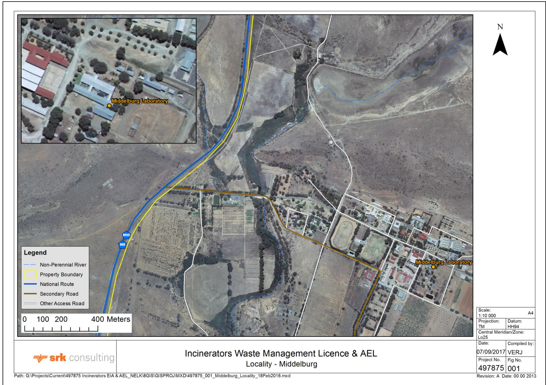
Figure 2: Site Locality Plan