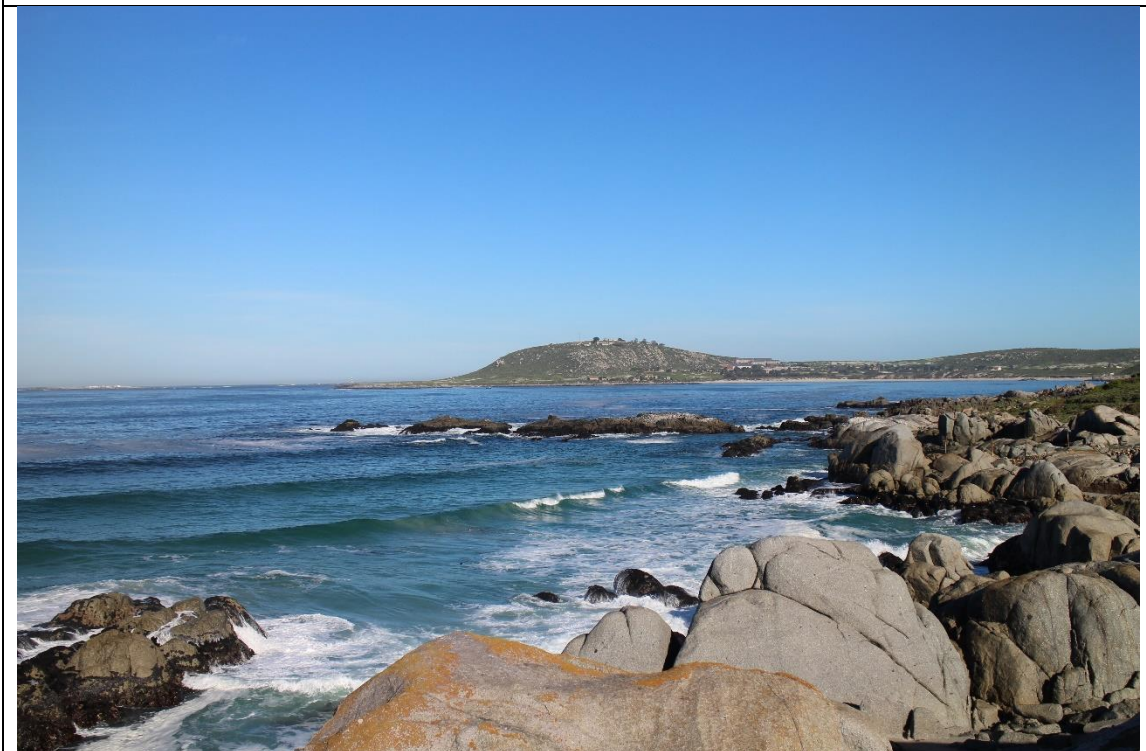
Photo 4: Looking south-west towards Outer Bay (north) from the Causeway.