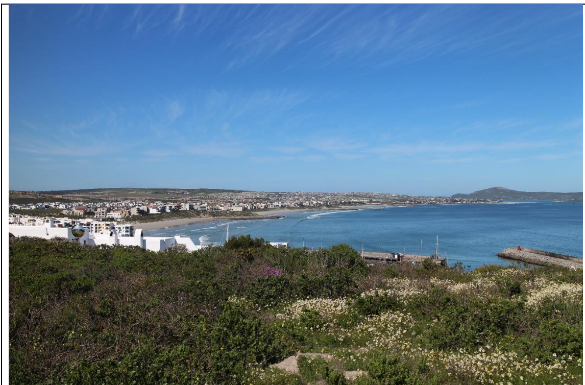
Photo 7: Looking south over Big Bay towards Langebaan, with the Club Mykonos harbour entrance in the foreground.