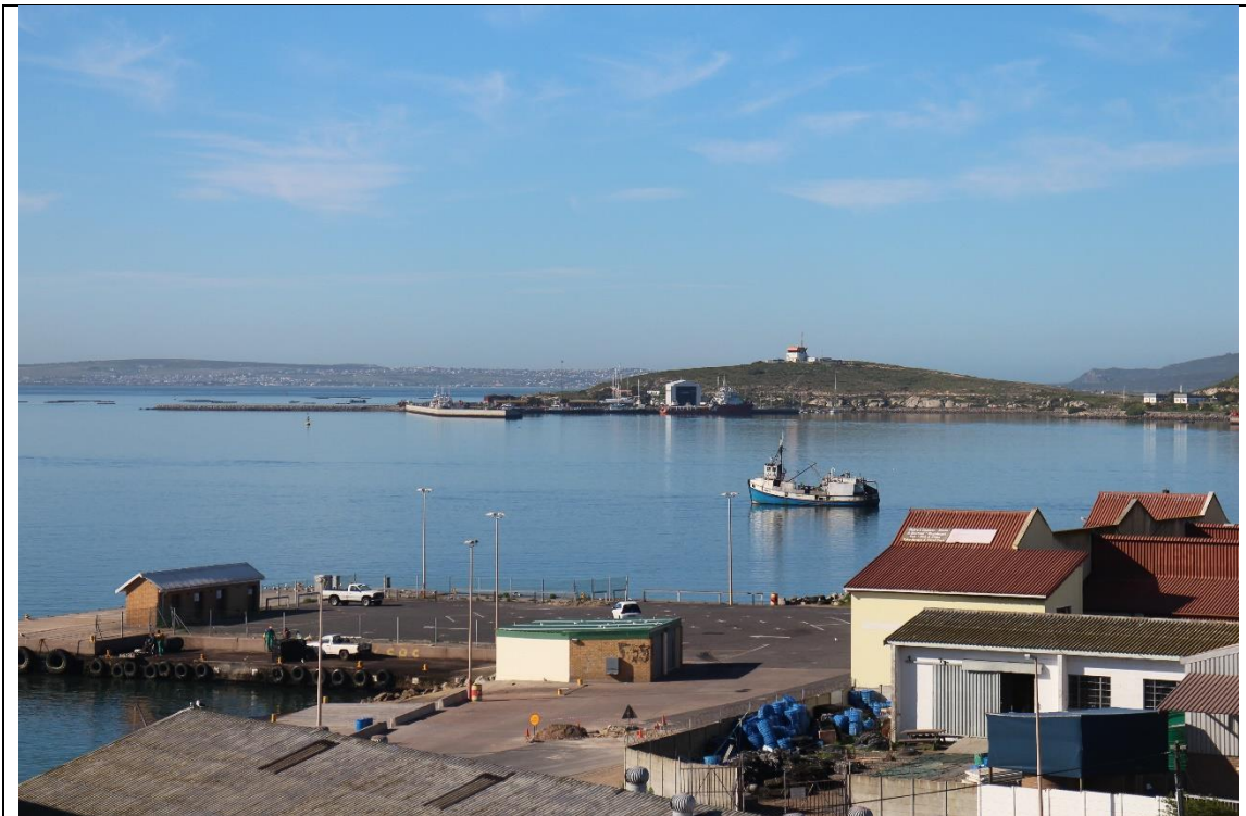
Photo 3: Looking south-east across Small Bay towards Outer Bay (north), with existing mussel rafts visible in the distance.