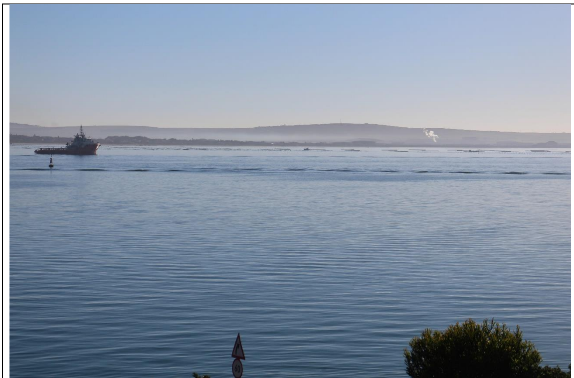
Photo 1: View across Small Bay from the Port of Saldanha, with existing rafts and longlines in the background.