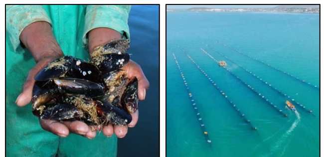
Figure 1: Aquaculture in Saldanha Bay