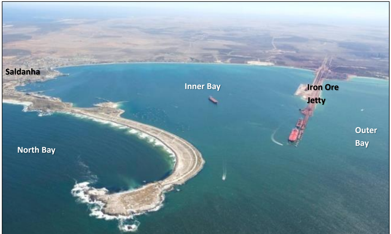
Figure 2: (Partial) View of Saldanha Bay

Saldanha Bay falls within the Cape West Coast Biosphere Reserve. Langebaan Lagoon, located south of and connected to Saldanha Bay, has been declared a RAMSAR wetland of international importance. Langebaan Lagoon forms part of the West Coast National Park located south of Saldanha Bay. Freshwater is scarce and the marine environment is regarded as sensitive.