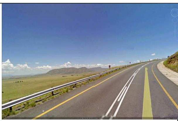
7. Start of climb at km 62.7.