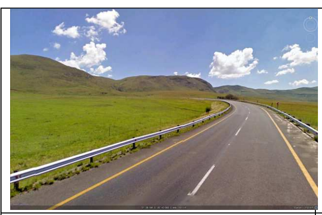
6. Start of the big bend in the road at km 61.3.