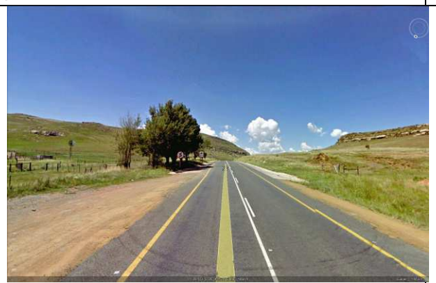
10. End of works at top of pass looking south.