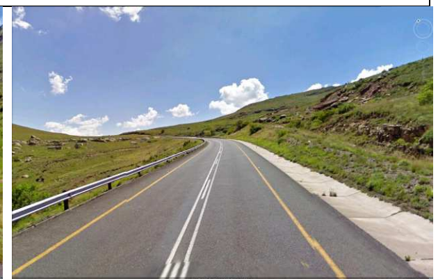
9. The municipal boundary (Maletswa-Inkwanca) near the top of the pass.