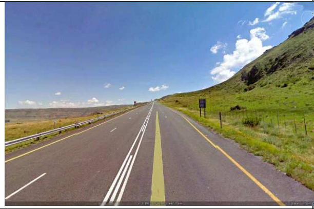
8. The double-lane section of road at midpass at km 63.8.