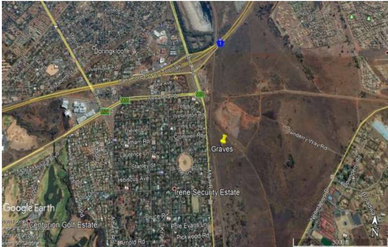
Fig.1: General location of study area in red polygon (Google Earth 2017).

It is clear from this that the grave site and the graves on it date to between the early 1900's and mid 1970's. Also, a large percentage (in excess of 60%), are those of infants and young children.