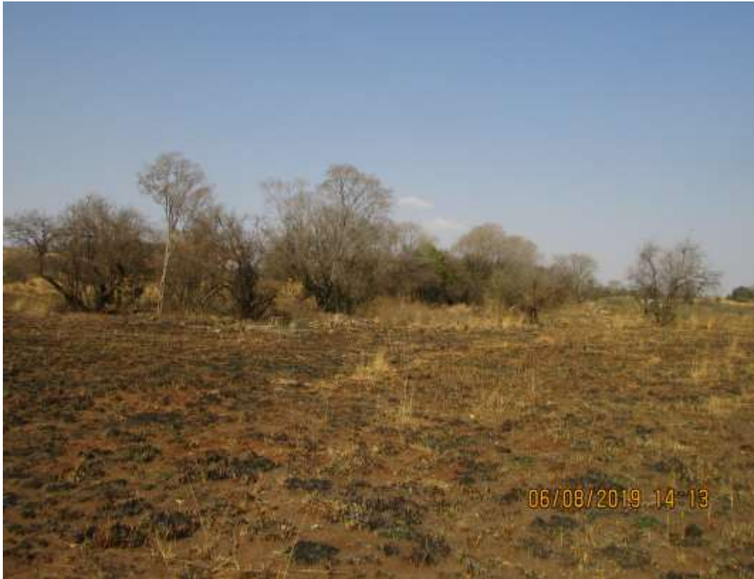
Fig.6: A general view of the Irene X70 Grave Site.

Photos of all the graves, as well as the graves with formal headstones and legible inscriptions were also taken. These will be provided at a later stage. Site Notices were also erected at prominent places on the site, as well as at entrances and roads to and close to the site. Newspaper Advertisements will also be placed in due course soon as part of the required social consultation process before permit applications can be made. Proof of these advertisements will also be provided once they have been placed.