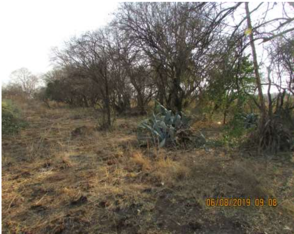
Fig.3: A section of the site after bush clearance.