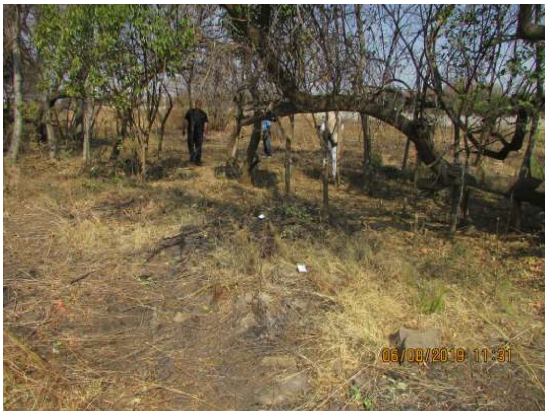
Fig.5: Another section of the site with grave numbering in progress.