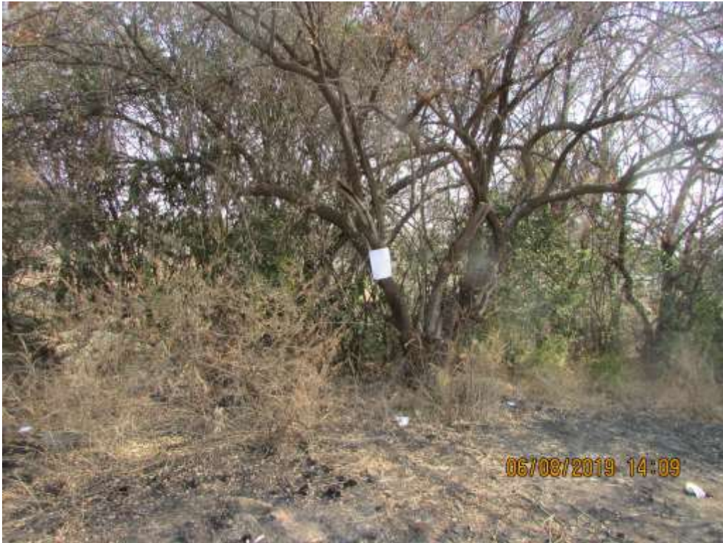
Fig.7: A view of one of the erected on-site Notices.