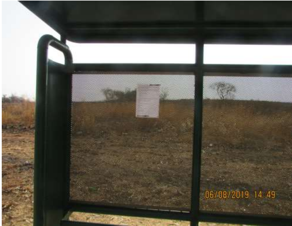
Fig.11: Site Notice at a Bus Stop close to the area.

Should there be any questions or comments on the contents of this document please contact the author as soon as possible.