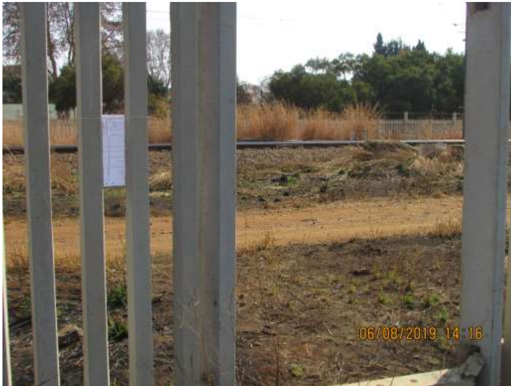
Fig.9: Site Notices erected at an entrance to the site close to the railway line.