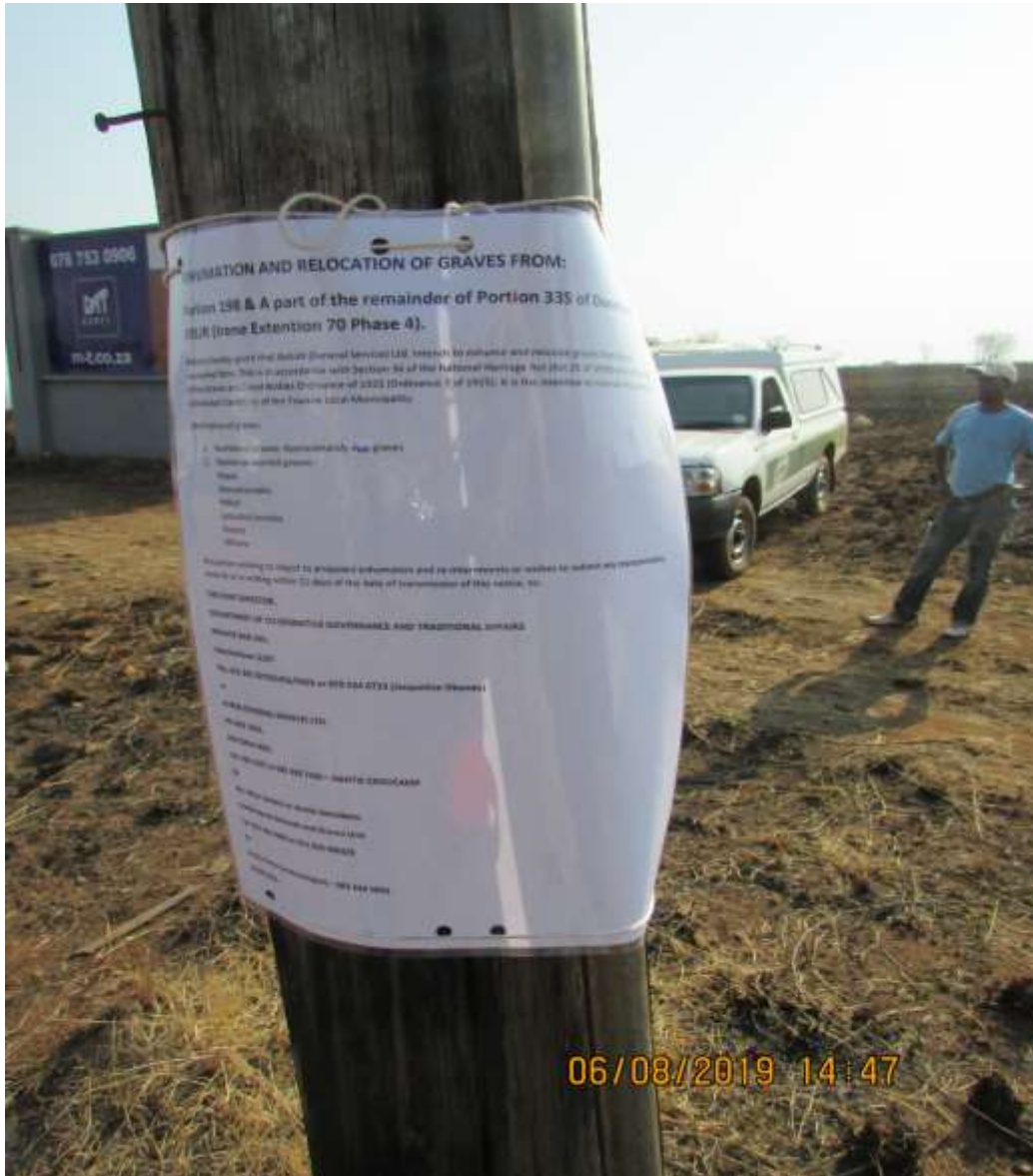
Fig.10: Site Notice erected close to the M&T Notice Board at an entry road to the site.