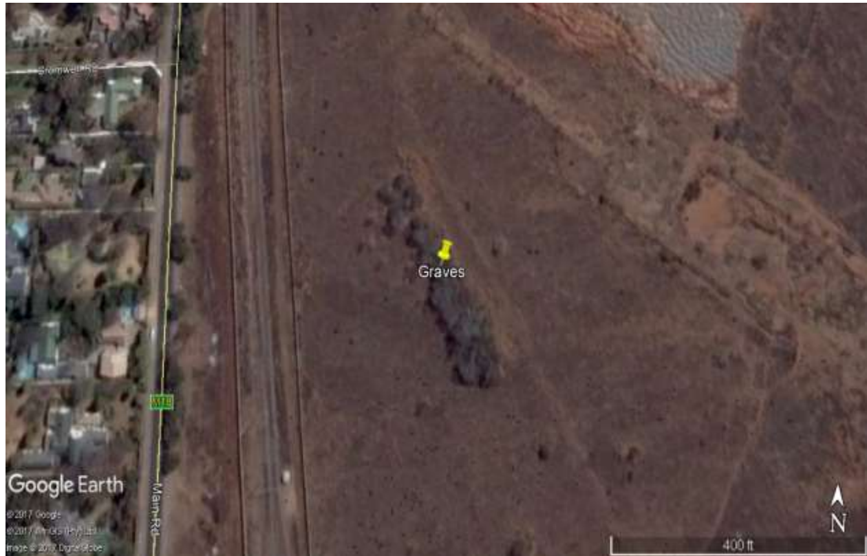
Fig.2: Closer view of area and two sections of the site with graves.