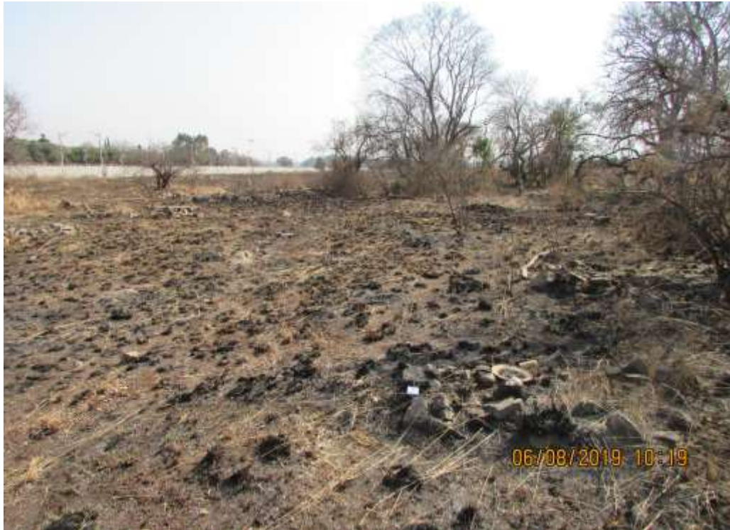
Fig.4: Another section with graves clearly visible, as well as Grave Numbers. The graves have each been given a number starting with IR (for Irene).