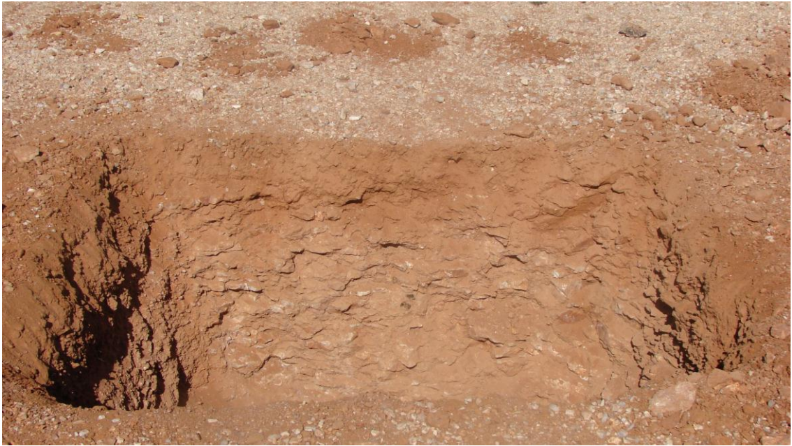
Photograph 1 : Alheit