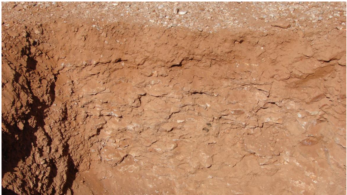
Photograph 2 : Alheit