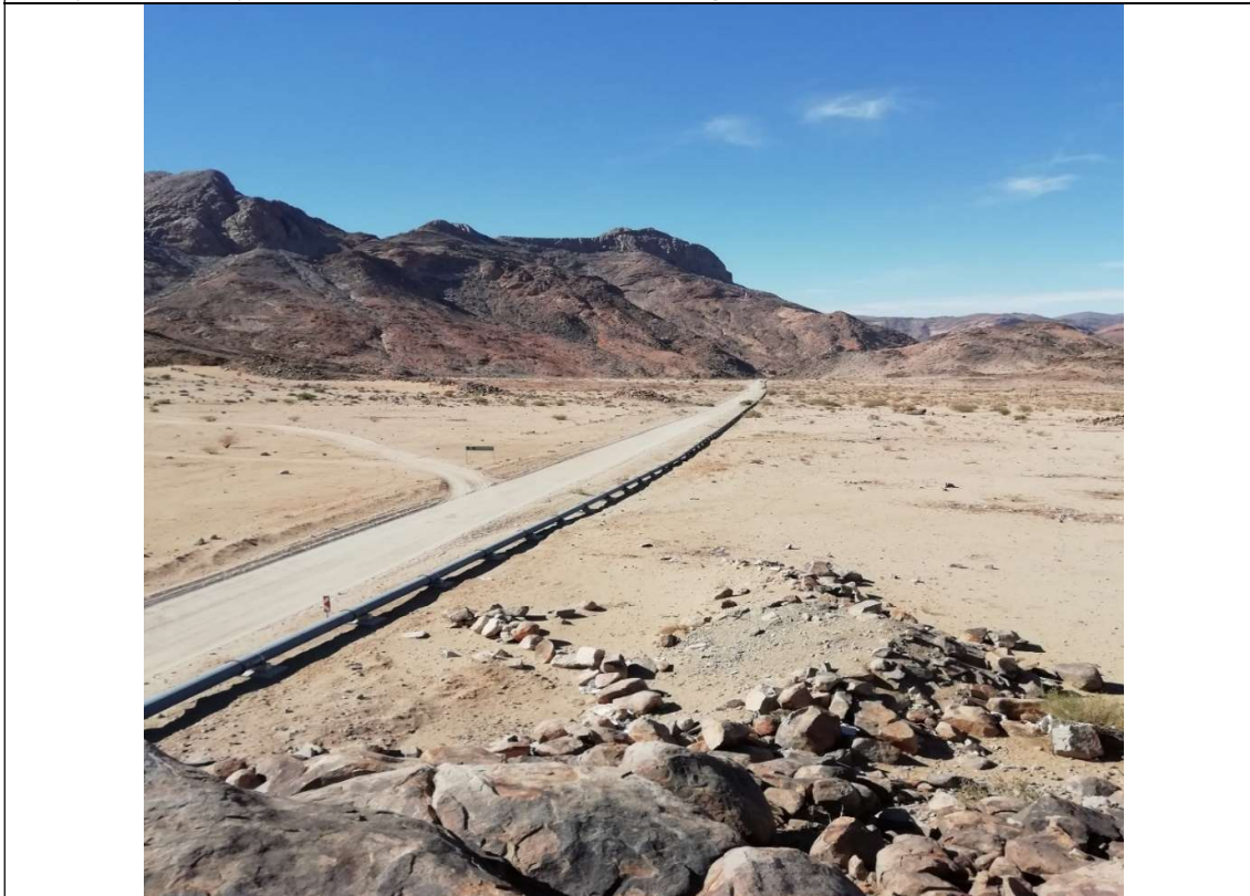
Plate 2: Photo taken of Pipeline servitude at closest proximity to the Town Pella, which lies 90 degrees to the right of this photo.