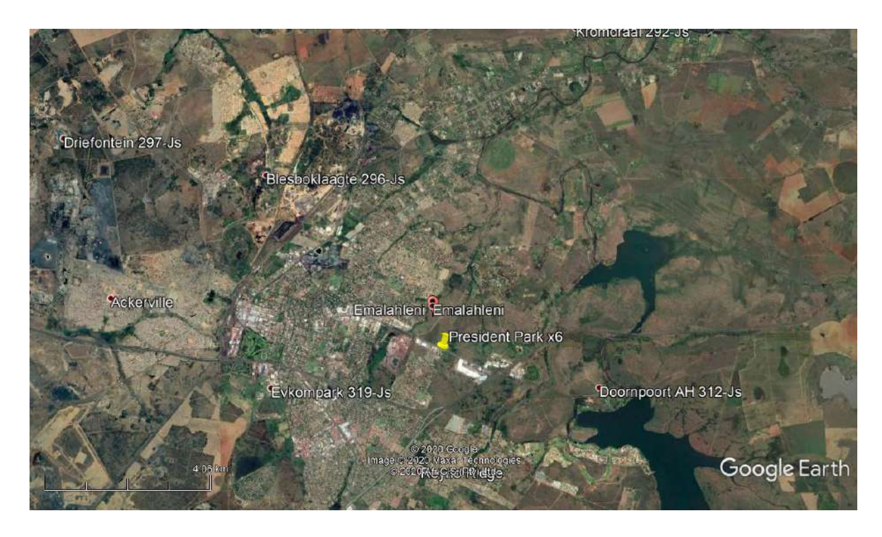
FIGURE 2: LOCATION OF THE SITE WITHIN EMALAHLENI.