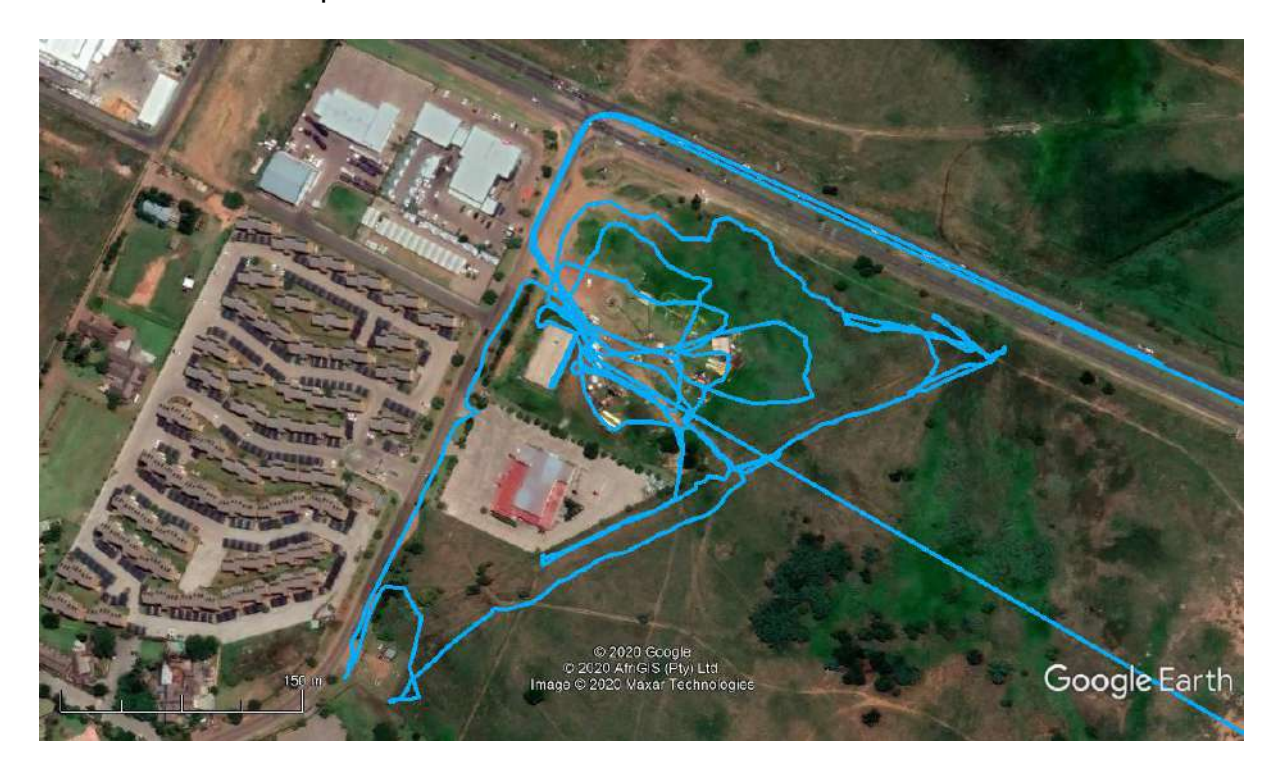
FIGURE 4: GPS TRACK OF THE SURVEY.

The vegetation cover was mostly between low and medium in height and with dense under footing, consisting mostly of grasses. The horizontal archaeological visibility was therefore good and the vertical archaeological visibility good as well. The size of the area is relatively small and flat. One could see from one end to the other, north to south. Tall grass obscured the eastern side of the site. It is about 3 Ha and the survey took 2 hours to complete.