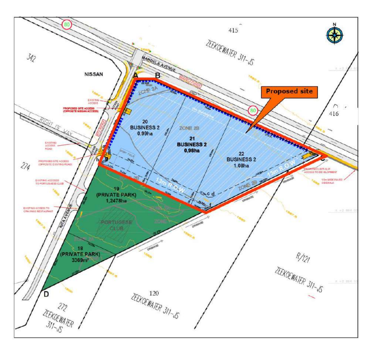
FIGURE 3: SITE DEVLOPMENT PLAN (ADIENVIRONMENTAL).