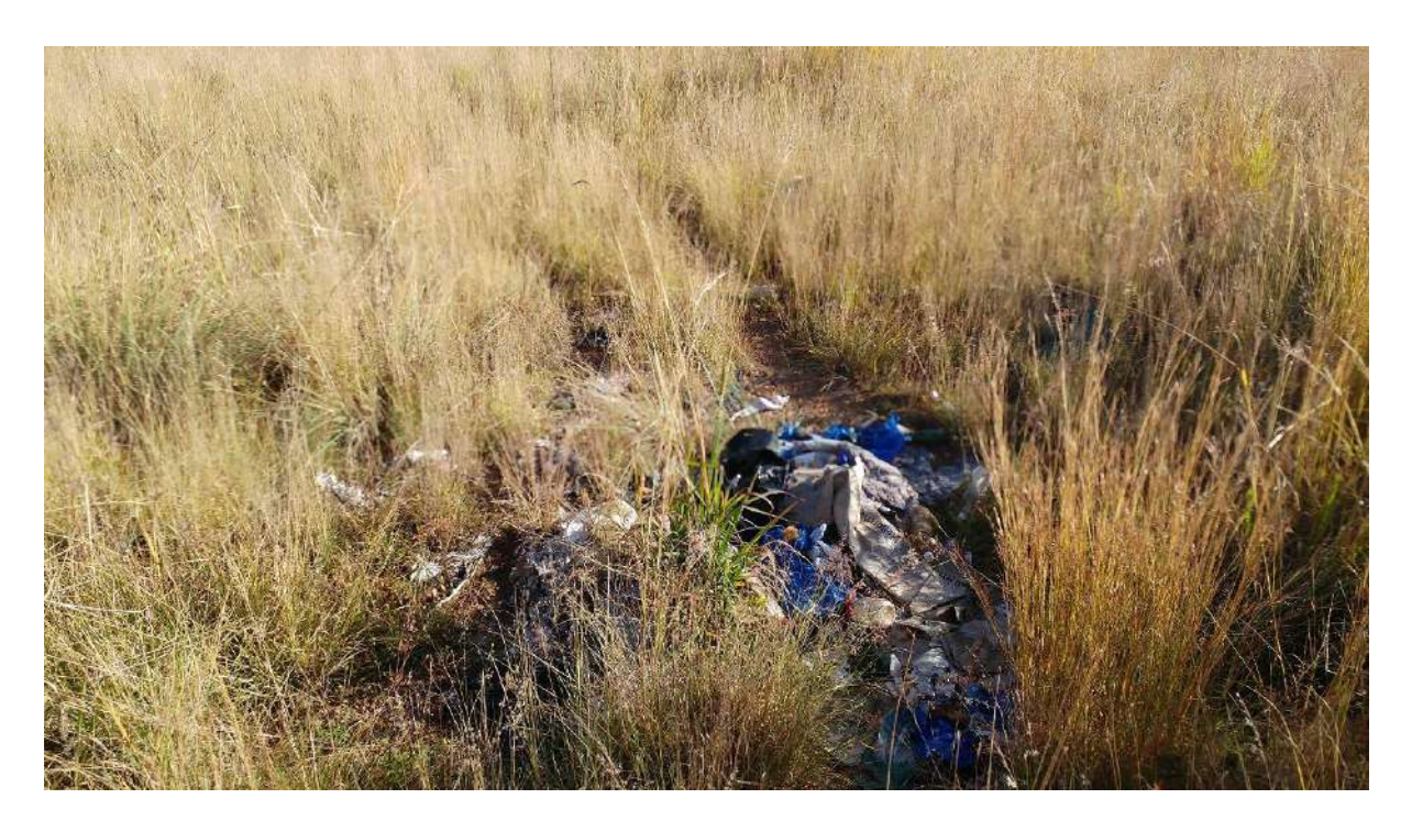
FIGURE 8: ILLEGAL DUMPING IN THE SURVEYED AREA.