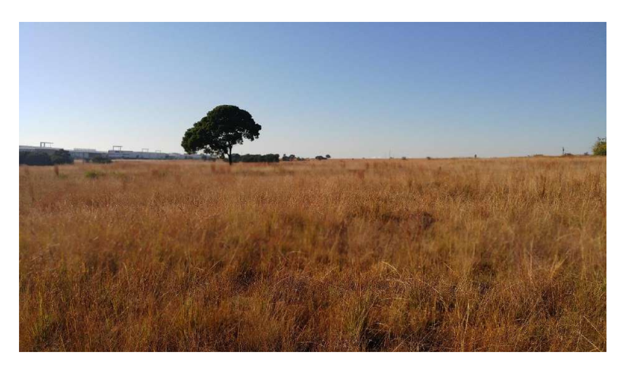
FIGURE 6: OPEN FIELD TO THE EAST OF THE SURVEYED AREA.