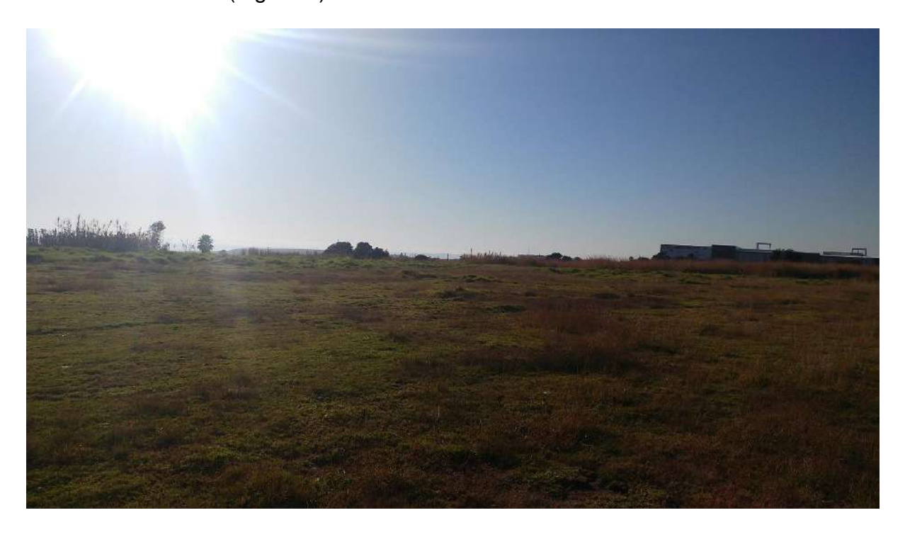
FIGURE 5: GENERAL VIEW OF THE SURVEYED AREA.

The surveyed site is on an open area and the vegetation consists mostly of short to medium high grasses (Figure 5). An open field is to the east (Figure 6), and a Portuguese clubhouse to the south (Figure 7). The topography of the area is reasonably flat, and the soil is hard and compacted. No rivers or outstanding natural features are present. Minor illegal dumping was found to the eastern side of the site (Figure 8). To the south of the surveyed area the is an old basket/netball court about 48 m x 25 m in size (Figure 9).