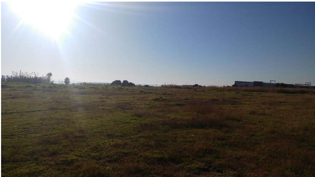
FIGURE 5: GENERAL VIEW OF THE SURVEYED AREA.

The surveyed site is on an open area and the vegetation consists mostly of short to medium high grasses (Figure 5). An open field is to the east (Figure 6), and a Portuguese clubhouse to the south (Figure 7). The topography of the area is reasonably flat, and the soil is hard and compacted. No rivers or outstanding natural features are present. Minor illegal dumping was found to the eastern side of the site (Figure 8). To the south of the surveyed area there is an old basket/netball court about 48 m x 25 m in size (Figure 9).