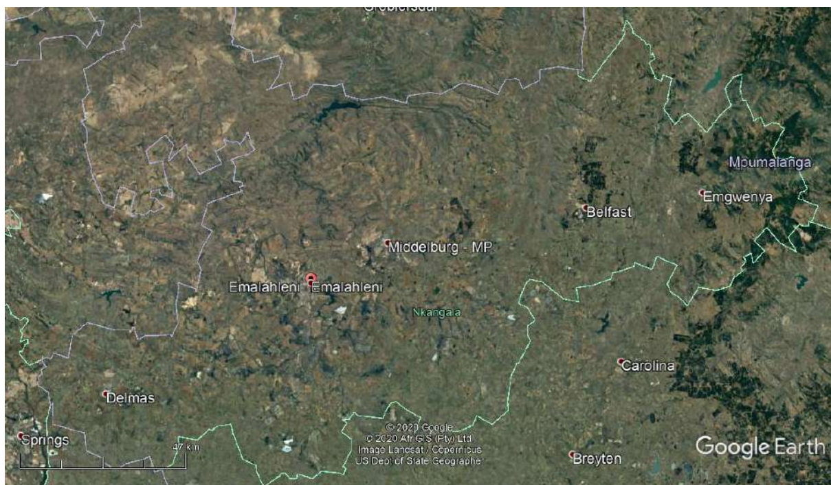
FIGURE 1: LOCATION OF EMALAHLENI IN THE MPUMALANGA PROVINCE.

The Client indicated the area to be surveyed. This was done on foot and via off-road vehicle in May 2020.