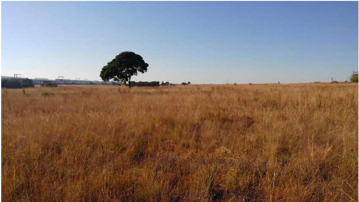
FIGURE 6: OPEN FIELD TO THE EAST OF THE SURVEYED AREA.