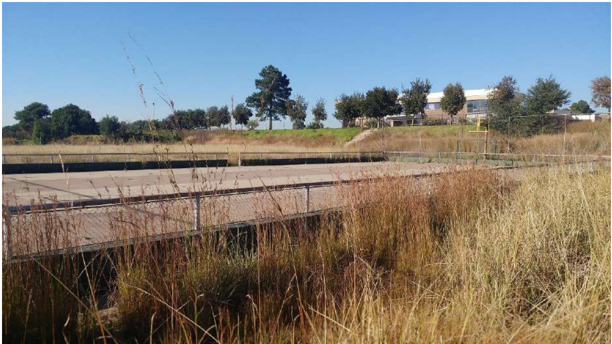
FIGURE 9: OLD BASKETBALL/ NETBALL COURT IN THE SURVEYED AREA