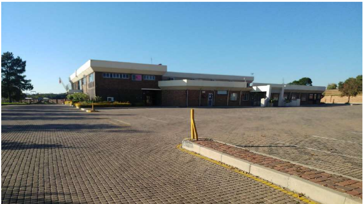
FIGURE 7: PORTUGUESE CLUBHOUSE SOUTH OF THE SURVEYED AREA.