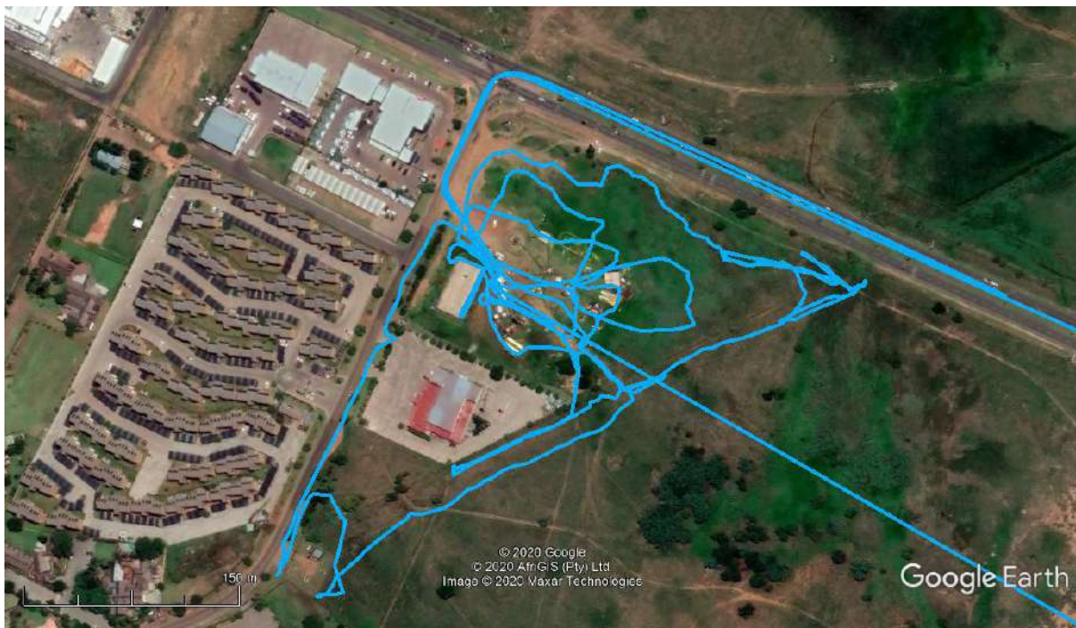
FIGURE 4: GPS TRACK OF THE SURVEY.

The vegetation cover was mostly between low and medium in height and with dense under footing, consisting mostly of grasses. The horizontal archaeological visibility was therefore good and the vertical archaeological visibility good as well. The size of the area is relatively small and flat. One could see from one end to the other, north to south. Tall grass obscured the eastern side of the site. It is about 3 Ha and the survey took 2 hours to complete.