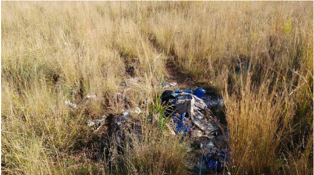
FIGURE 8: ILLEGAL DUMPING IN THE SURVEYED AREA.