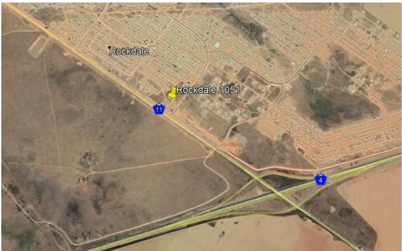
Figure 1 - Location map

The area under consideration is erf 1051, Rockdale, Middelburg, Mpumalanga.