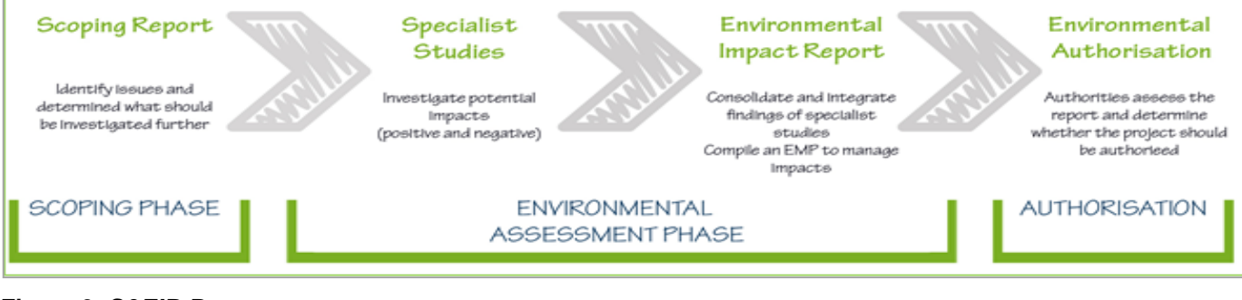
Figure 3: S&EIR Process