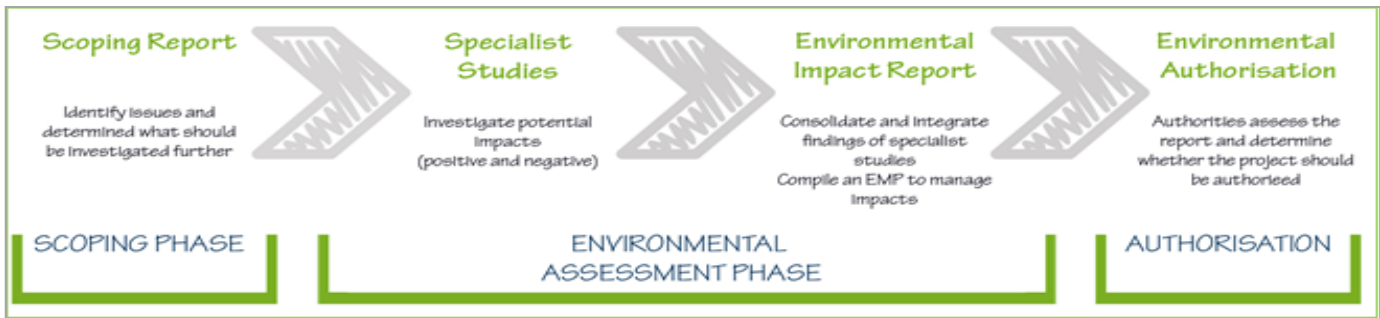
Figure 3: S&EIR Process