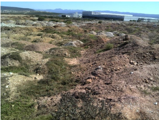
Photo 5 View from the top (north) of the site boundary looking north towards the Nelson Mandela Bay Logistics Park (also see illegal dumping).