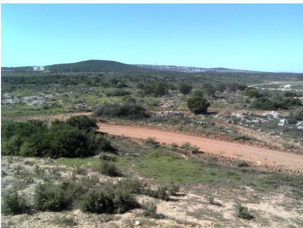
Photo 1 View from the north looking at the southeast of the site.