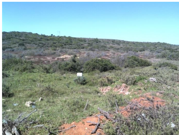
Photo 10 Vegetation on the site showing some of the thicket type vegetation.