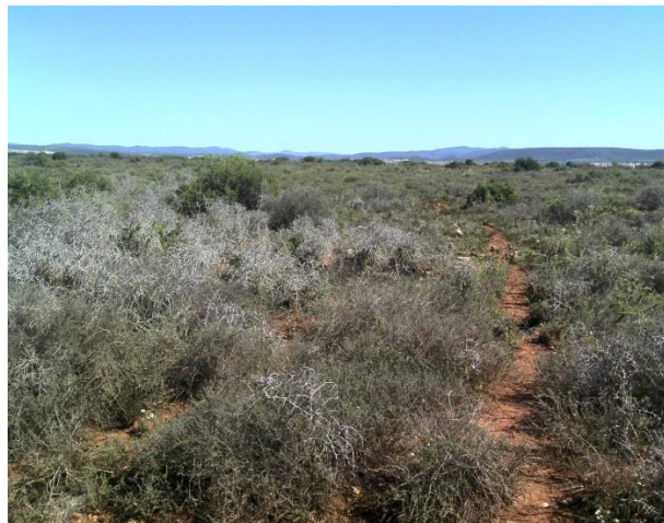
Photo 8 General vegetation of the site.