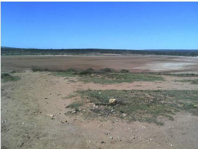
Photo 7 The wetland (modified pan/ depression) situated 100 m downstream (south) of the site.