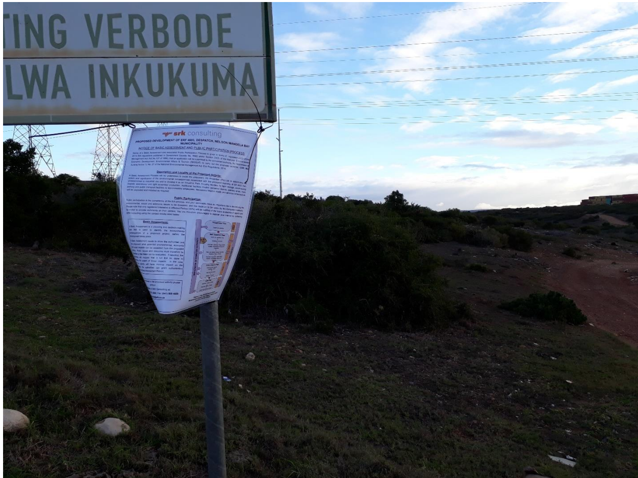
Onsite poster placed at the entrance of the temporary access road – just off the R368