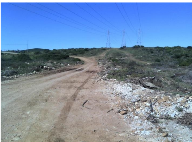
Photo 11 Informal gravel access road to the site.