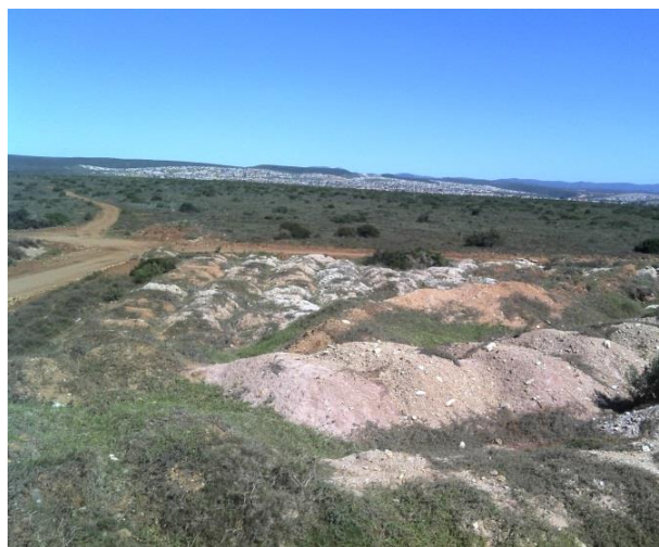
Photo 4 View from the north looking at the west of the site.