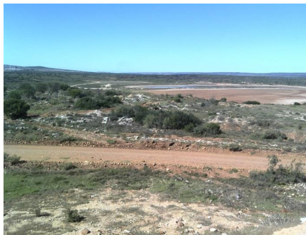
Photo 2 View from the north looking at the south of the site.