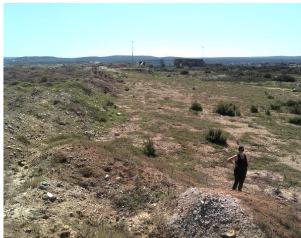
Photo 6 View from the top (north) of the site boundary looking eastwards toward the R368.