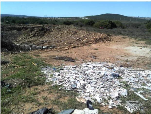
Photo 9 Illegal dumping on the site.