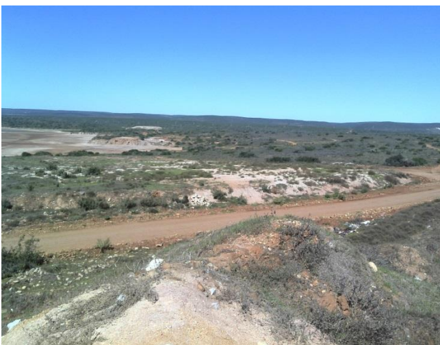
Photo 3 View from the north looking at the southwest of the site.