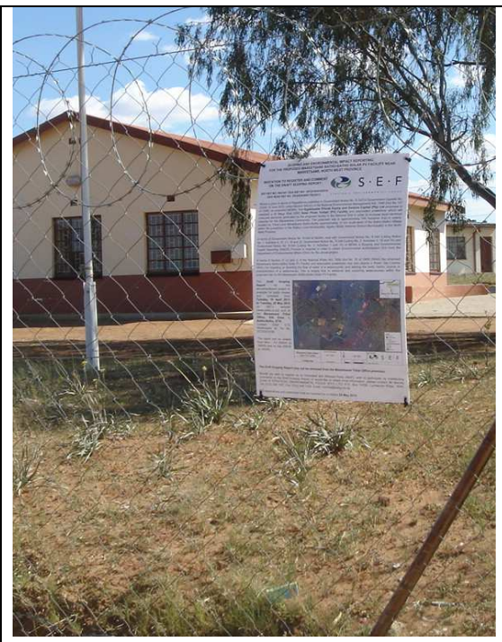
Photograph 1: Site Notice placed on the fence of the Batho-Batho CommunityCentre