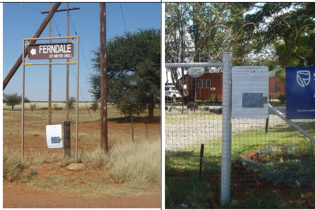
Photograph 3: Site Notice placed next to the Ferndale (CP Meyer) entrance

Photograph 2: Site Notice placed at the gate of the Batho-Batho Intermediate School