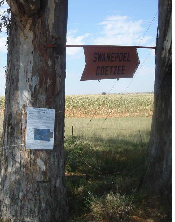
Photograph 8: Site Notice placed at the R375 T-Junction to Swanepoel and Coetzee farms