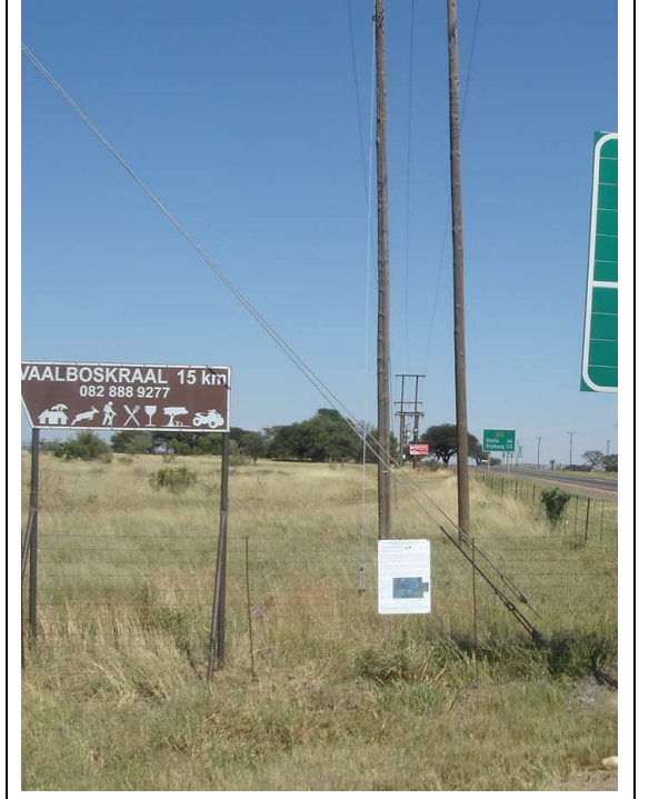
Photograph 7: Site Notice placed at the R375 –N18 Junction