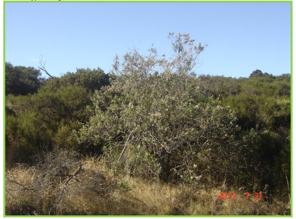
Plate 2: Typical vegetation on site.