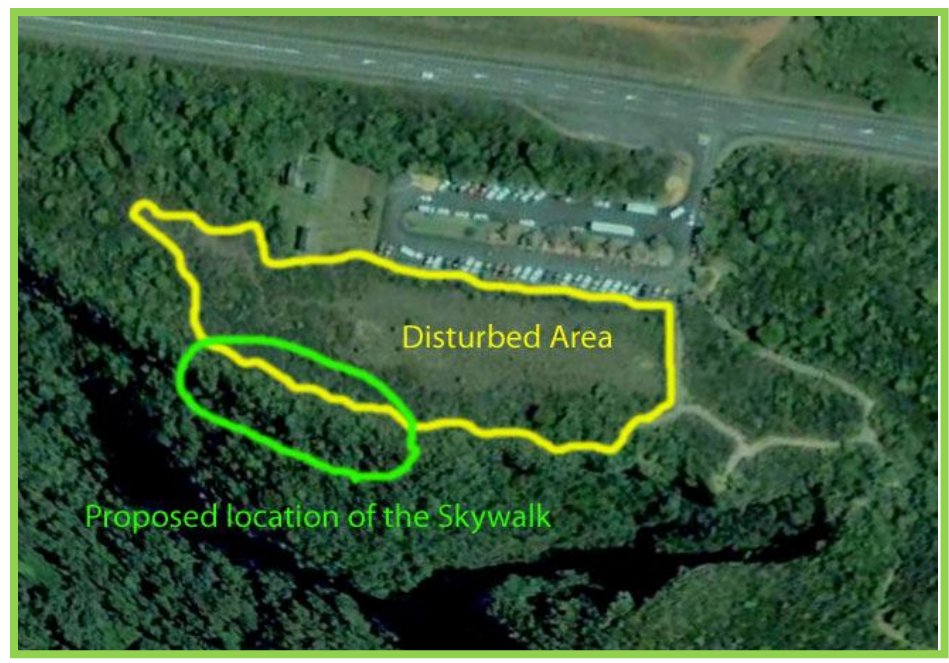
Figure 2: Skywalk Location