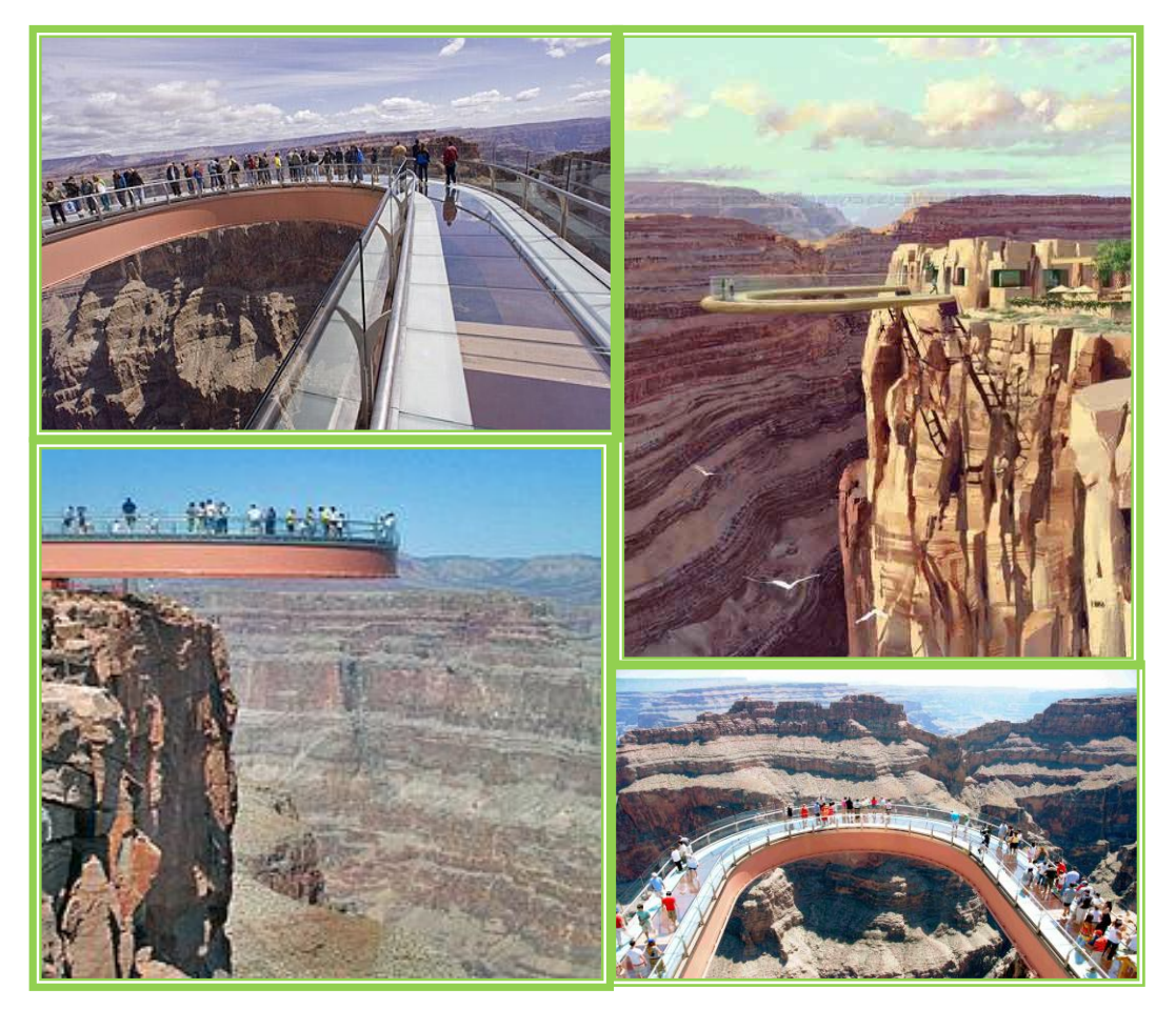
Figure 3: Proposed Skywalk Concept