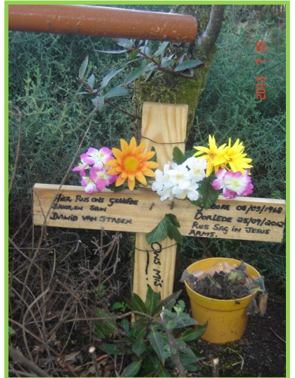
Plate 3: Remembrance cross for a deceased individual.

No heritage resources of significance were identified on site and thus no further permitting processes are required. However, there was a remembrance cross for a deceased person at one of the viewing points (Plate 3). The staff on duty at the God's Window thought that it could be where ashes had been scattered as no suicidal event had occurred at the site recently (2012). This cross has low heritage significance as there is no human remains associated with it.