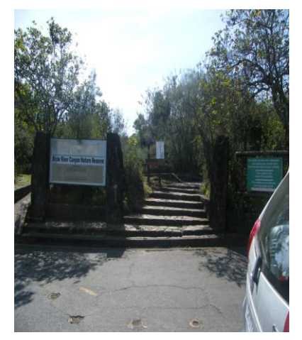
Figure 1: Proof of Site Notices