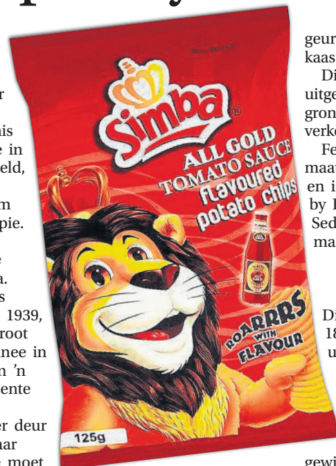
Simba het onlangs aangekondig dat die tamatiegeur-skyfies van die mark verwyder word.

Wat 'n sukses was dit nie. Met 'n ellelange lys bestellings is hy terug plaas toe.