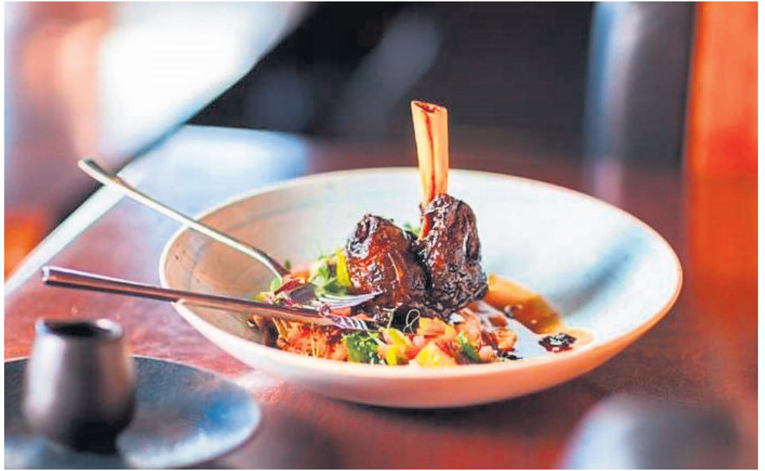
Lamb shank, paired with barley risotto and butternut, is the perfect meal to ward off winter chills.

Garnish with microgreens. The recipe serves four people.