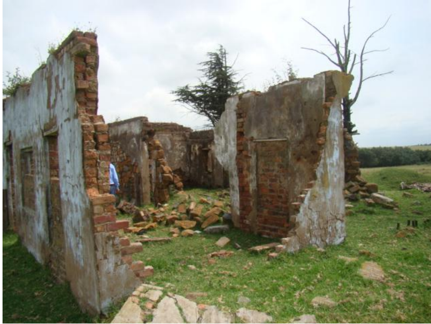
Fig. 11: Ruin of farmhouse. The original structure was built with local stone and later new additions, with fired bricks, were added on.