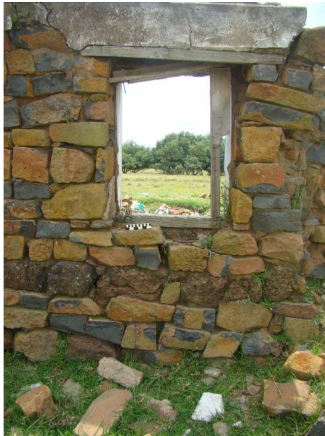
Fig. 12: Detail of a wall with the local stone clearly visible.