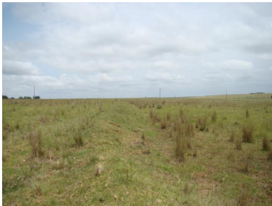
Fig. 4: Large contours were made to control erosion for the agricultural lands. The Kikuyu grass covers most of the farm and was planted for grazing.