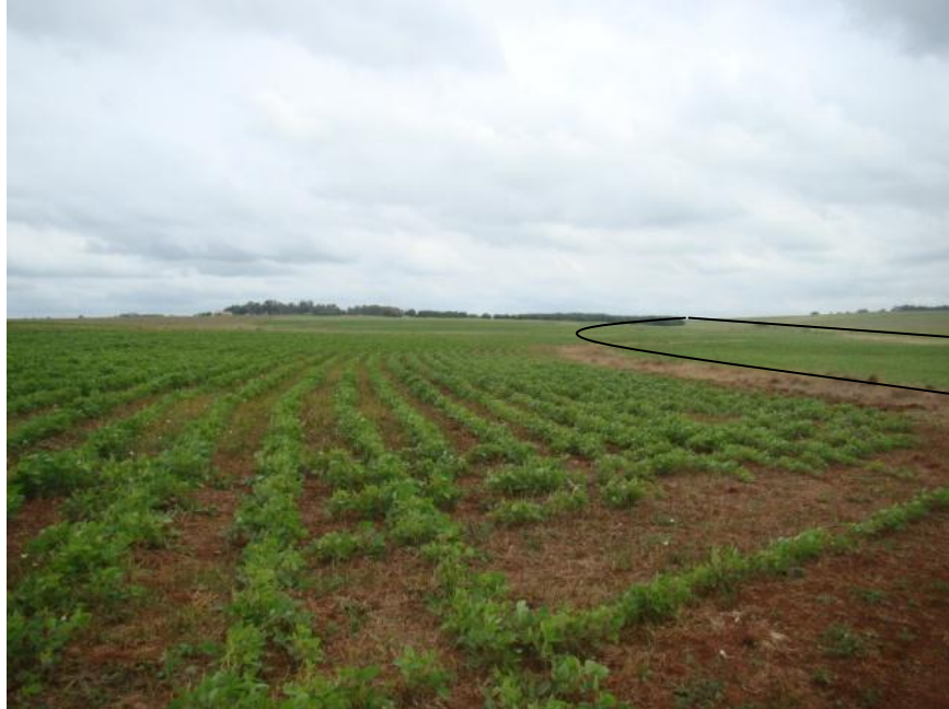
Fig. 7: General view from the north towards the south. The bean crop is visible in the foreground, the wattles in the background. The wetland is indicated with a black line.