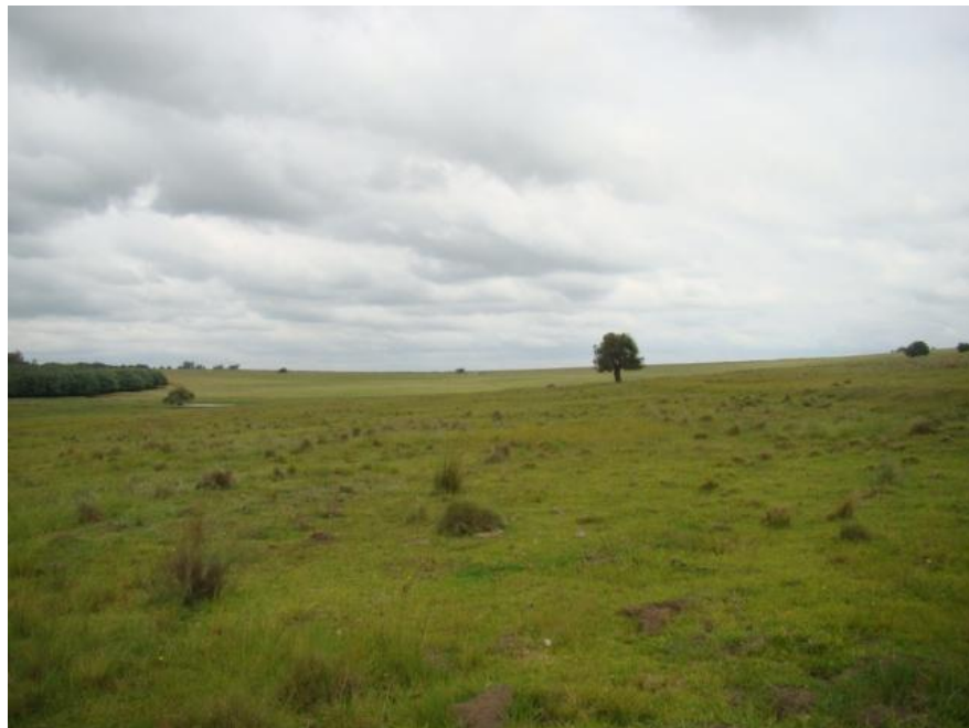
Fig. 8: General view of the study area from the N-W corner towards the south. Wattle plantation is visible on the left.