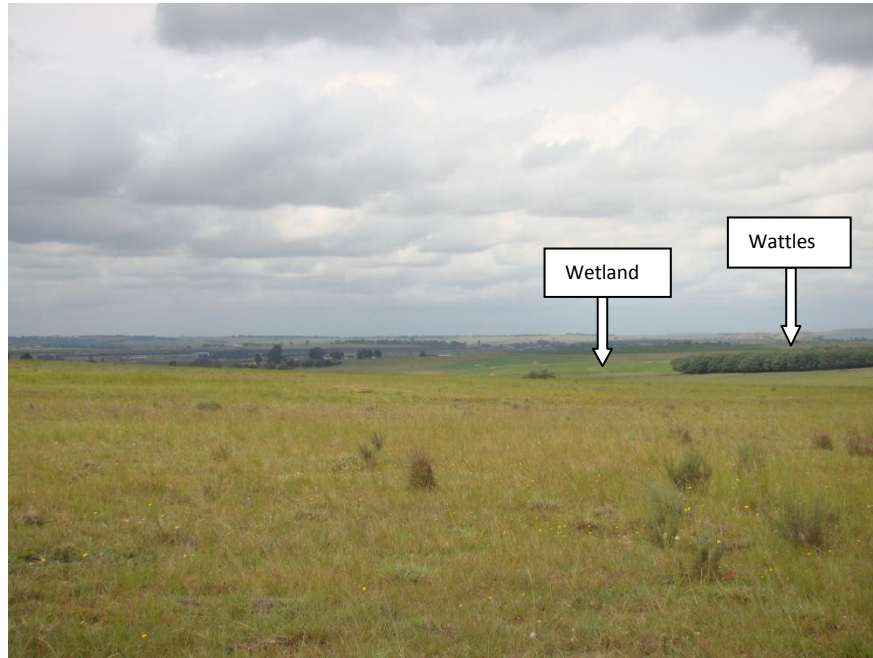
Fig. 1: General view of the study area. The view is from south to north with the wattle plantation visible towards the east. The lowest point is the wetland.