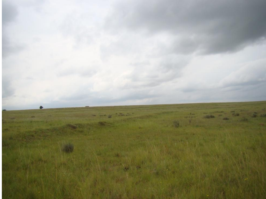
Fig. 9: Contour lines are visible throughout the study area. The entire area was previous agricultural lands, which are now mostly fallow (see Appendix 3).