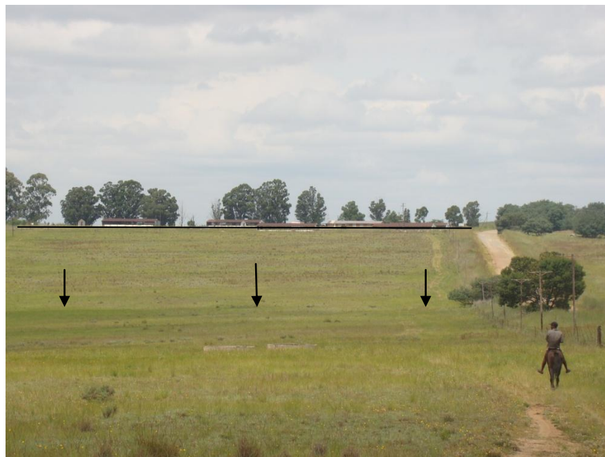
Fig. 10: General view from west to east. The buildings are outside the study area. The eastern border is indicated by the line. The wetland is indicated by arrows.