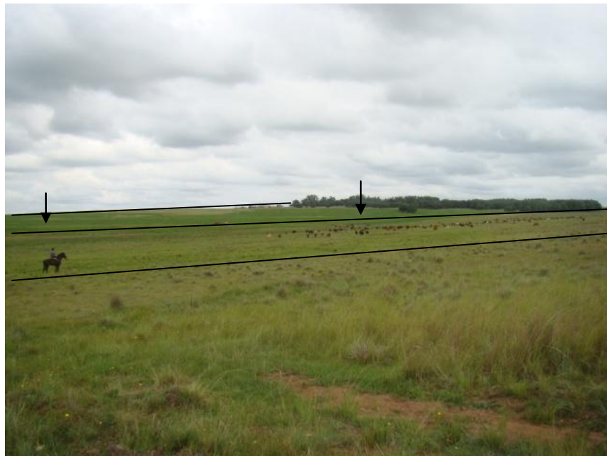
Fig. 6: General view of the farm from north north-west to south. The line at the top indicates the eastern boundary. The cattle, horse and rider are in the wetland (lowest point of the farm). The wattle plantation is visible as well as a current crop cultivated with beans (indicated with arrows).