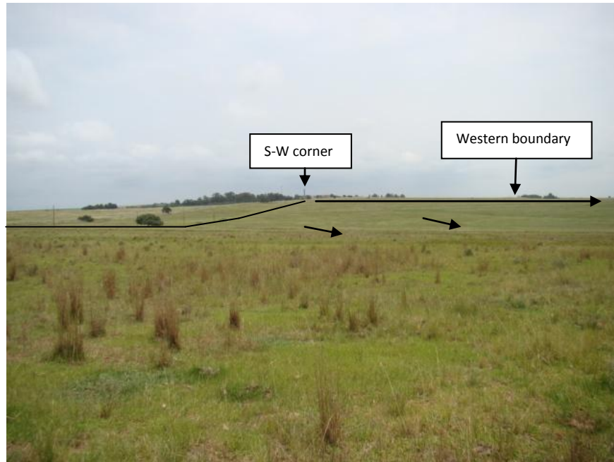
Fig. 3: General view from south to the western corner. Line indicates the southern boundary, south-western corner and western boundary. Fallow lands are visible as well as the Kikuyu grass with clumps of natural grass in between. The wetland is at the lowest section, indicated by arrows.