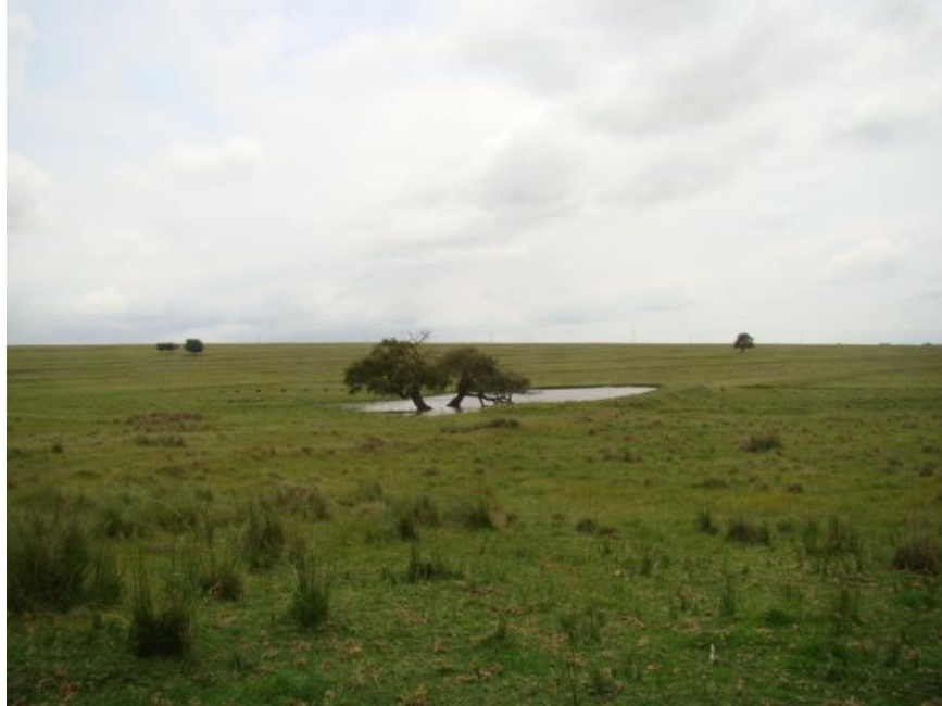
Fig. 5: The drainage line and wetland is visible with one of the catchment dams in the centre of the study area. This area of approximately 70ha (south to north), will be kept as a Public Open Space. See Appendix 1.