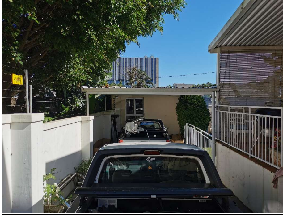
PHOTO 14 – VIEW FROM NORTH EAST OF THE EXISTING OUTBUILDING AND CARPORT