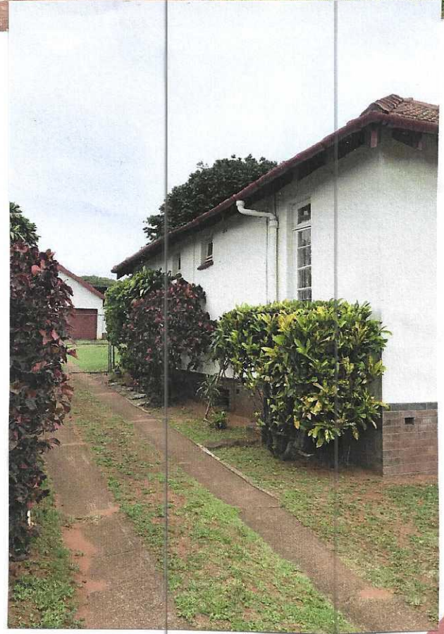
South Elevation ↑ & existing driveway