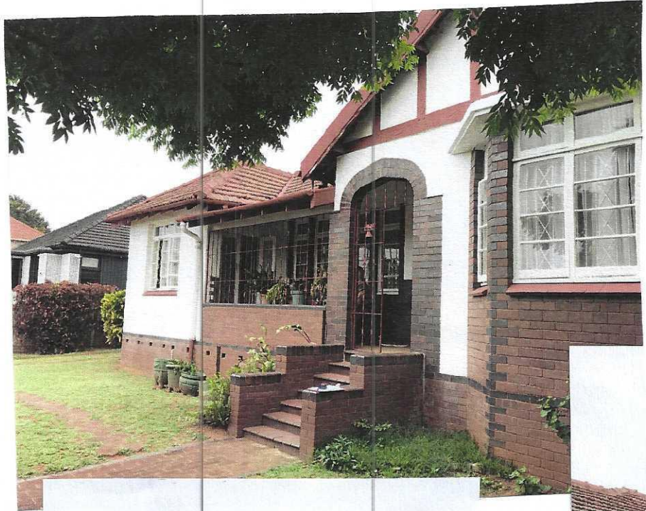
← Front view - East Elevation ↓