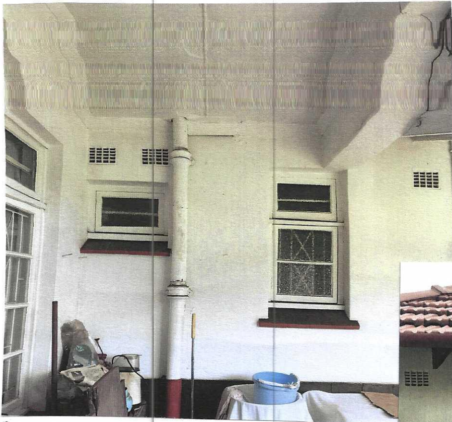
↑ WC & Bathroom windows - West Elevation