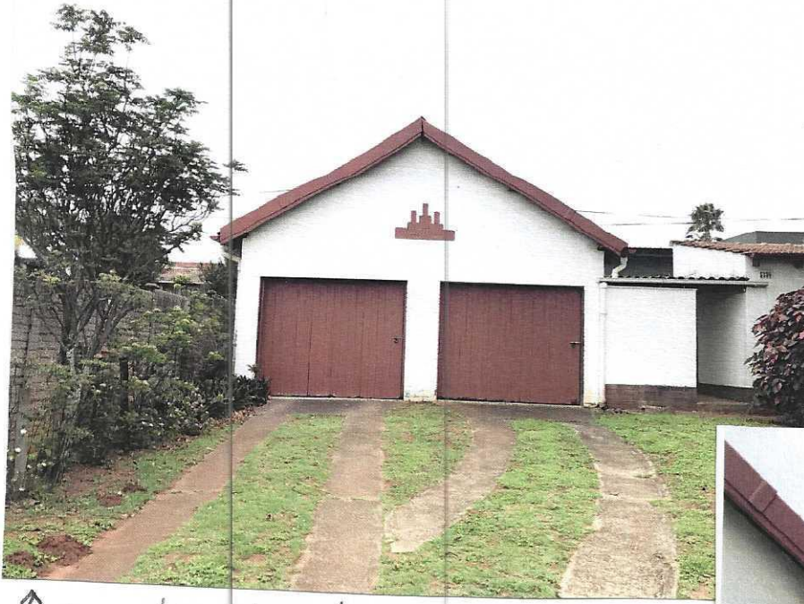
↑ East Elevation - Garage & outbuilding →