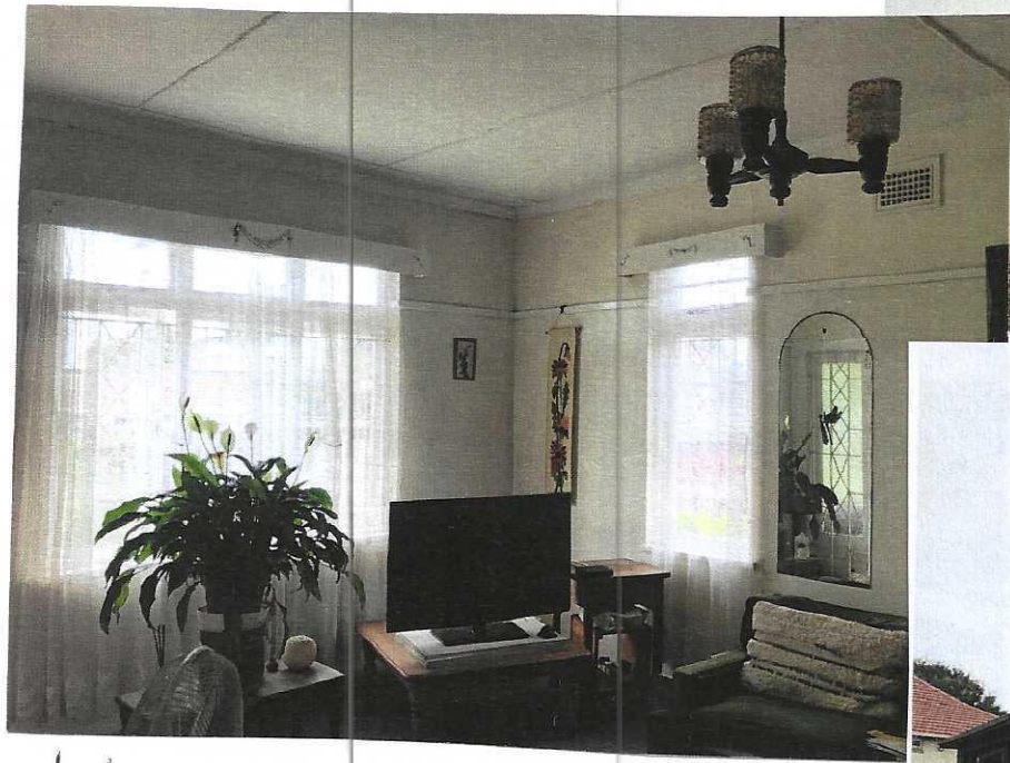
Interior of lounge extension ↑