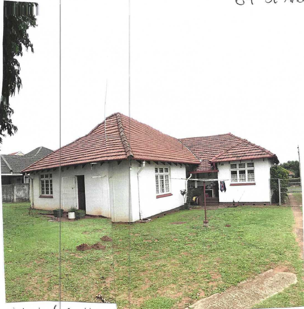
West / South Elevation - main dwelling