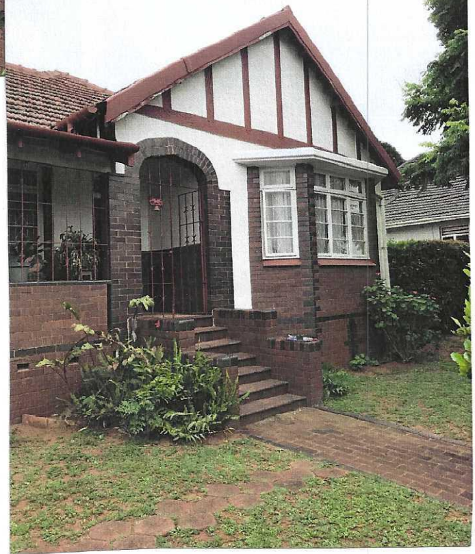
East Elevation ↓