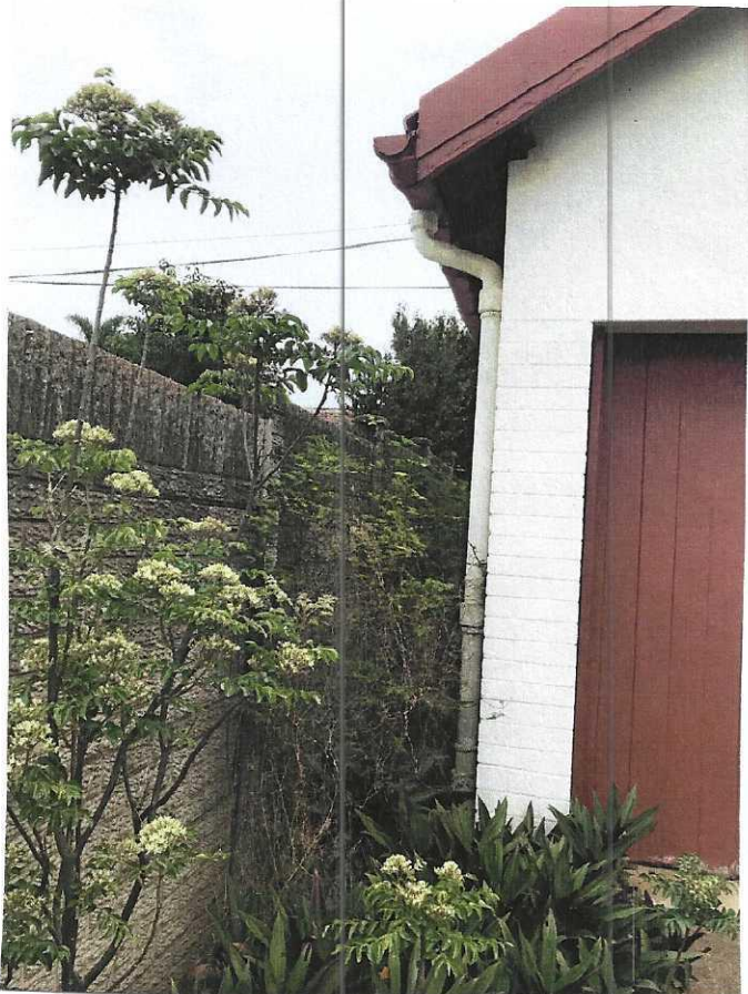
← Garage very close to boundary - therefore not possible to take photo of South Elevation.