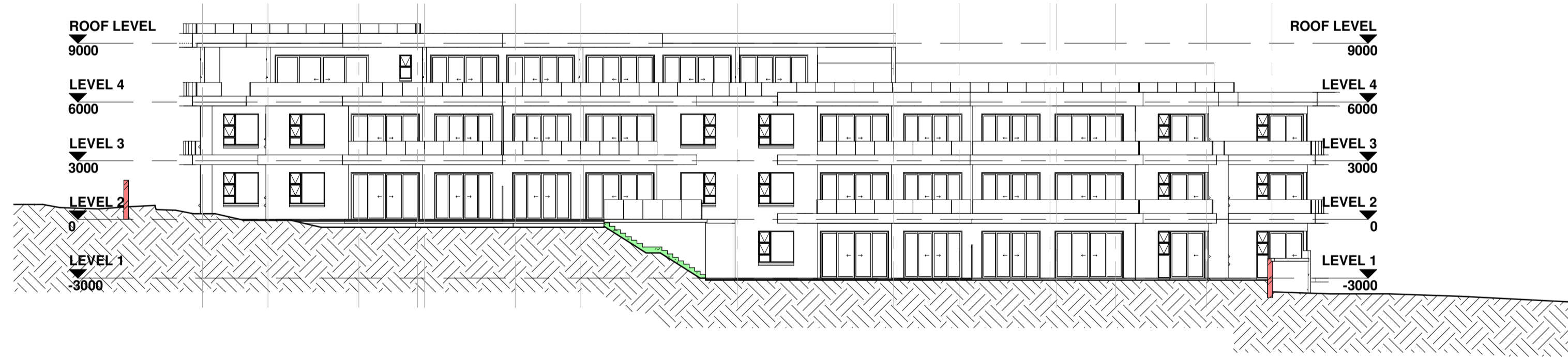
SOUTH ELEVATION - LA scale: 1 : 200