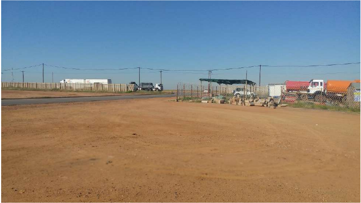
Figure 7: Construction camp in surveyed area