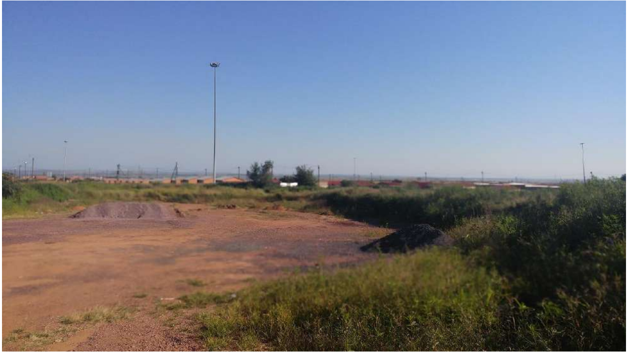
Figure 6: General view of vegetation and borrow pit on site.