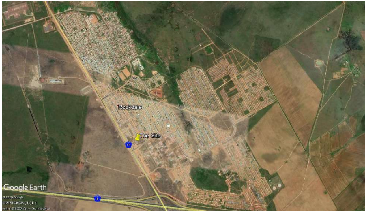
Figure 2: Location of the site within Rockdale.