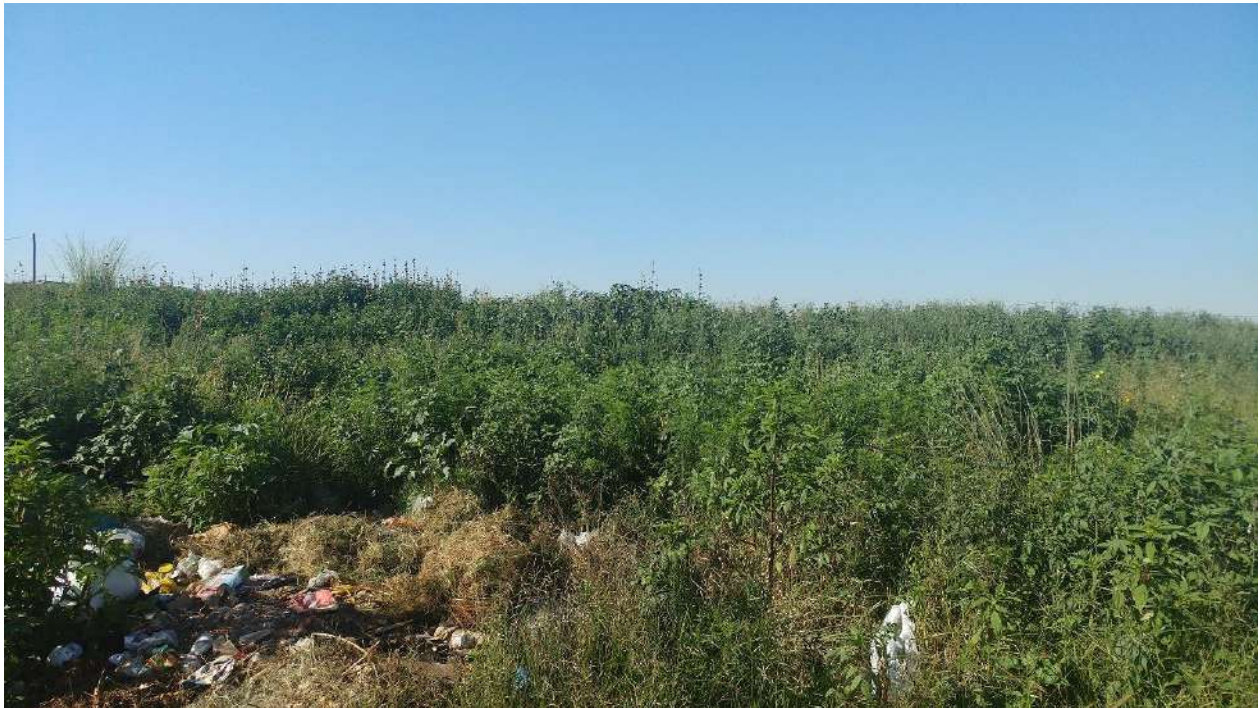
Figure 8: View of illegal dumping and pioneer vegetation in the surveyed area.