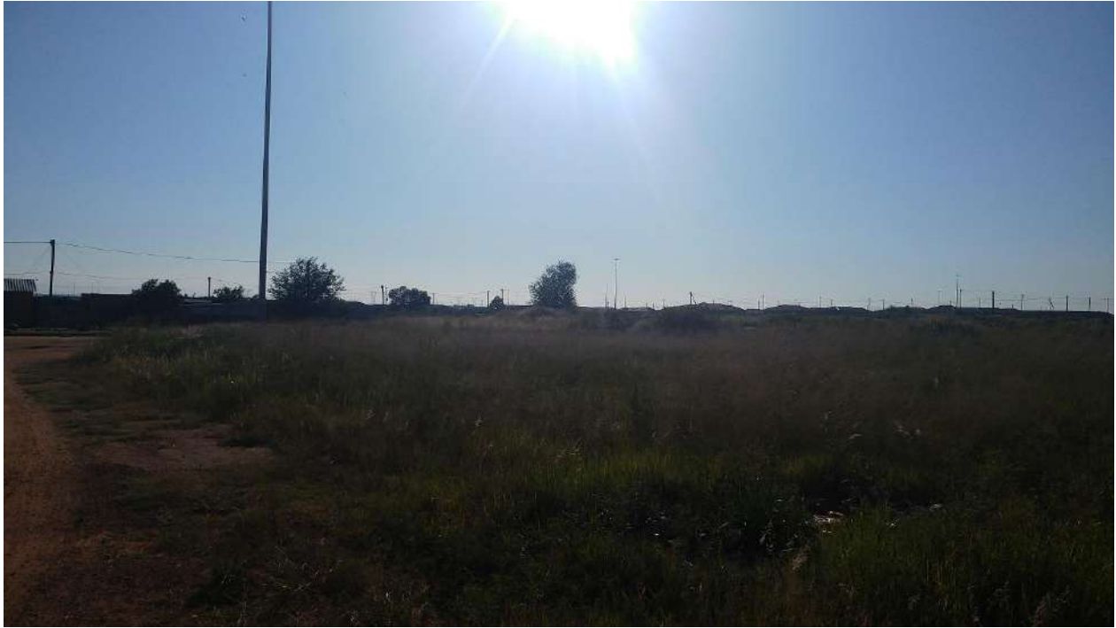
Figure 5: General view of vegetation