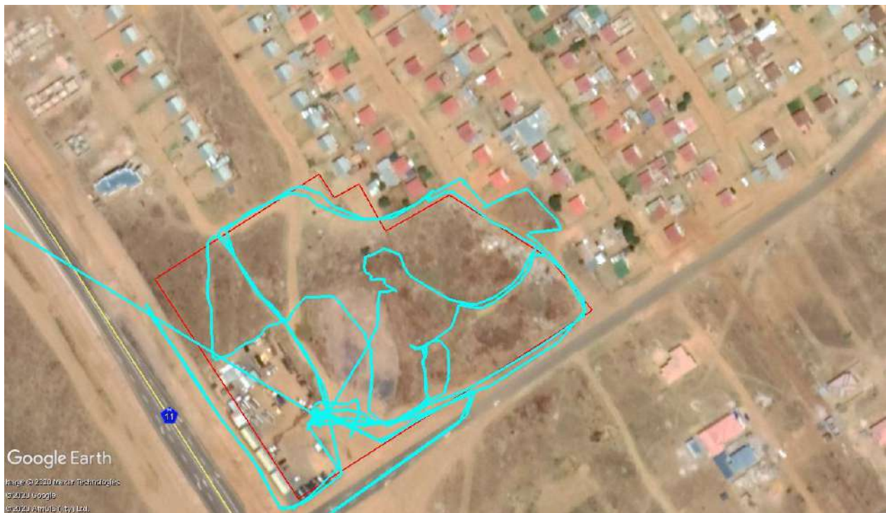
Figure 4: Track route of the survey.

The site was visited on 26 February 2020 and almost the entire area was found to be disturbed (Figure 4-8). The exception is construction camp and pit in the southern corner of the site. The site is populated with tall grass and disturbance is evident in the weeds and other pioneer plant species growing on site. There is illegal dumping on the eastern side.