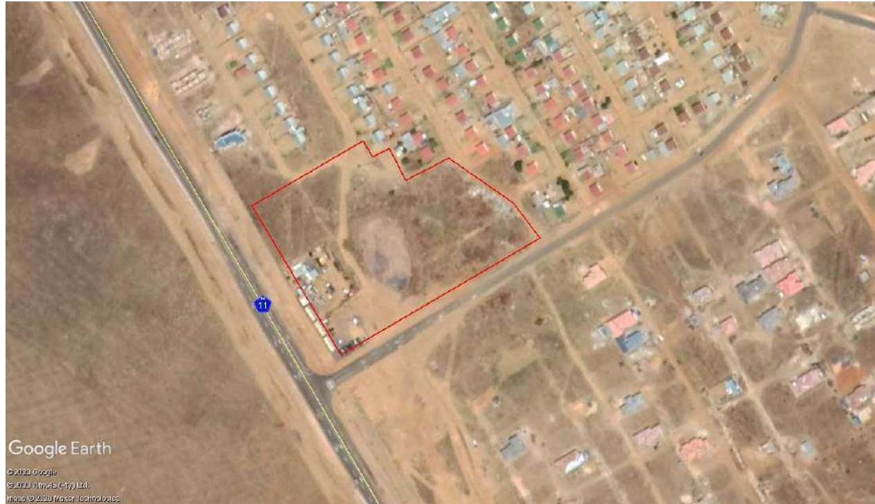
Figure 3: Detailed view of the site.