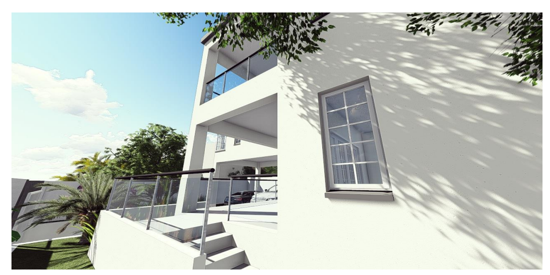
FACING SIDE OF HOUSE WITH STEPS ONTO BACK COVERED VERANDAH