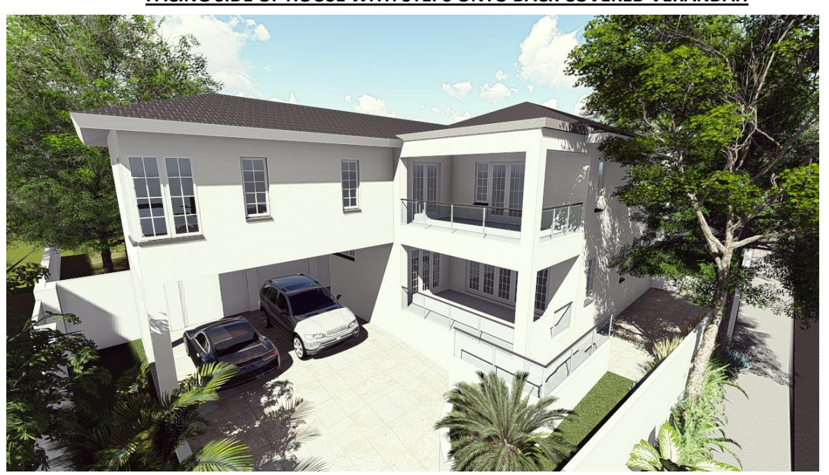
UPSTAIRS AND DOWNSTAIRS VERANDAH'S WITH CARPORT TO THE LEFT NEW BEDROOM ABOVE