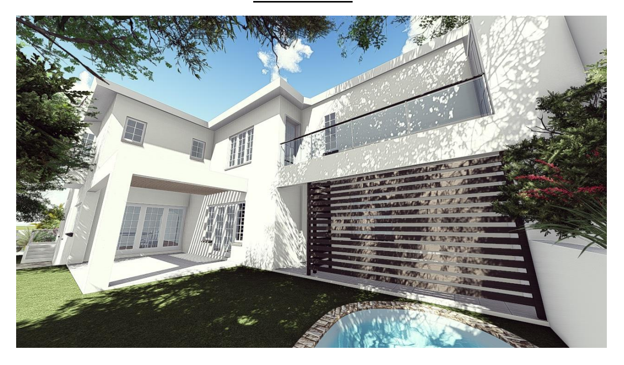
<u>DINING AND STAIRWELL DOORS/PRAYER AREA OPENING ONTO PATIO WITH PERGOLA ENSUITE WINDOWS ABOVE</u>