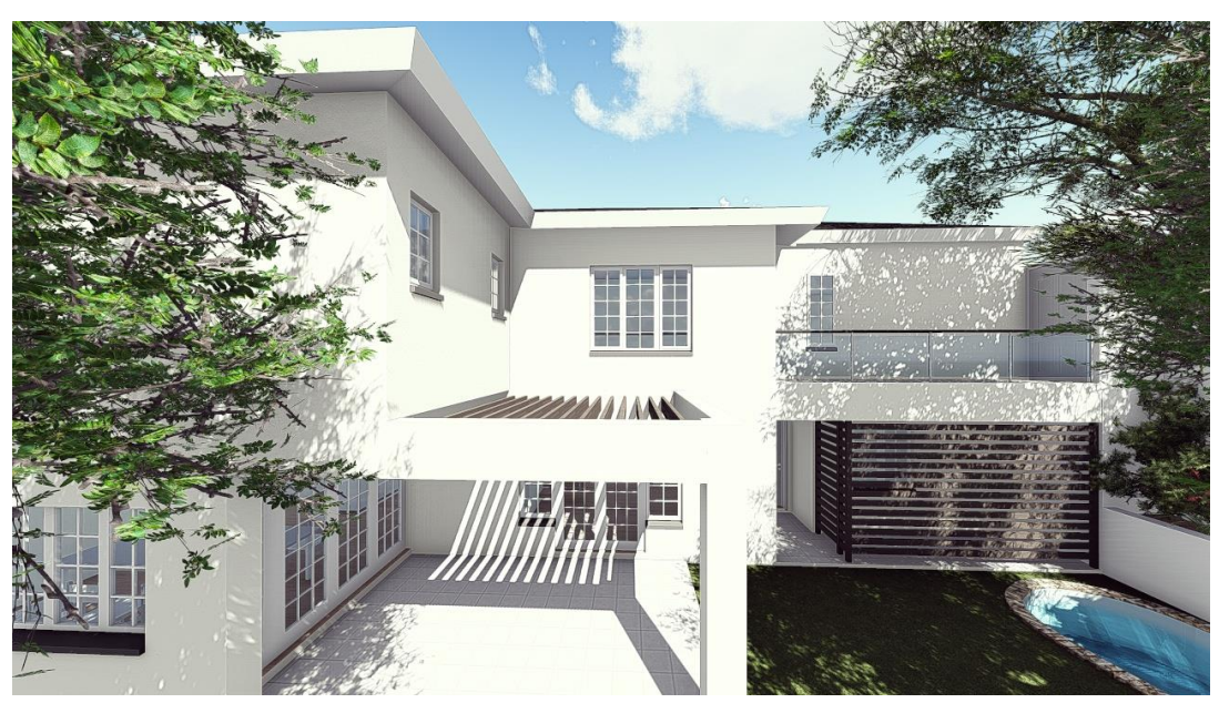
FRONT SUSPENDED WALKWAY WITH CONCEALED CONCEALED BIN AREA BELOW AND NEW PATIO WITH PERGOLA.