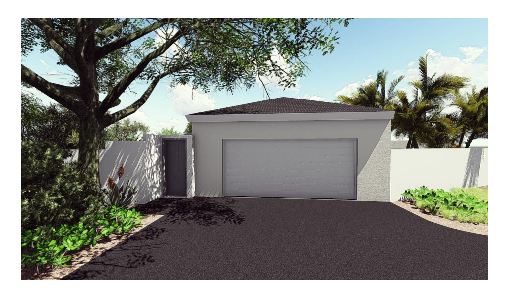
EXISTING GARAGE ENTRANCE WITH NEW PEDESTRIAN ENTRANCE