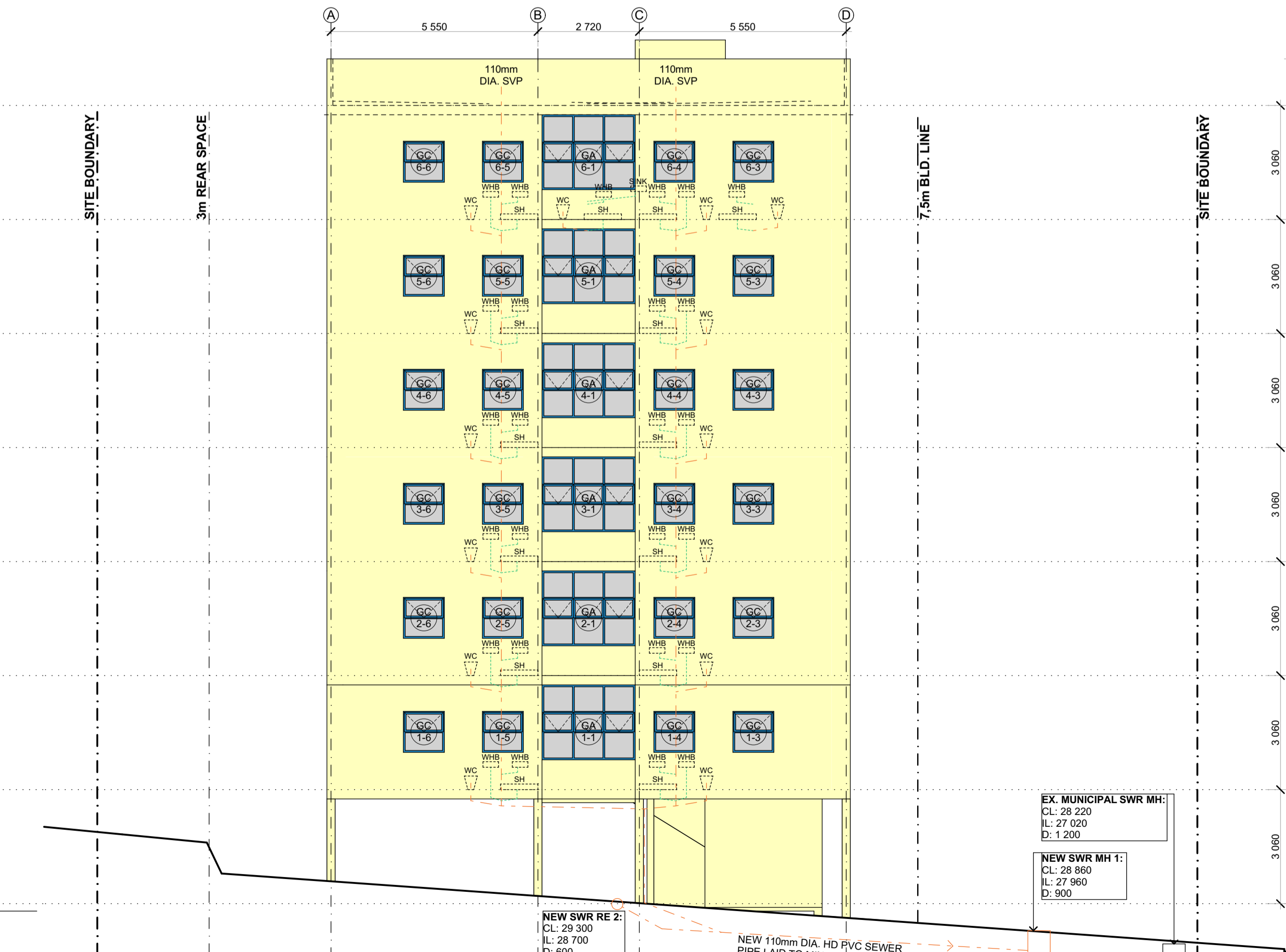
ELEVATION | WEST SCALE 1:100