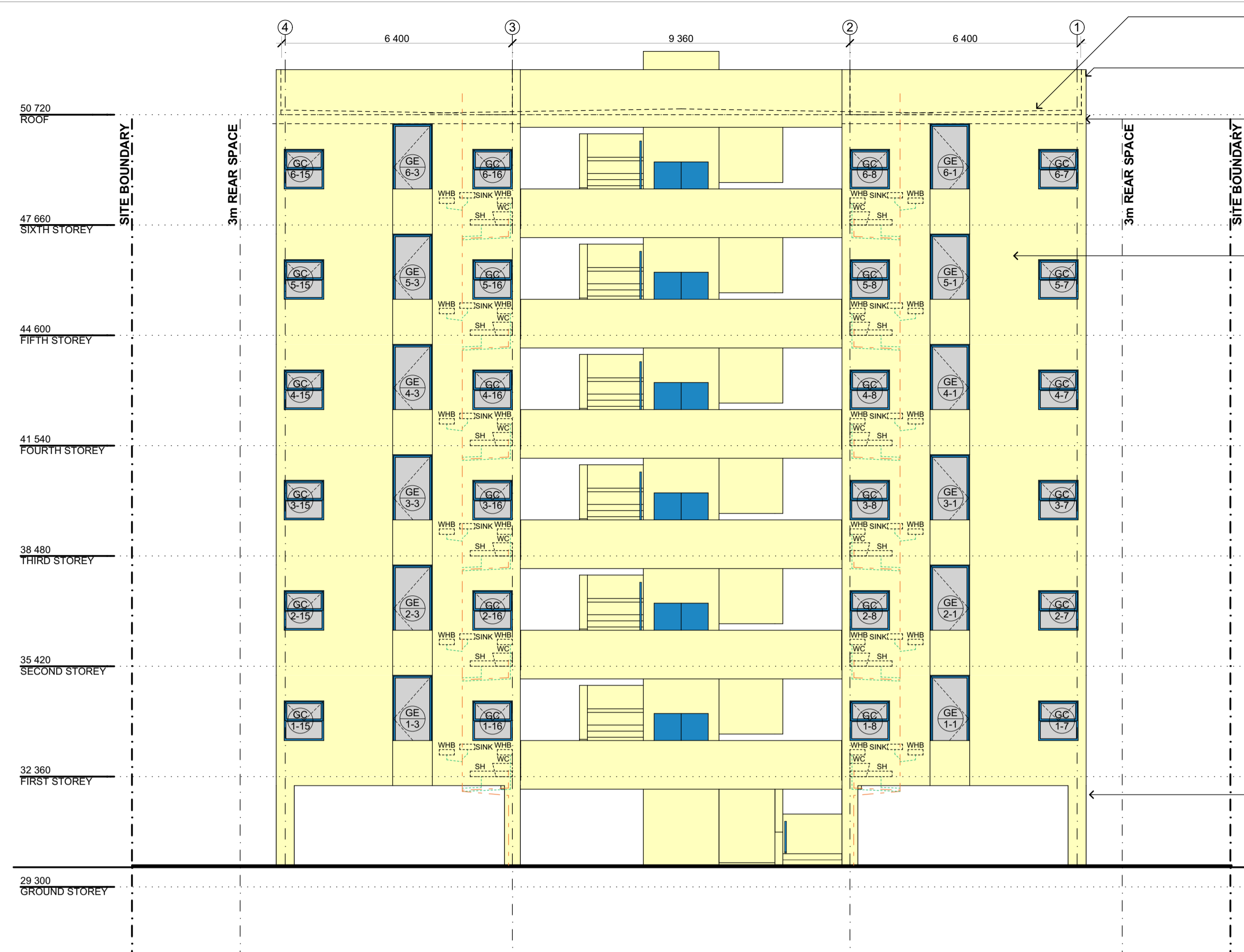
ELEVATION | NORTH SCALE 1:100