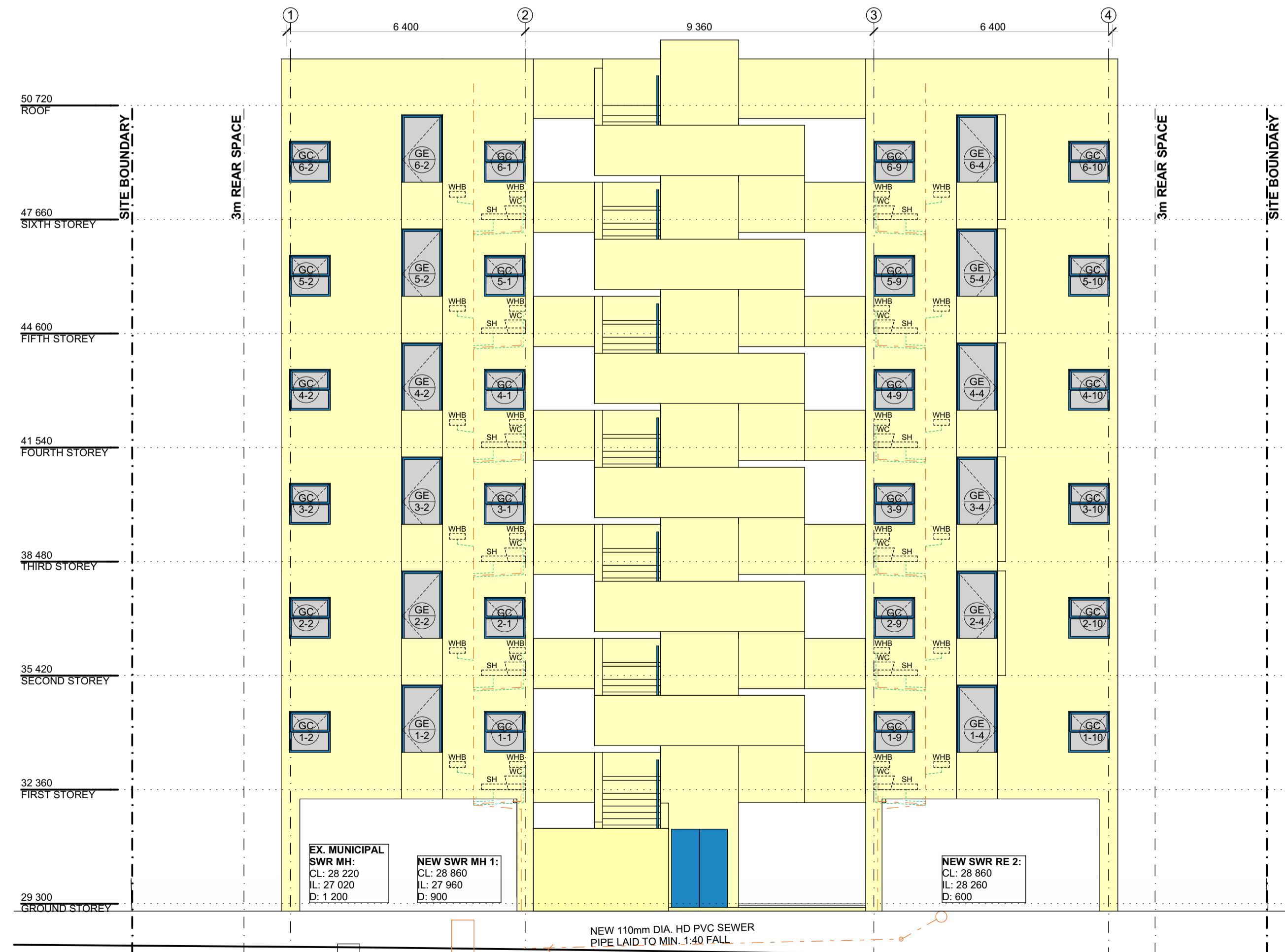
ELEVATION | SOUTH SCALE 1:100