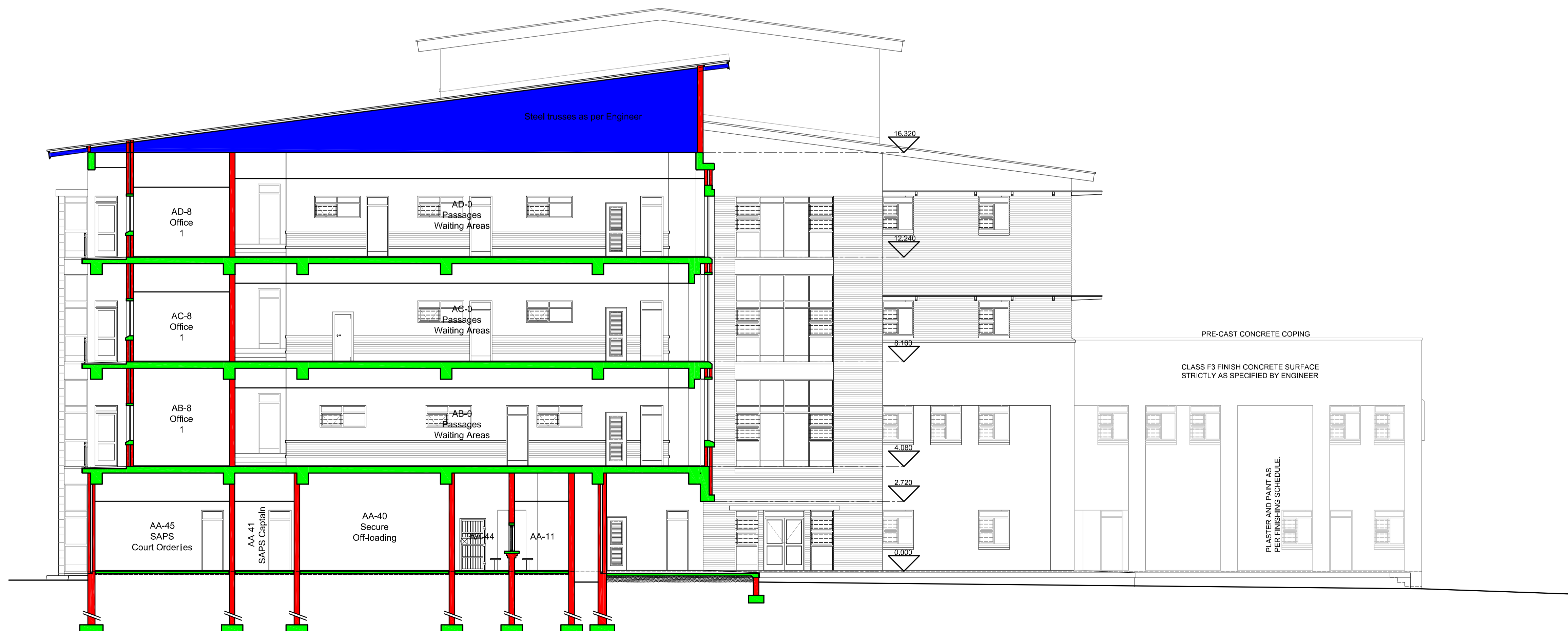
1:100 SECTION G-G

ALL DIMENSIONS ARE TO BE CHECKED ON SITE PRIOR TO CONSTRUCTION TAKING PLACE. ANY DISCREPANCY BETWEEN ARCHITECT'S DRAWINGS, ENGINEERS DRAWINGS AND THE BILLS OF QUANTITIES ARE TO BE CLARIFIED WITH THE ARCHITECT. ALL PRODUCT SPECIFICATION CODES ARE TO BE CHECKED WITH THE SUPPLIER PRIOR TO THE ORDERING AND BUILDING IN OF MATERIAL. ALL STRUCTURE TO BE CHECKED BY THE ENGINEER.