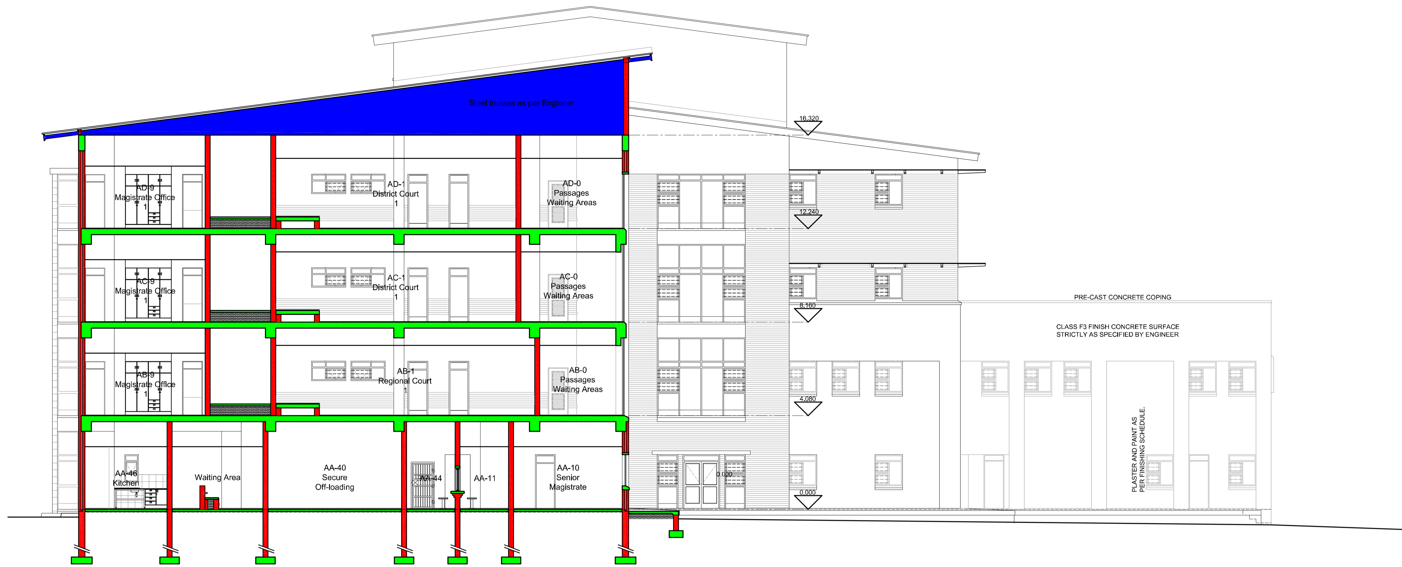
1:100 SECTION F-F