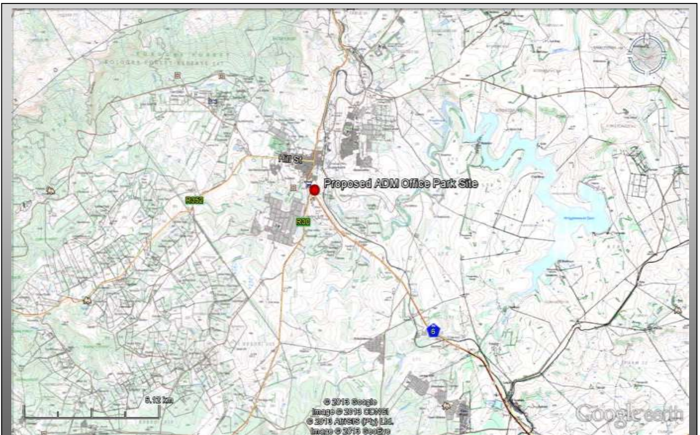
Figure 1. Google image of the site proposed for development of Office Park in Stutterheim. The yellow outline represents the affected area.