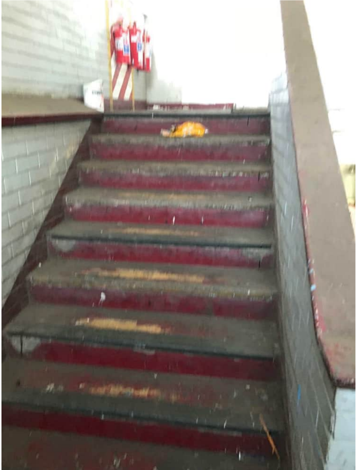
Figure 20.) Image illustrates first floor internals. The proposed includes demolition of all first-floor items.