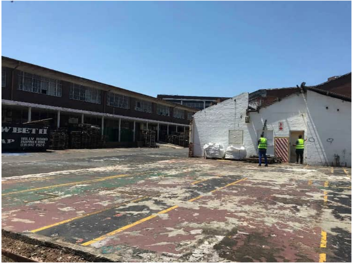
Figure 38.) View illustrating the area in which the side view of the garage/workshop