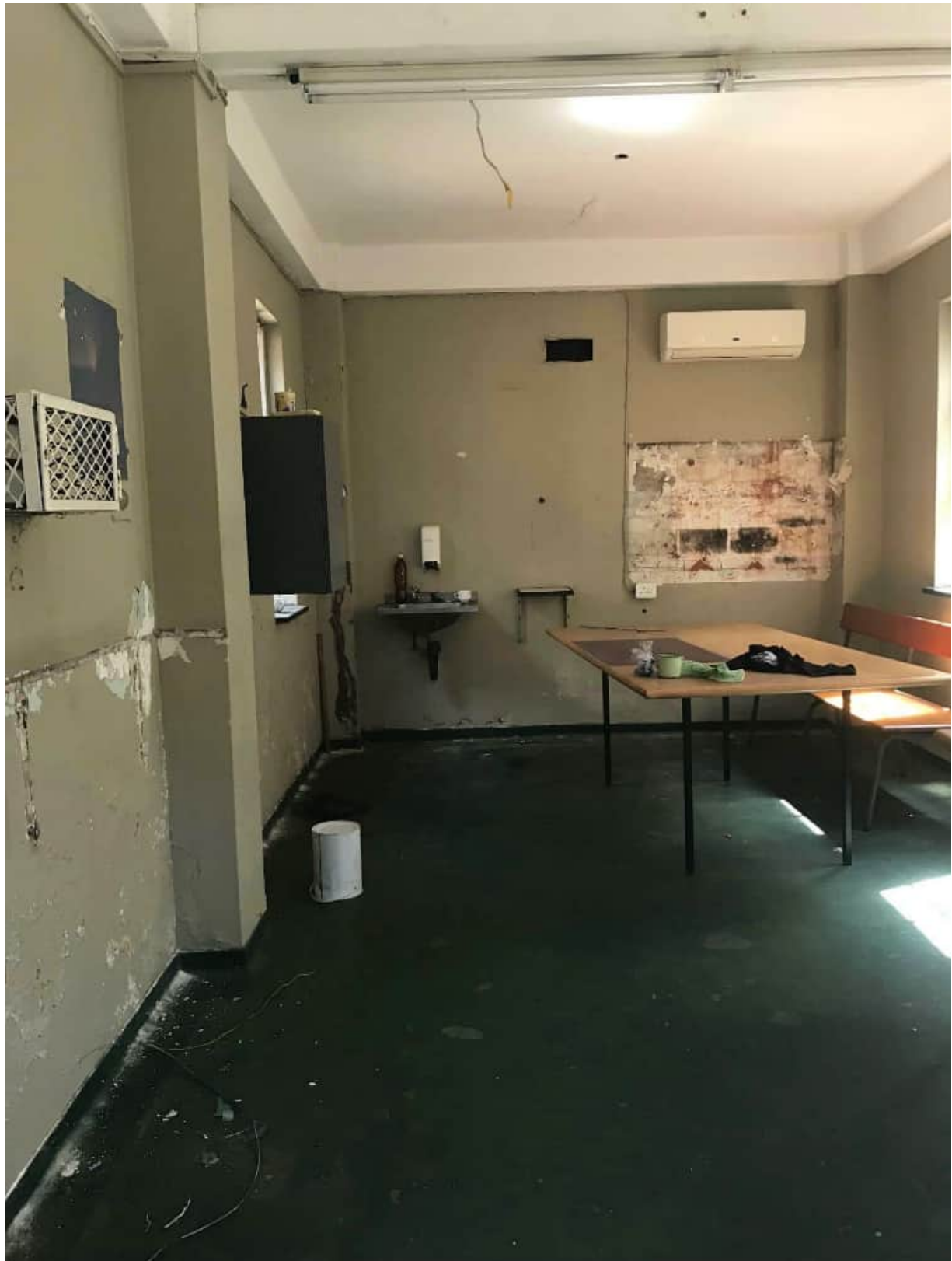
Figure 32.) Internal view of staff quarters.