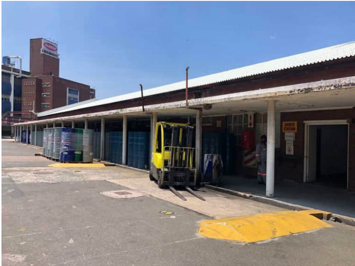
Figure 37.) View illustrating North western façade of office building & storage unit. Refer to plans for list of proposed works.