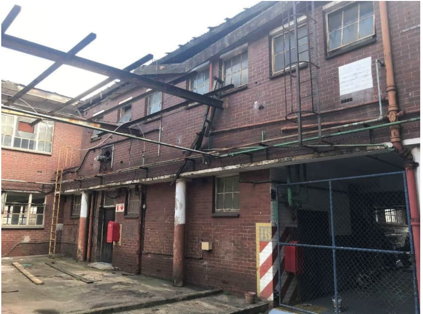
Figure 5.) Image illustrates Eastern façade view of the existing Laboratory building in which the demolition of the First floor is proposed.