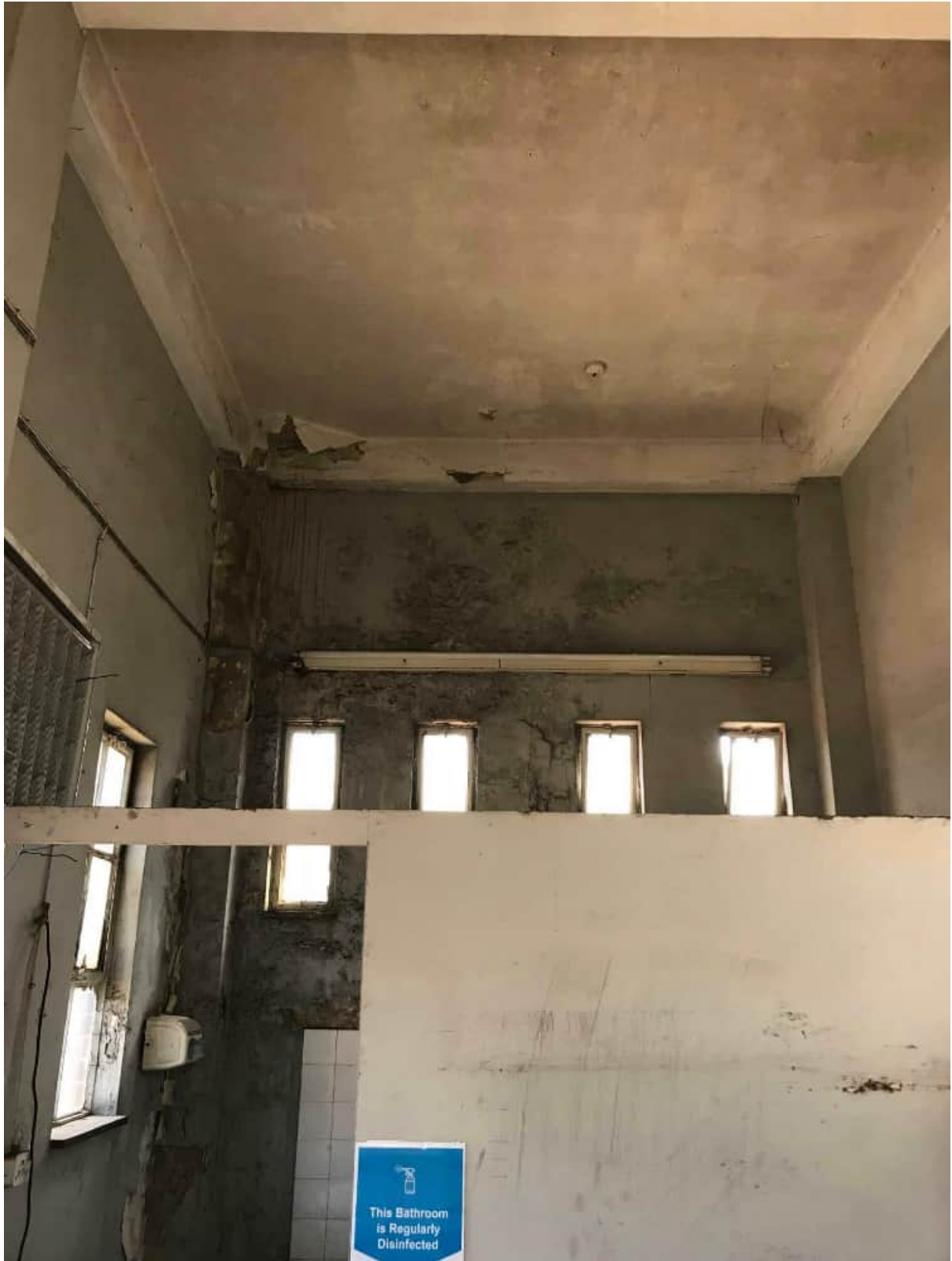
Figure 33.) Internal view of staff quarters ablutions.