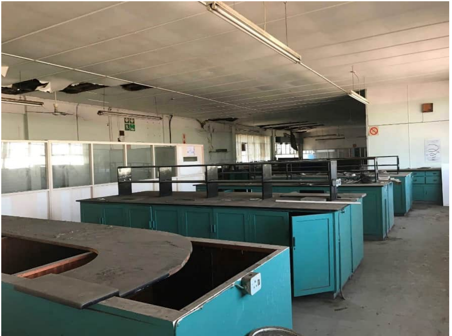
Figure 14.) Image illustrates first floor internals. The proposed includes demolition of all first-floor items.