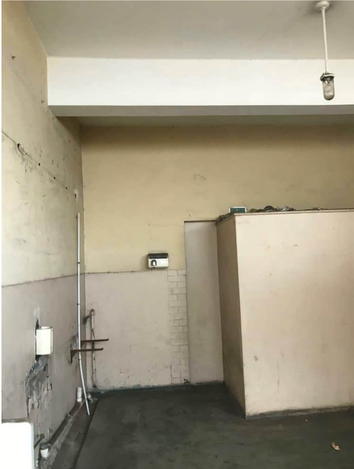
Figure 26.) Image illustrates Ground floor internals (ablutions). Refer to plans for items that are removed, refurbished or demolition.