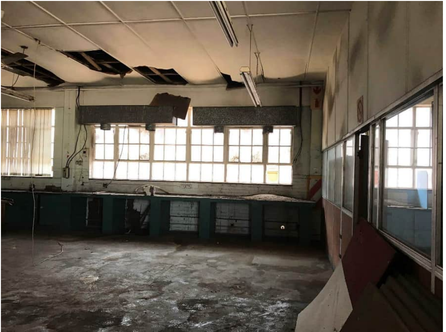
Figure 18.) Image illustrates first floor internals. The proposed includes demolition of all first-floor items.