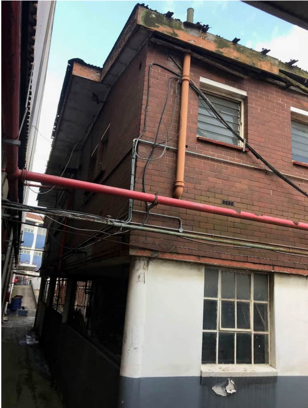
Figure 7.) Image illustrates Northern façade view of the existing Laboratory building in which the demolition of the First floor is proposed.