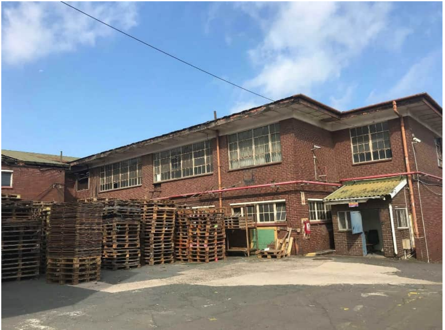
Figure 9.) Image illustrates Western façade view of the existing Laboratory building in which the demolition of the First floor is proposed.