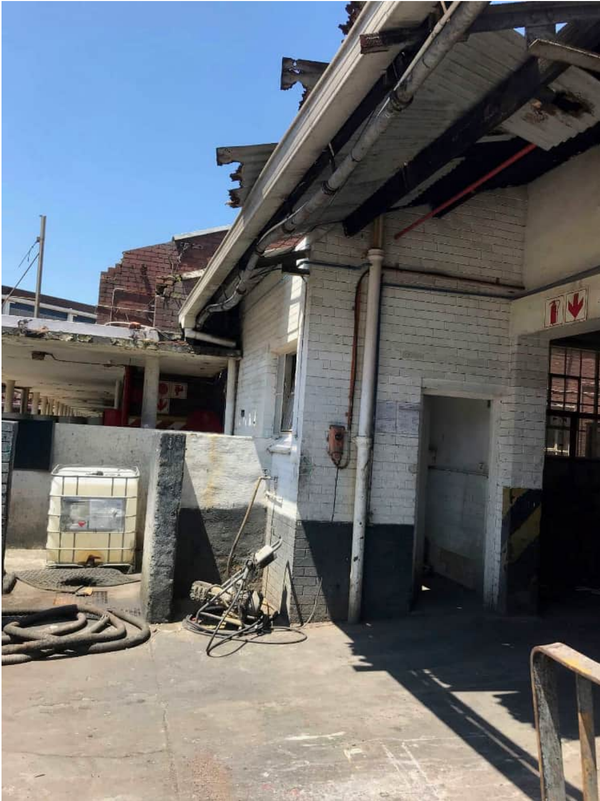
Figure 45.) View illustrating the internals of the garage Store, ablutions and adjacent office building canopy. Refer to plans for list of additions, alterations & proposed demolition.