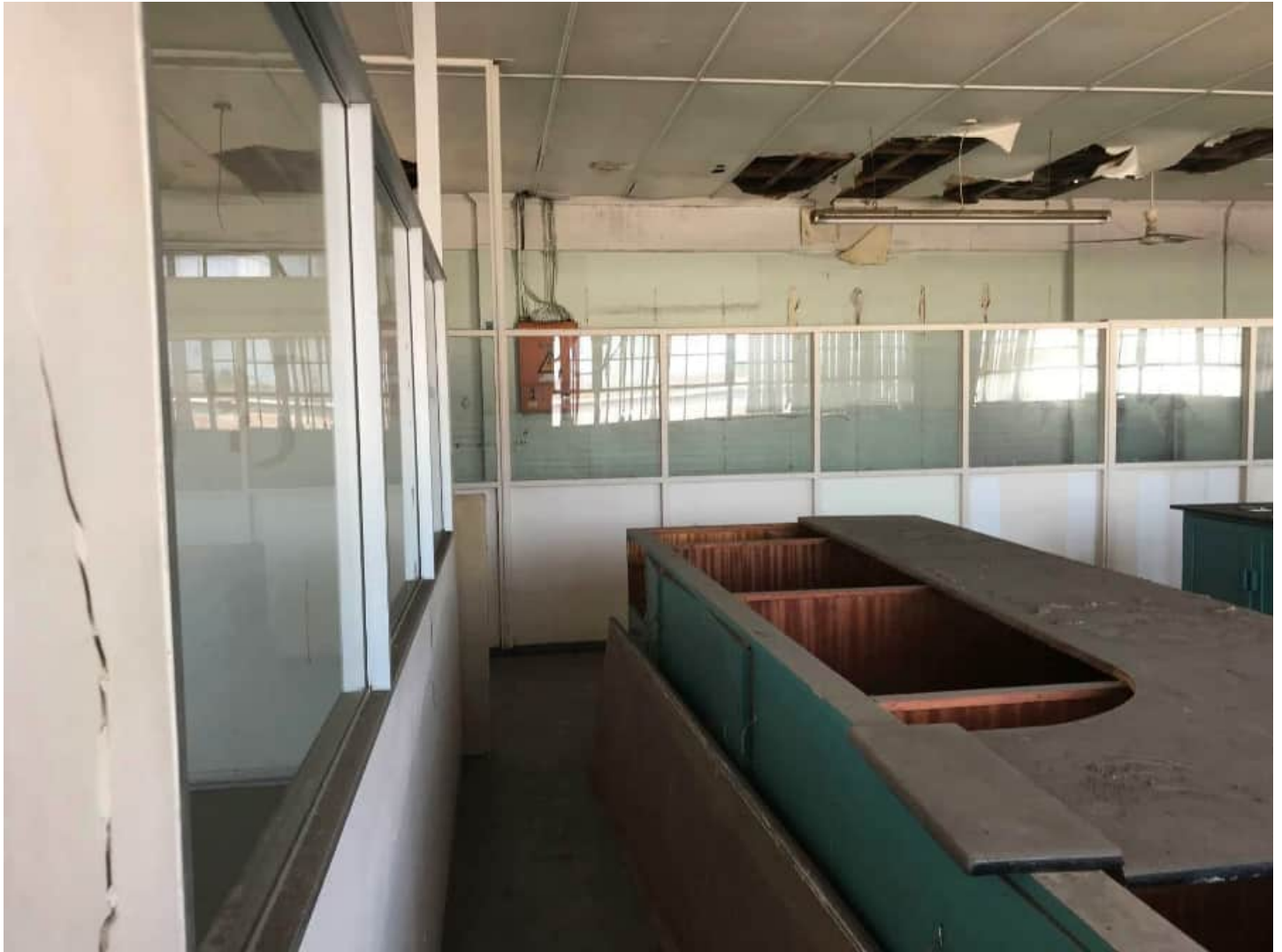
Figure 15.) Image illustrates first floor internals. The proposed includes demolition of all first-floor items.