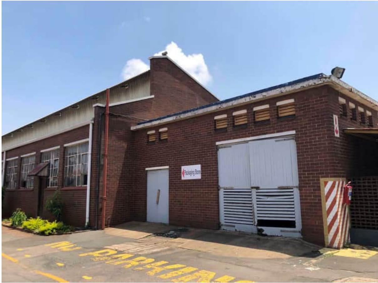
Figure 55.) View illustrating the south eastern façade of the office building and transformer room. Refer to plans for list of additions, alterations & proposed demolition.