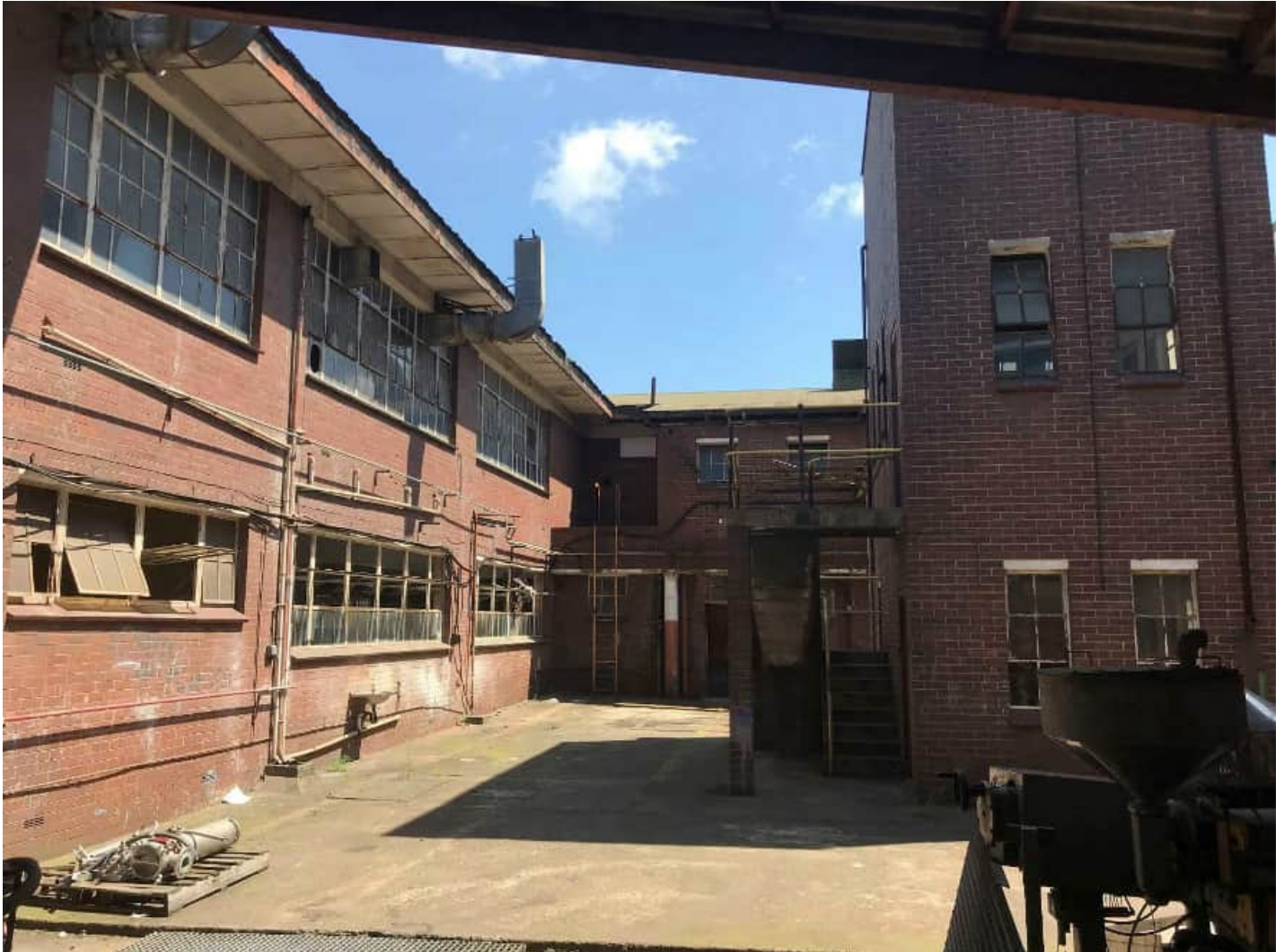
Figure 4.) Image illustrates Eastern façade view of the existing Laboratory building in which the demolition of the First floor is proposed. To the far right of the image, the existing staff quarters can be seen in its context, which is also proposed for demolition.