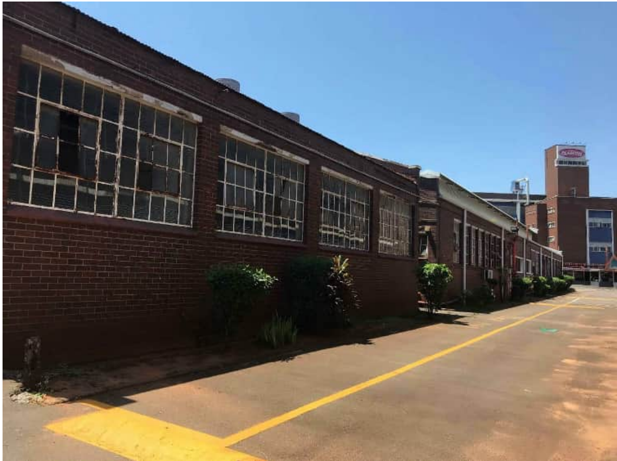
Figure 40.) View illustrating the South Eastern façade of the garage bays that are proposed for demolition as well as the façade of the office building. Clearly indicative of the deteriorative conditions and safety hazard.