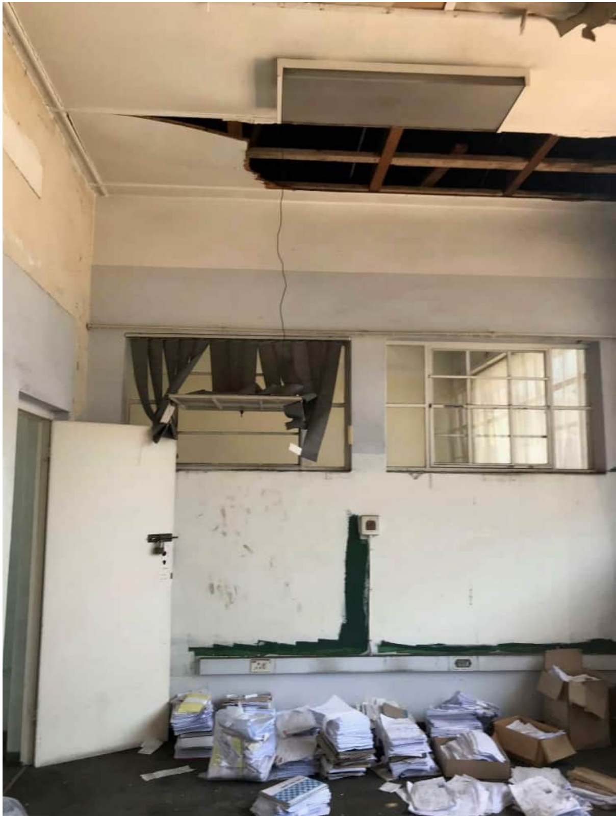
Figure 13.) Image illustrates first floor internals. The proposed includes demolition of all first-floor items.