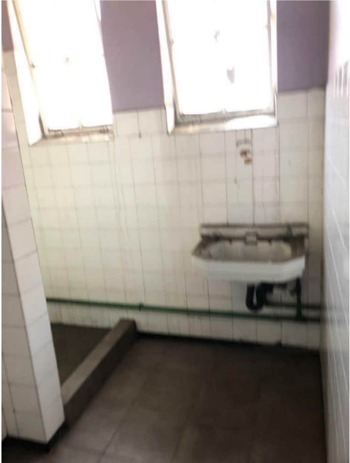
Figure 53.) View illustrating the internals of the office building and store. Refer to plans for list of additions, alterations & proposed demolition.