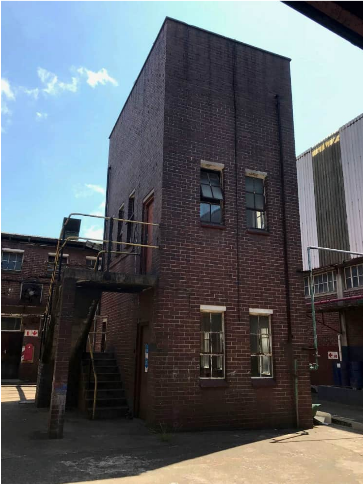
Figure 28.) Eastern view of staff quarters. Building is proposed for demolition given the condition of the structure.