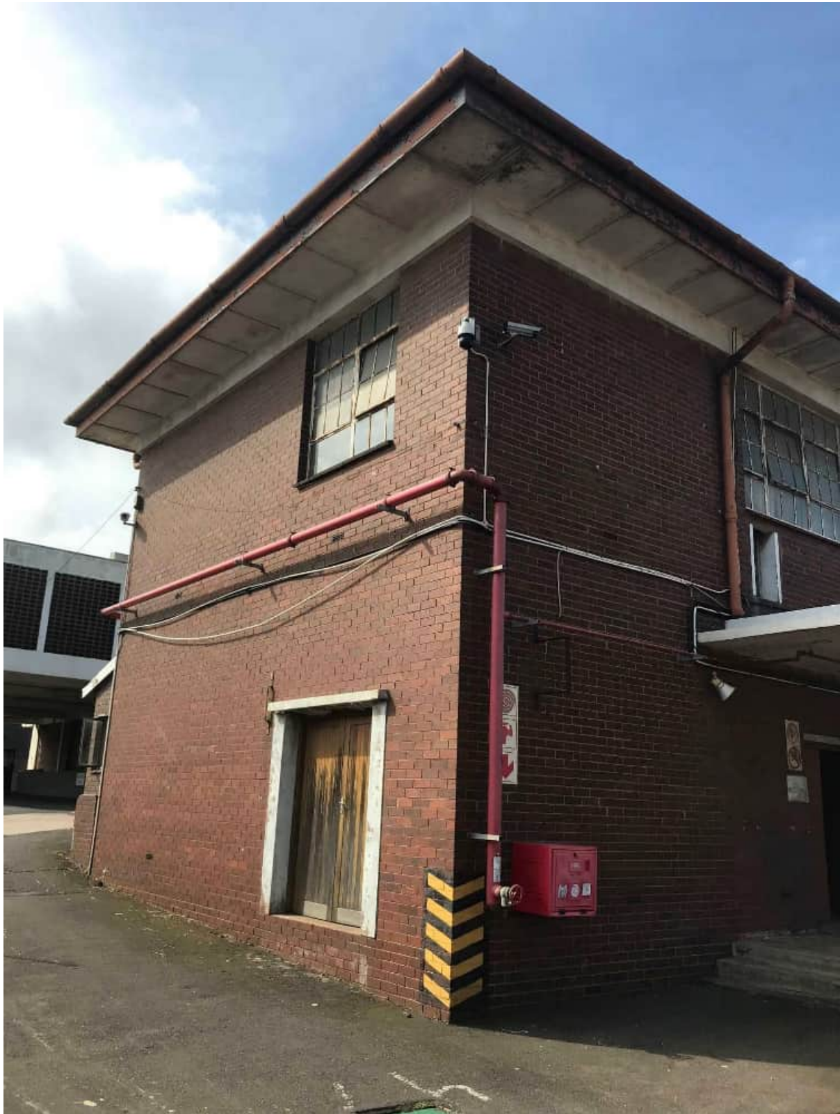
Figure 10.) Image illustrates South Western façade view of the existing Laboratory building in which the demolition of the First floor is proposed.