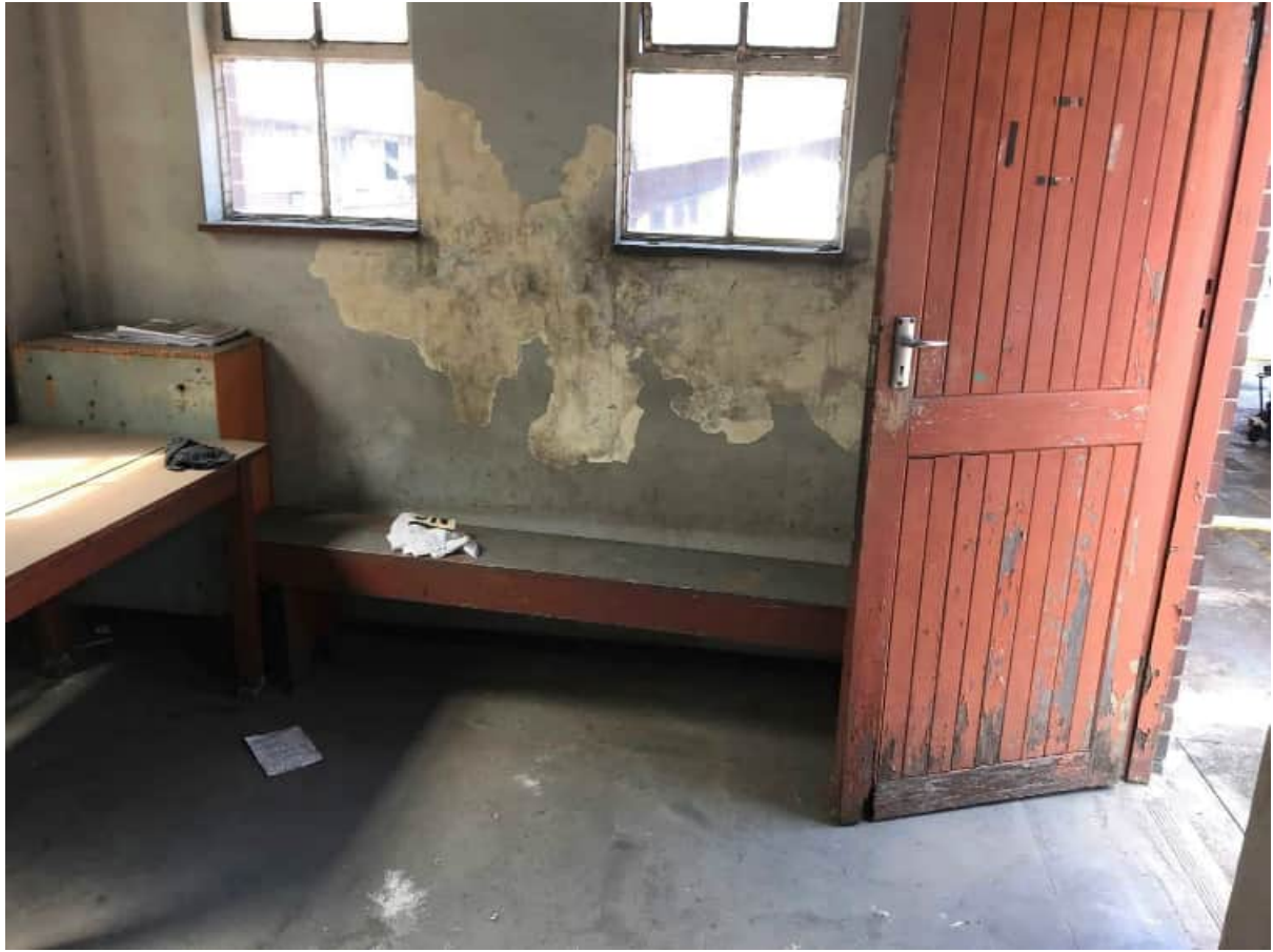
Figure 34.) Internal view of staff quarters first floor.