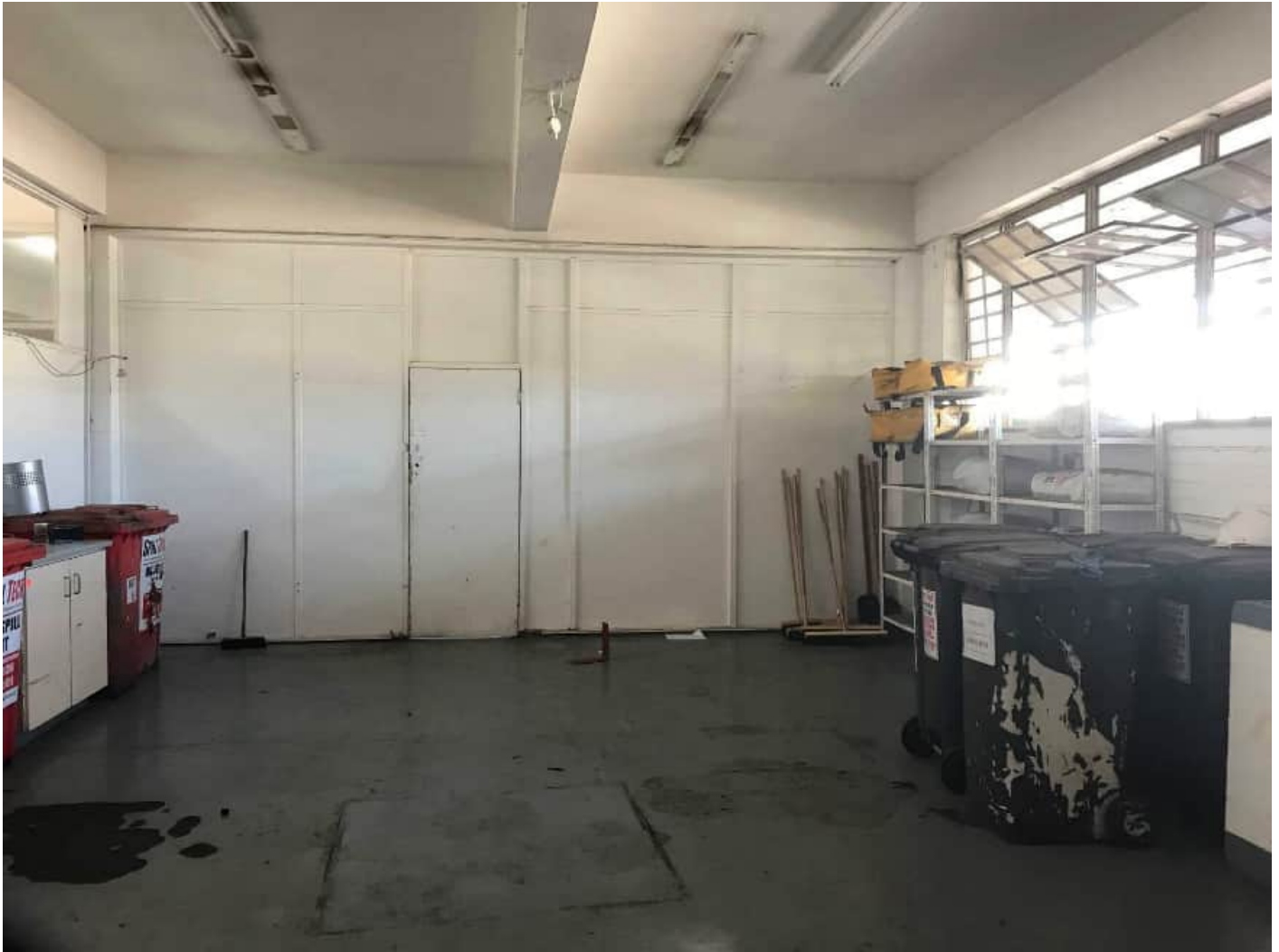
Figure 21.) Image illustrates Ground floor internals (laboratory) .. Refer to plans for items that are removed, refurbished or demolition.