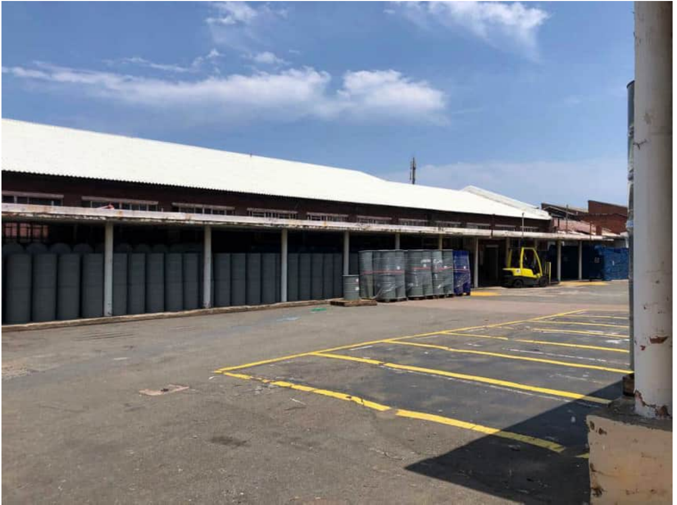
Figure 37.) View illustrating north western façade of office building & storage unit. Refer to plans for list of proposed works.