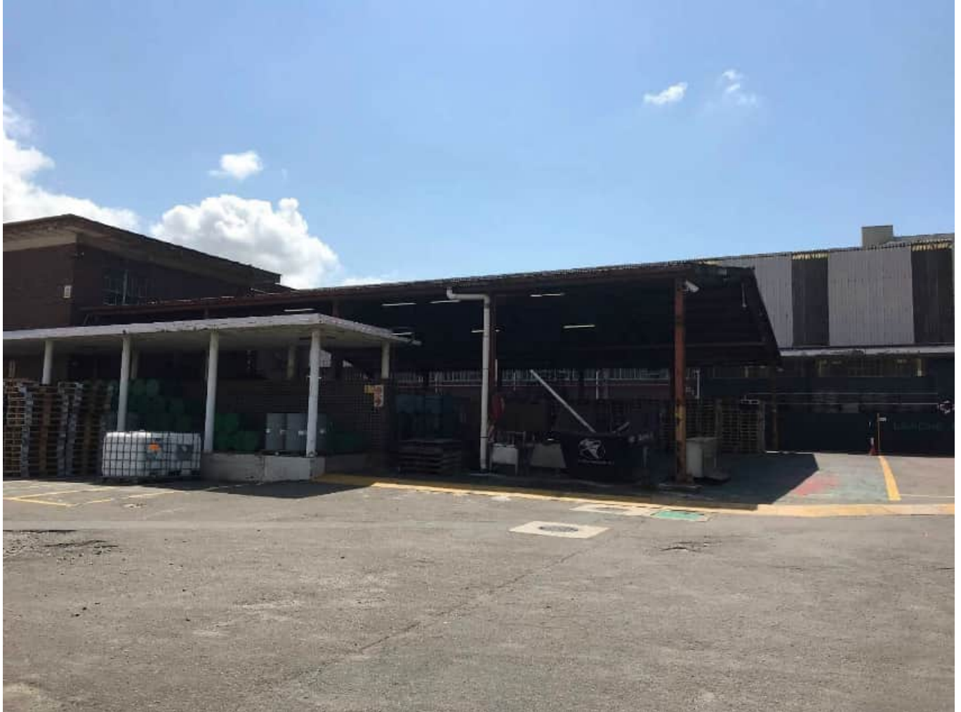
Figure 2.) Image illustrates a South Eastern façade view of the existing Laboratory building in which the part demolition of the canopy is proposed. Image also illustrates existing covered area adjacent to the laboratory, which shall remain in its current state.