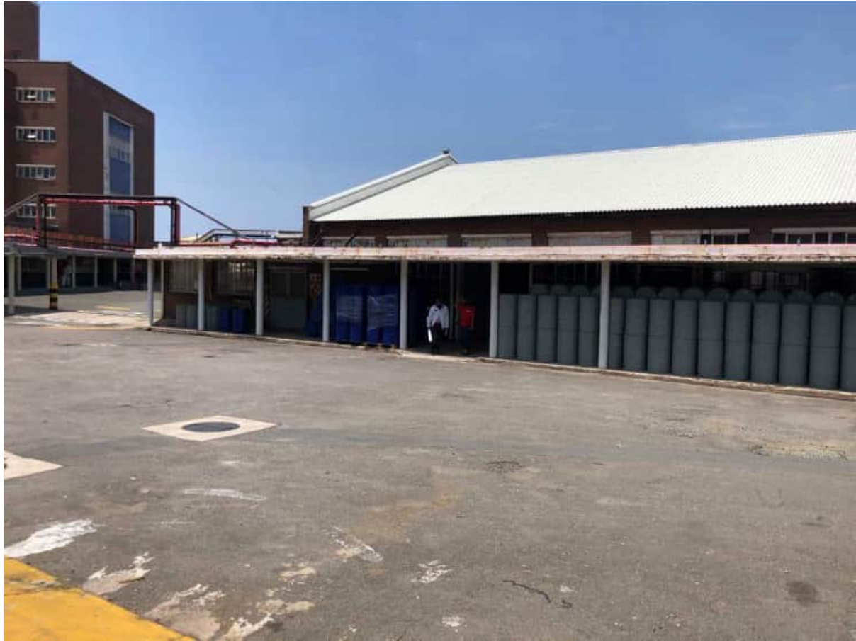
Figure 36.) View illustrating North western façade of office building & storage unit. Refer to plans for list of proposed works.