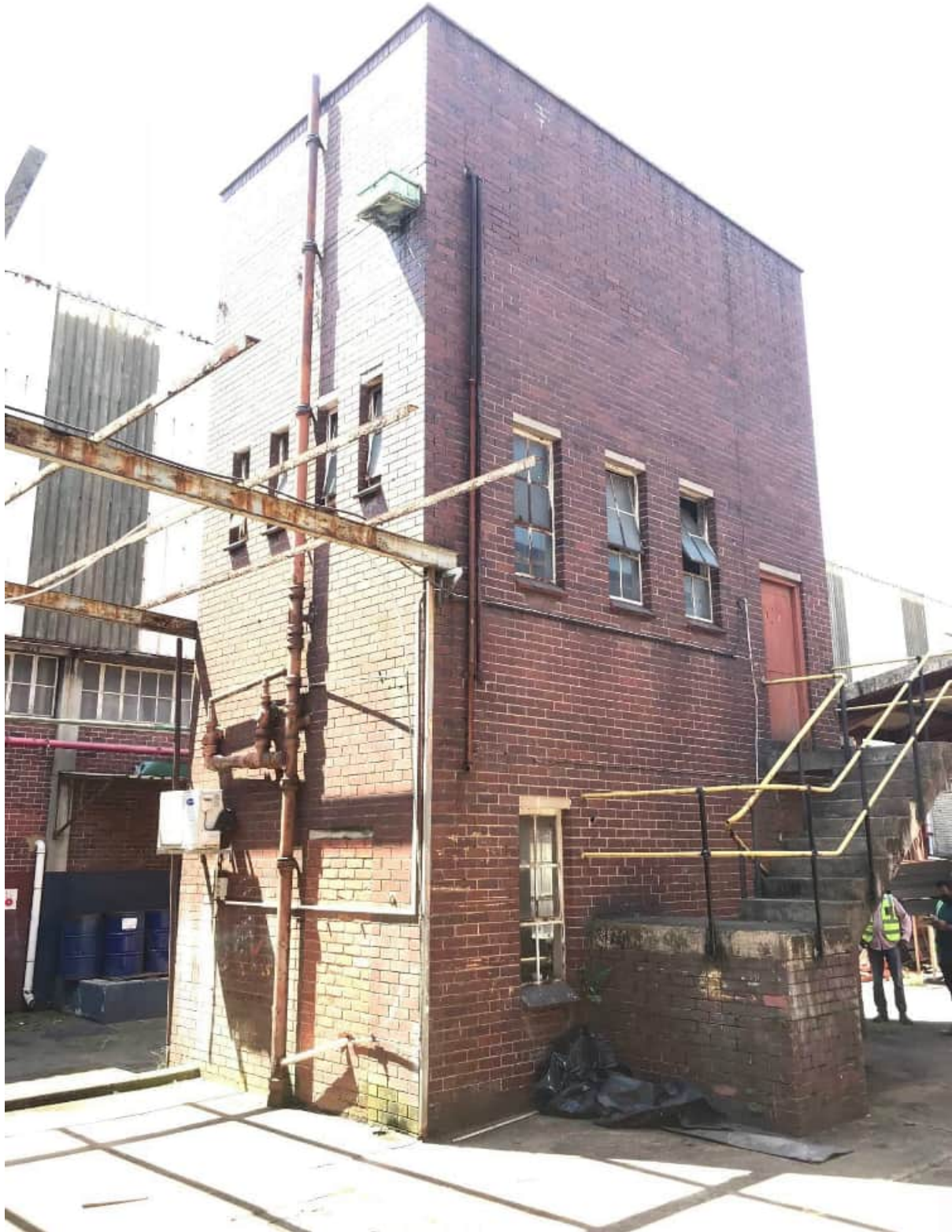
Figure 31.) West view of staff quarters. Building is proposed for demolition given the condition of the structure.