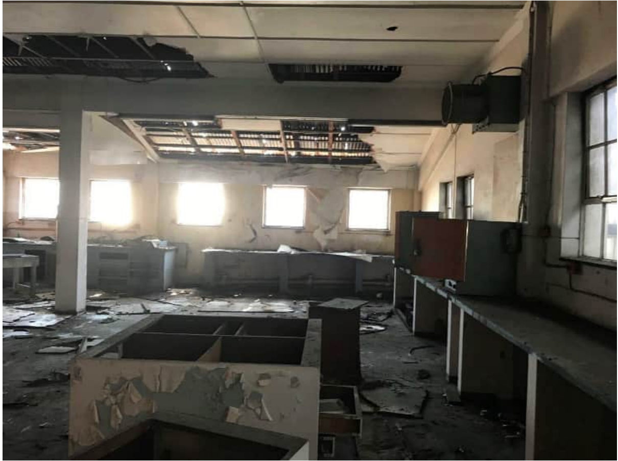
Figure 17.) Image illustrates first floor internals. The proposed includes demolition of all first-floor items.