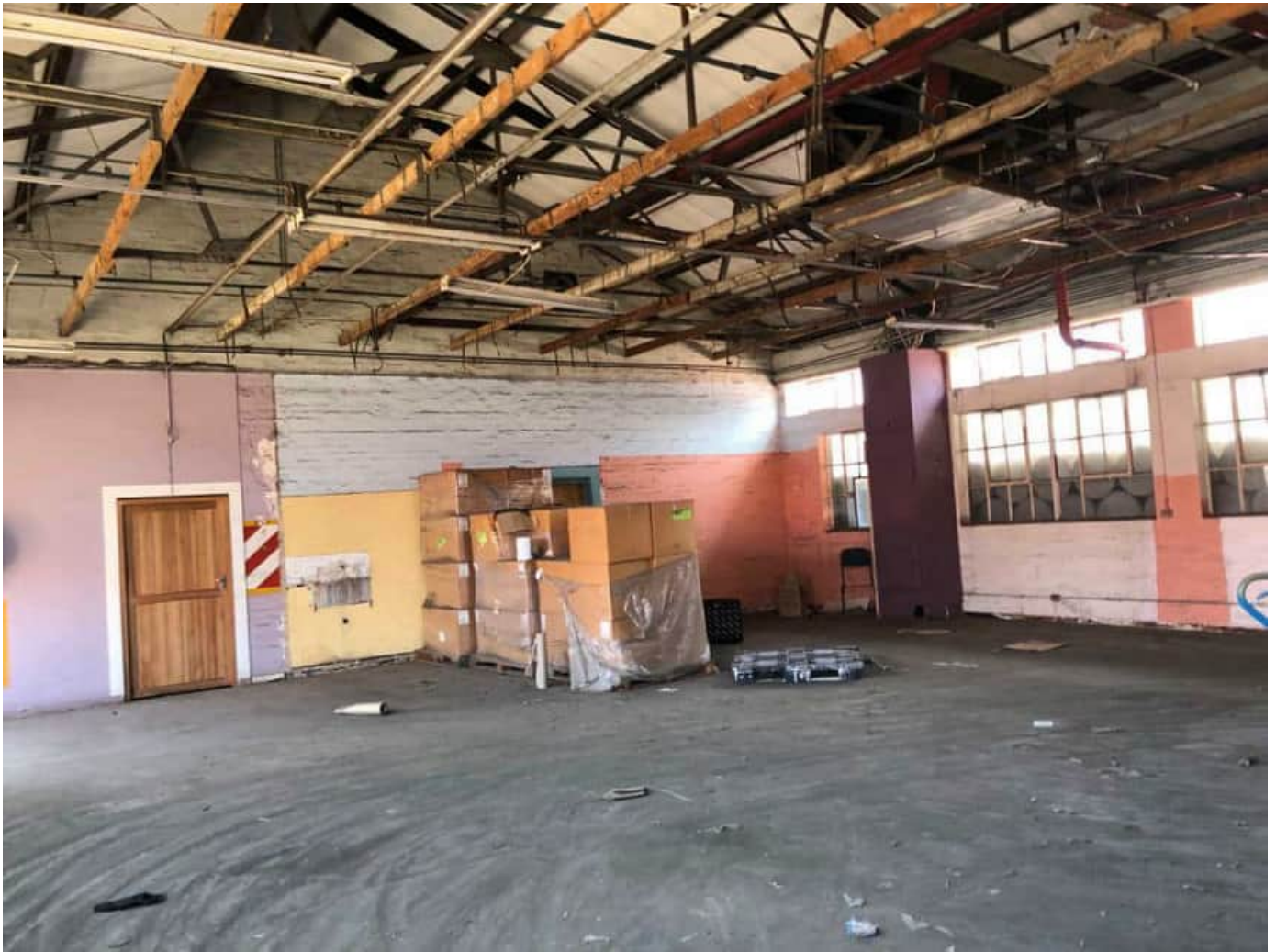
Figure 52.) View illustrating the internals of the office building and store. Refer to plans for list of additions, alterations & proposed demolition.