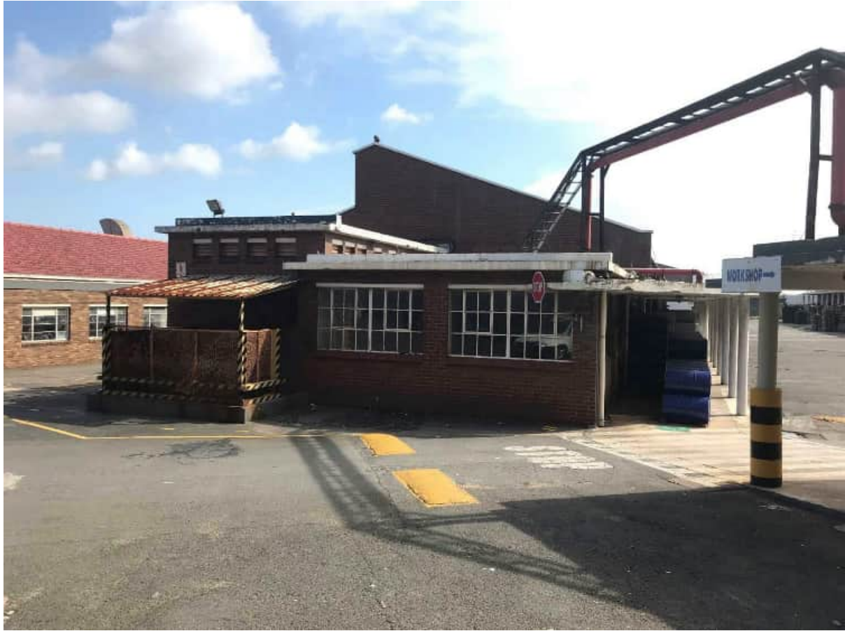
Figure 55.) View illustrating the eastern façade of the office building and transformer room. Refer to plans for list of additions, alterations & proposed demolition.