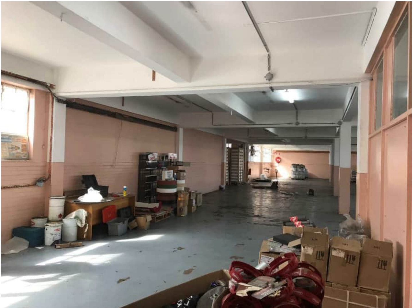
Figure 25.) Image illustrates Ground floor internals(laboratory) . Refer to plans for items that are removed, refurbished or demolition.