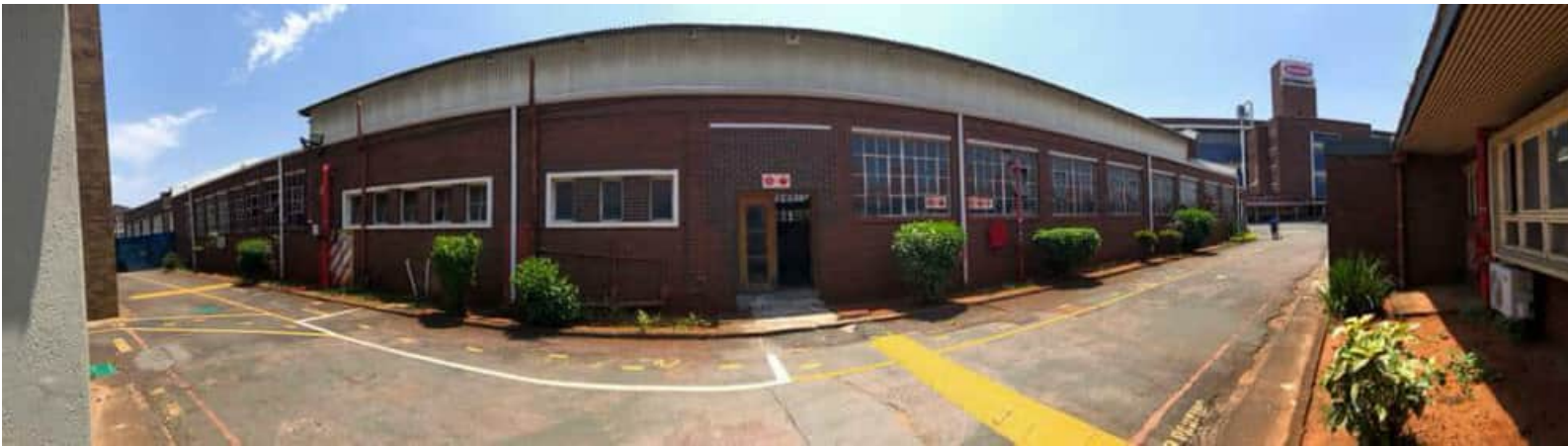
Figure 49.) View illustrating the wide-angle view of the garage Store, and office building. Refer to plans for list of additions, alterations & proposed demolition.