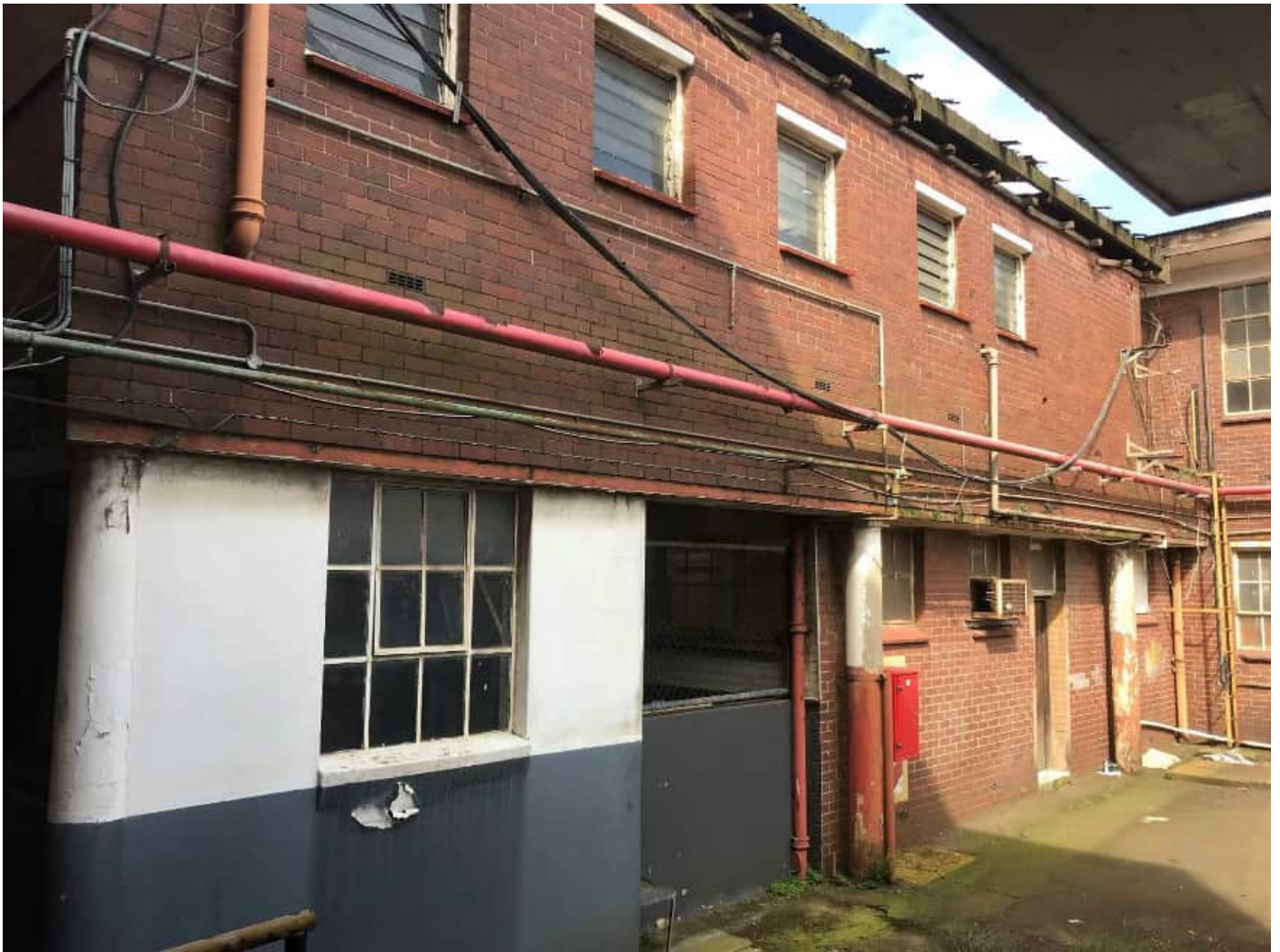
Figure 8.) Image illustrates part North west/Western façade view of the existing Laboratory building in which the demolition of the First floor is proposed.