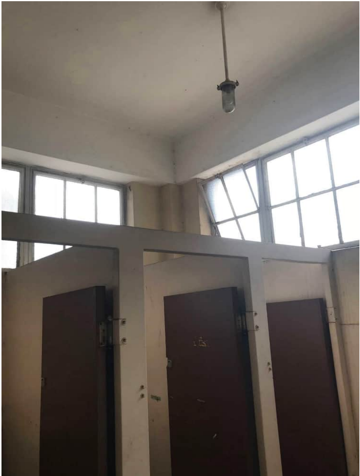
Figure 27.) Image illustrates Ground floor internals (ablutions). Refer to plans for items that are removed, refurbished or demolition.