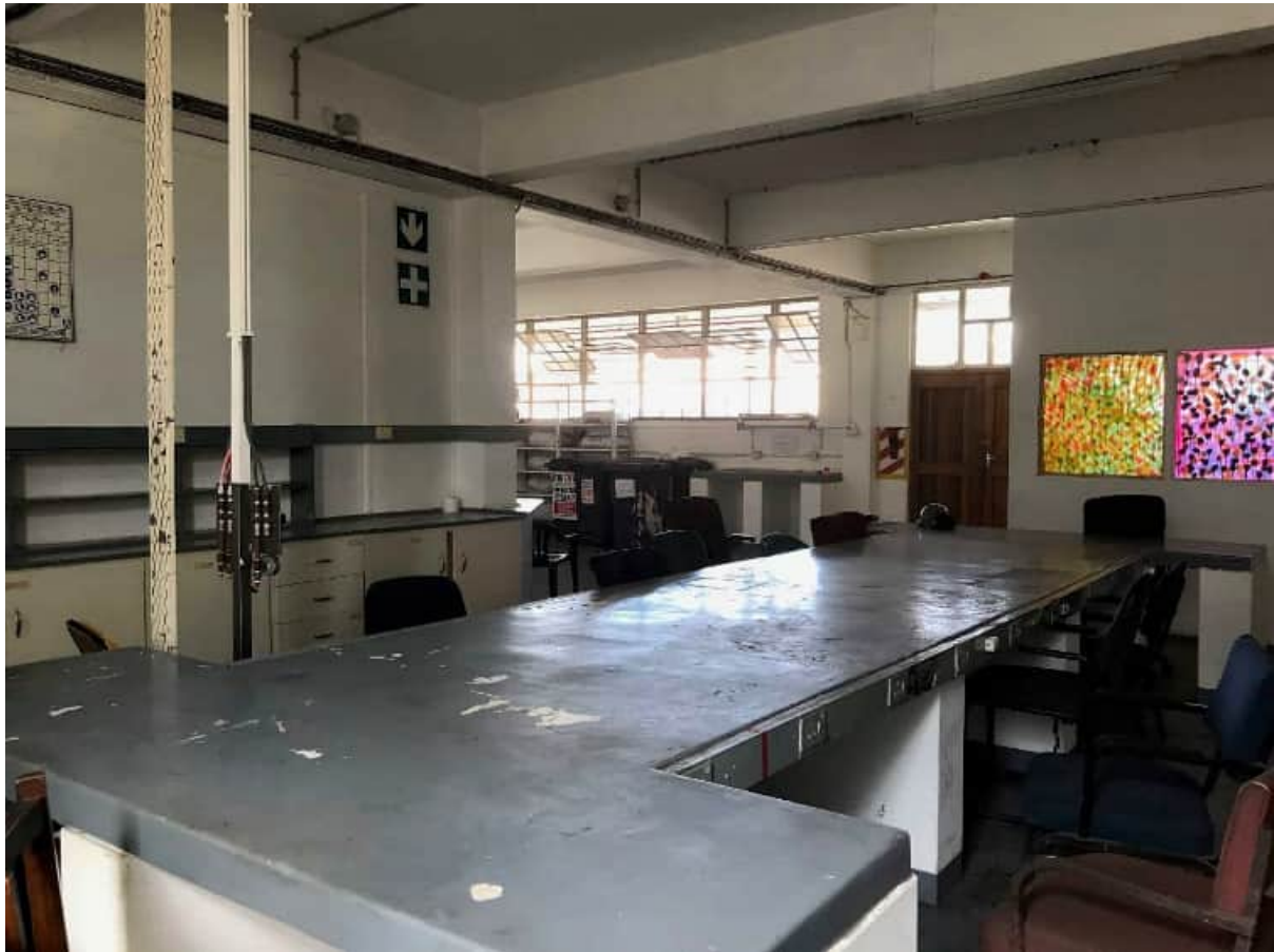
Figure 23.) Image illustrates Ground floor internals (laboratory) .. Refer to plans for items that are removed, refurbished or demolition.