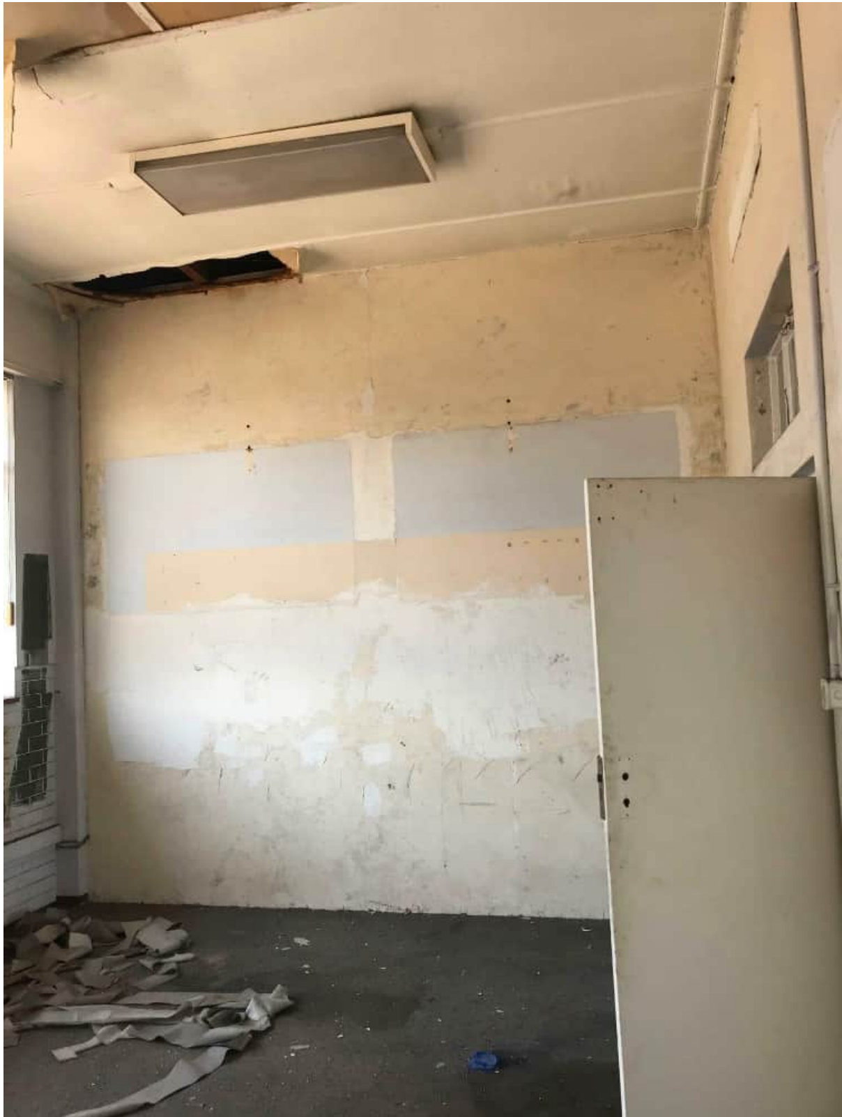
Figure 12.) Image illustrates first floor internals. The proposed includes demolition of all first-floor items.