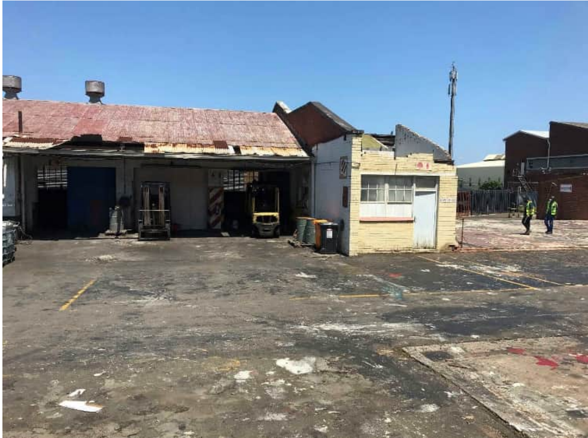
Figure 39.) View illustrating the north west façade of the garage bays that are proposed for demolition. Clearly indicative of the deteriorative conditions and safety hazard.