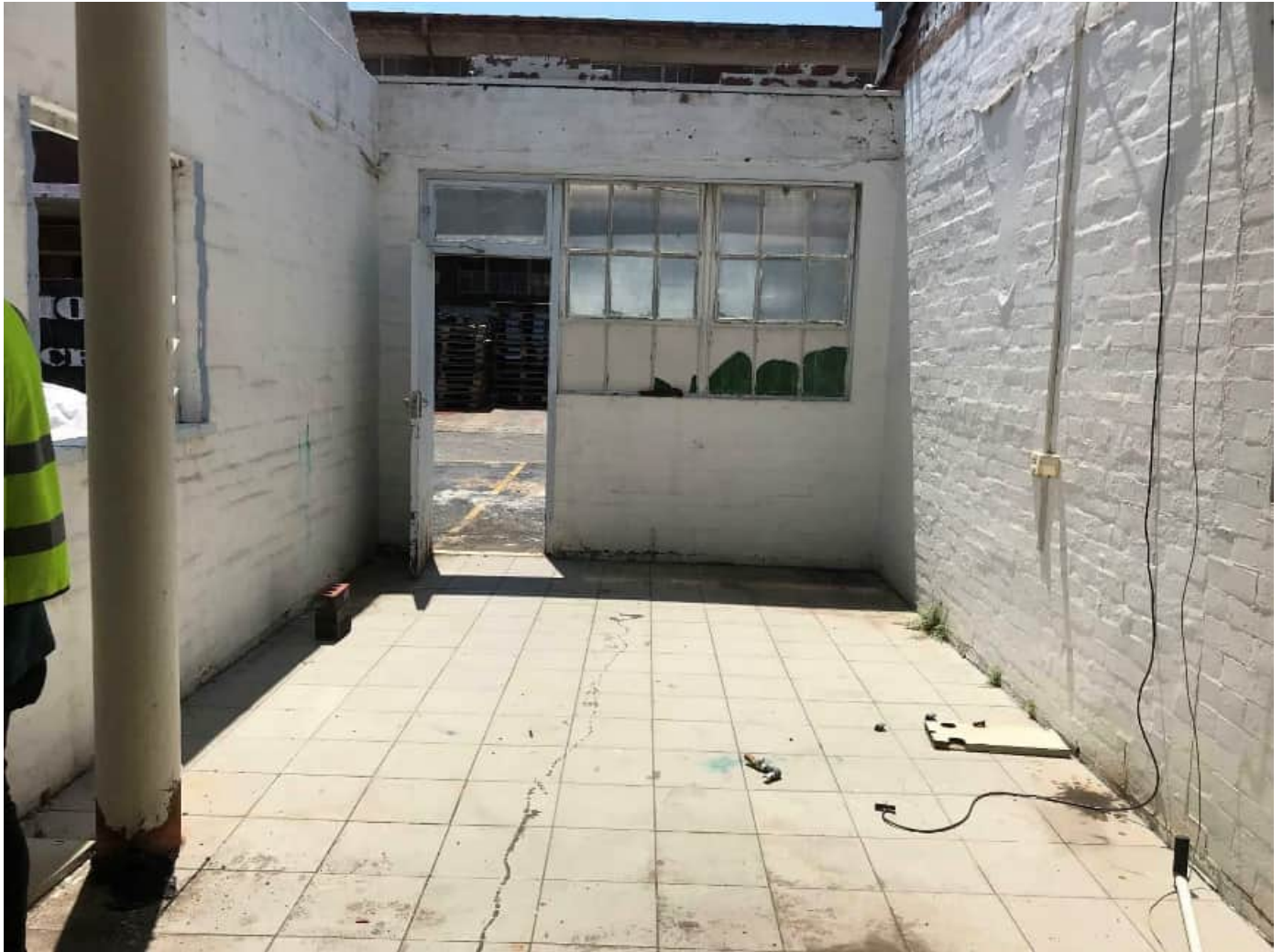
Figure 41.) View illustrating the internals of the garage Store. Refer to plans for list of additions, alterations & proposed demolition