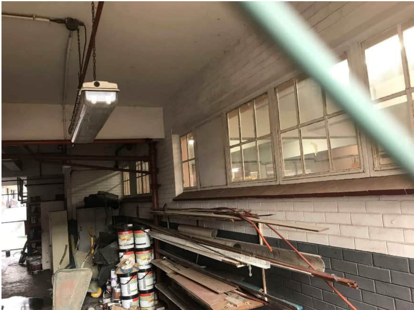
Figure 25.) Image illustrates Ground floor internals (north façade). Refer to plans for items that are removed, refurbished or demolition.