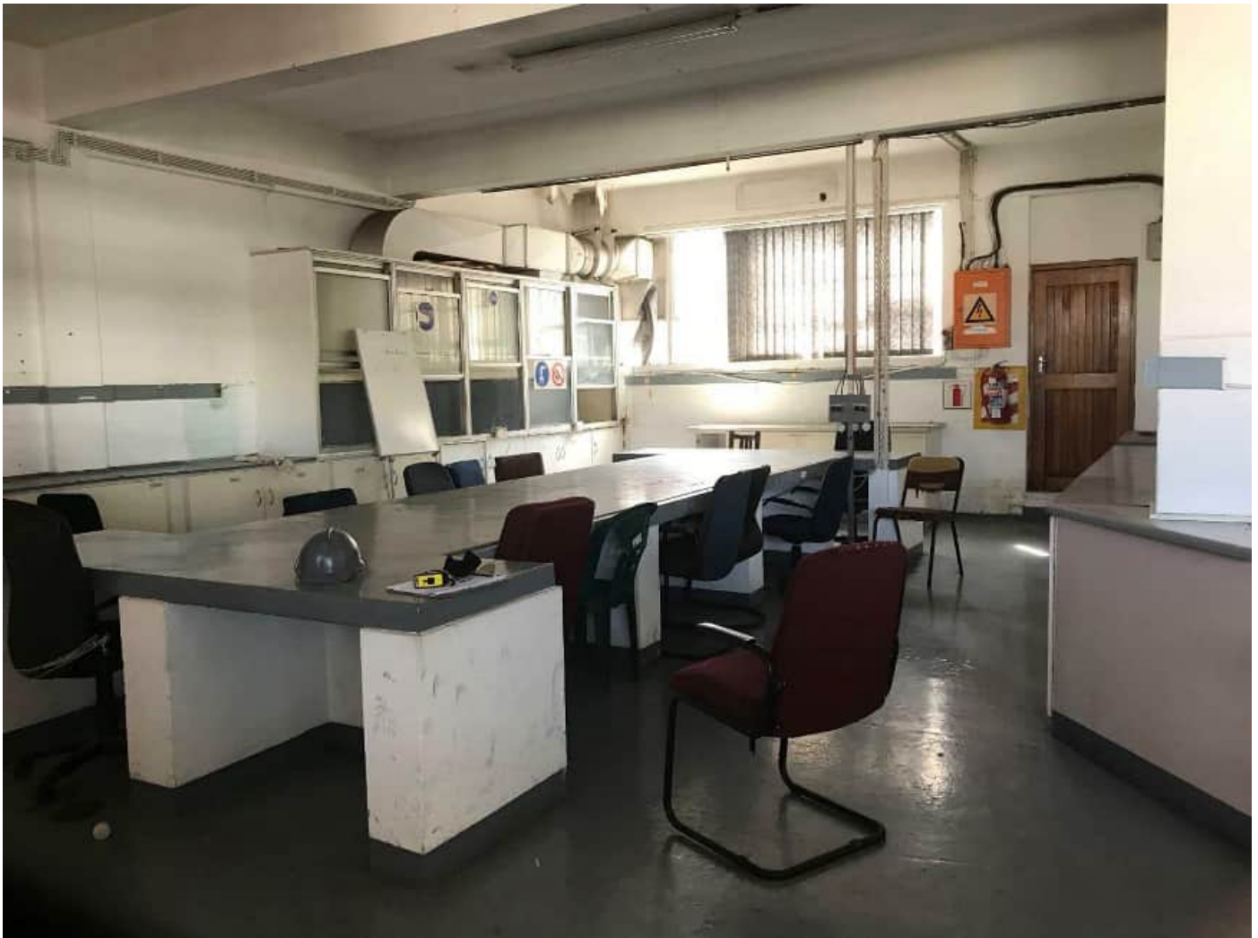
Figure 22.) Image illustrates Ground floor internals (laboratory) .. Refer to plans for items that are removed, refurbished or demolition.