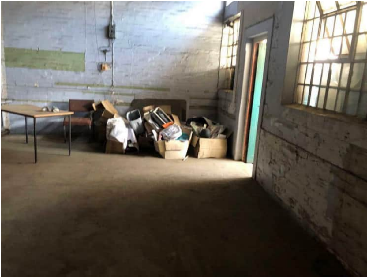
Figure 51.) View illustrating the internals of the office building and store. Refer to plans for list of additions, alterations & proposed demolition.