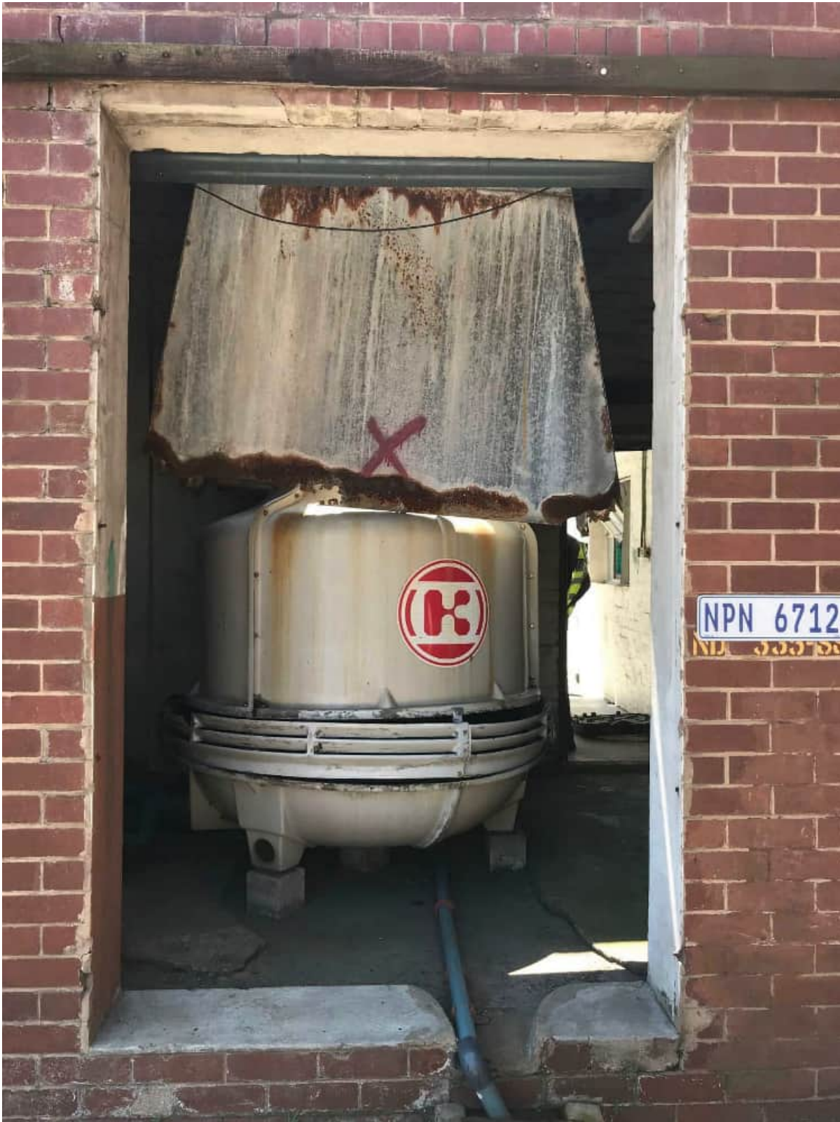
Figure 42.) View illustrating the internals of the garage Store and plant room. Refer to plans for list of additions, alterations & proposed demolition