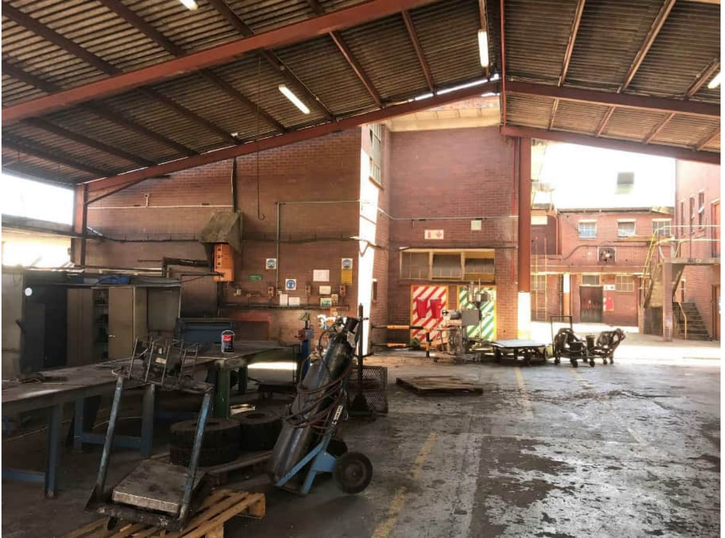
Figure 3.) Image illustrates a part Eastern façade view of the existing Laboratory building in which the demolition of the First floor is proposed. Image also illustrates existing covered area adjacent to the laboratory, which shall remain in its current state. To the far right of the image, the existing staff quarters can be seen in its context, which is also proposed for demolition.