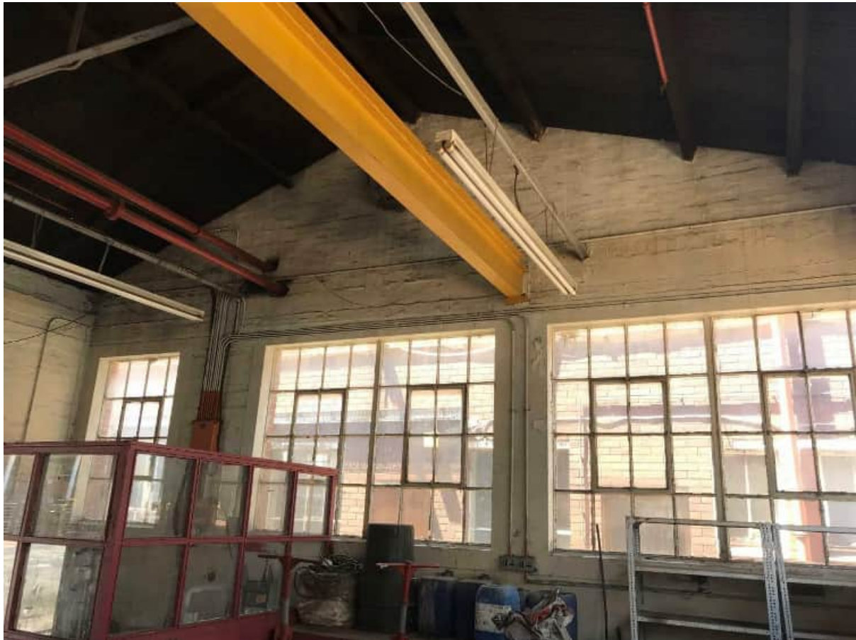
Figure 44.) View illustrating the internals of the garage bays. Refer to plans for list of additions, alterations & proposed demolition.