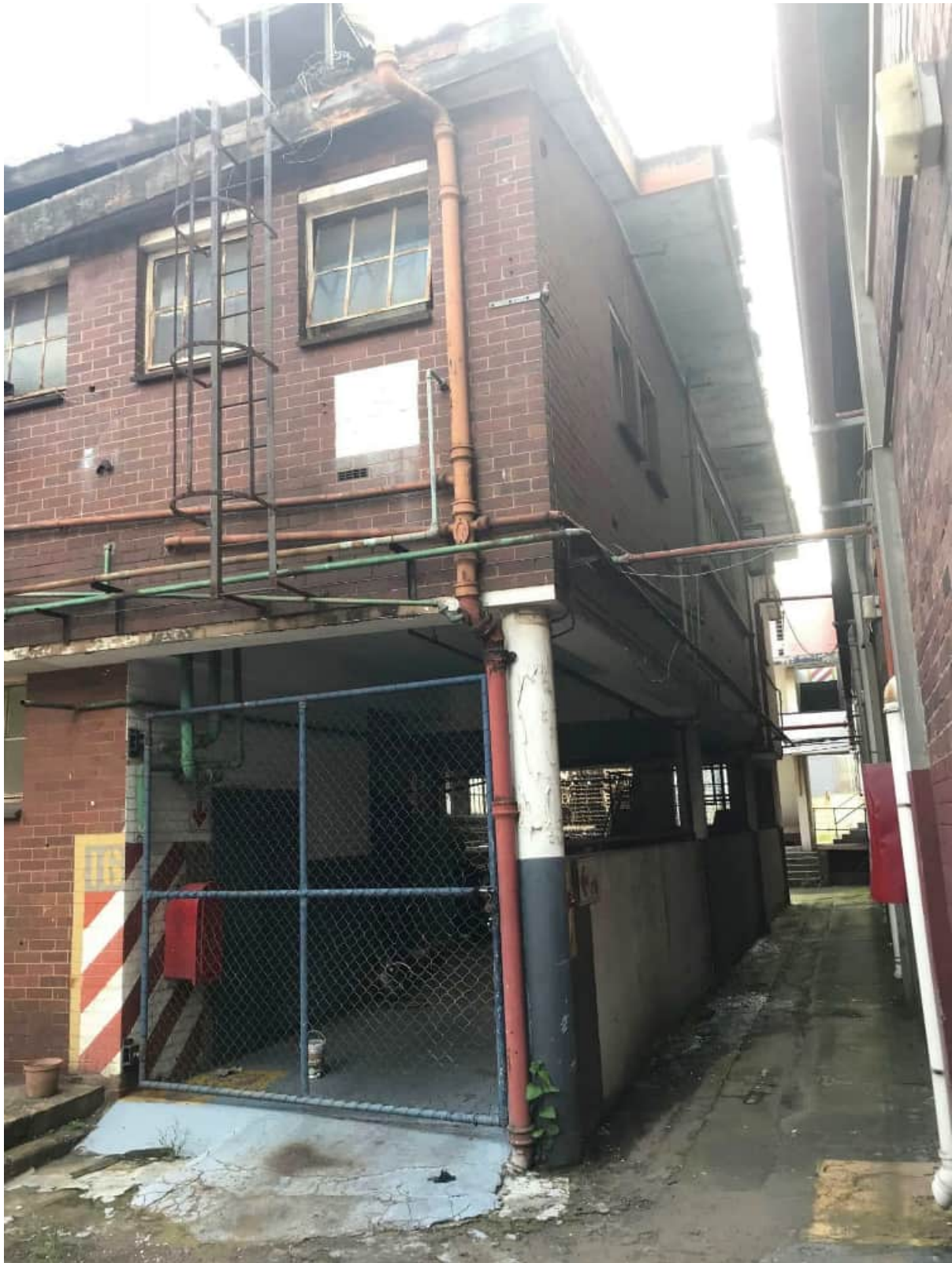
Figure 6.) Image illustrates North Eastern façade view of the existing Laboratory building in which the demolition of the First floor is proposed.