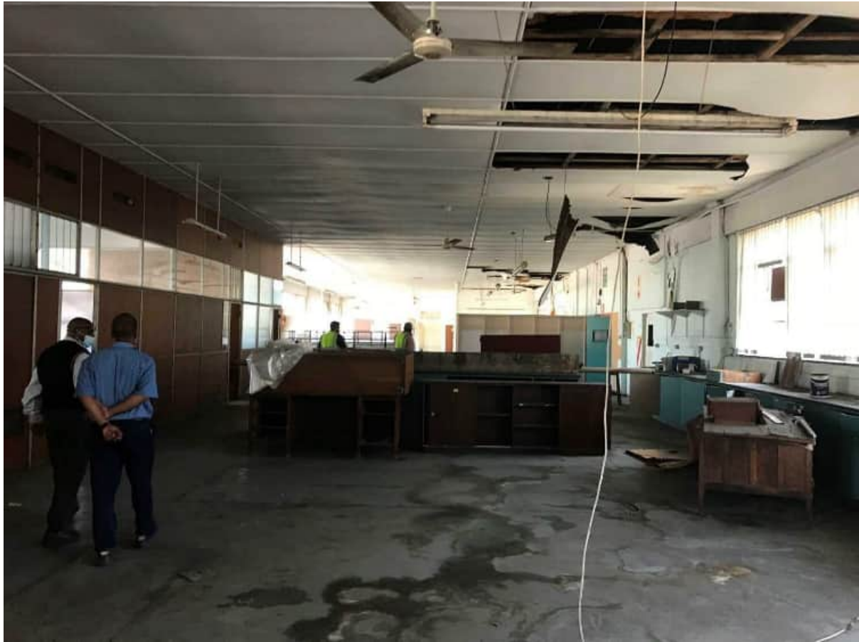
Figure 19.) Image illustrates first floor internals. The proposed includes demolition of all first-floor items.