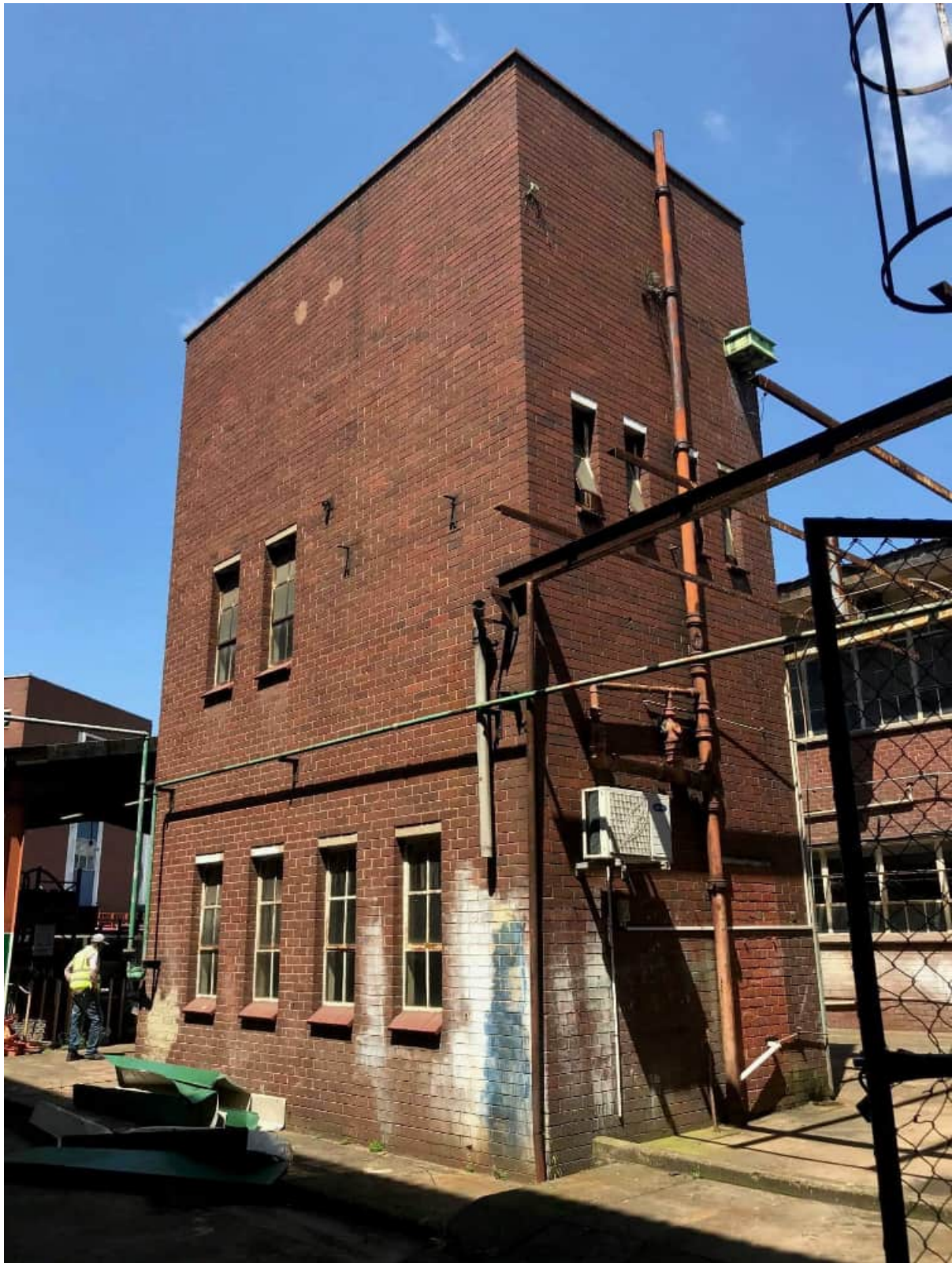
Figure 30.) North/North west view of staff quarters. Building is proposed for demolition given the condition of the structure.