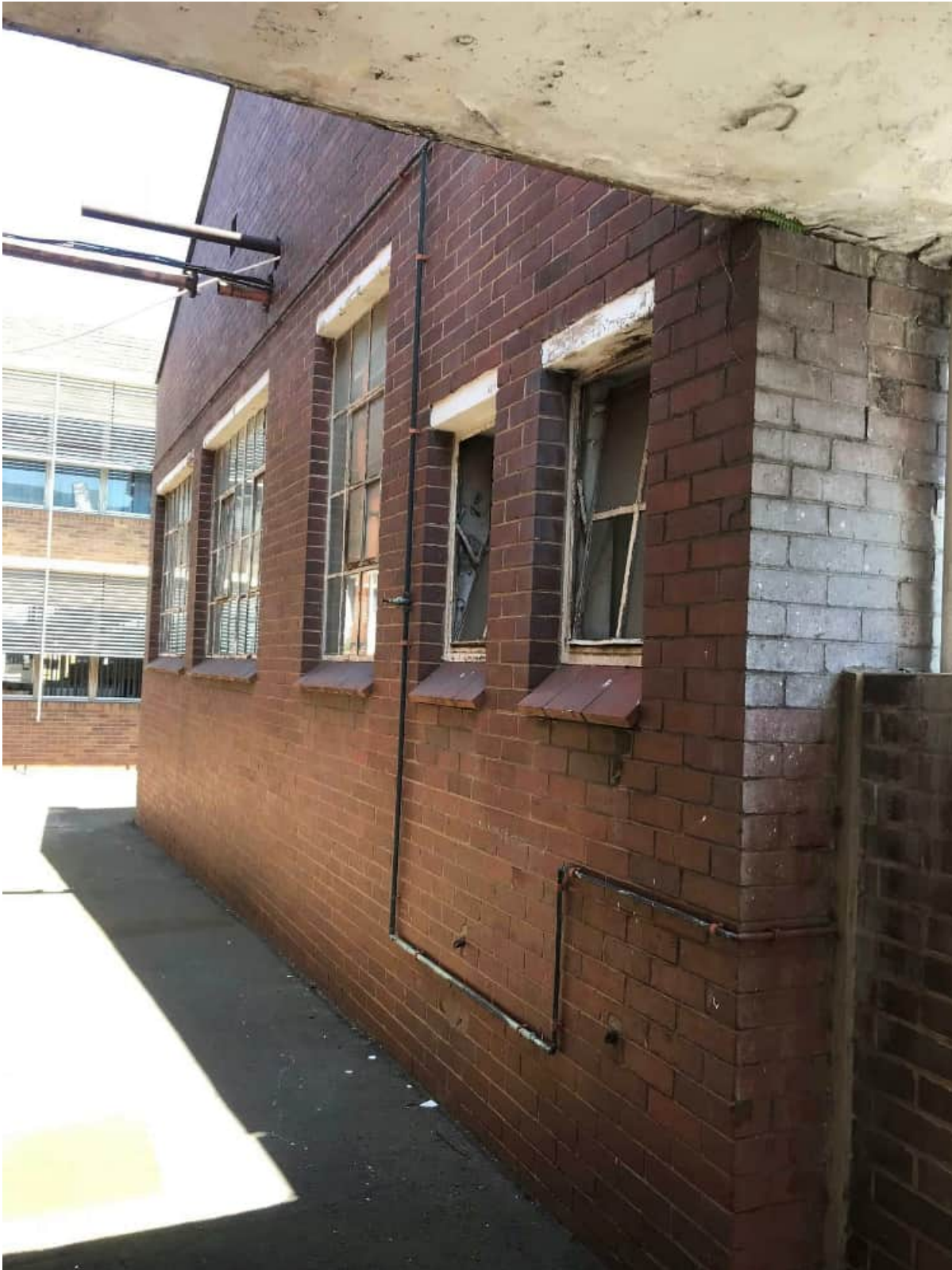
Figure 48.) View illustrating Eastern façade of the garage and storerooms. Refer to plans for list of additions, alterations & proposed demolition.