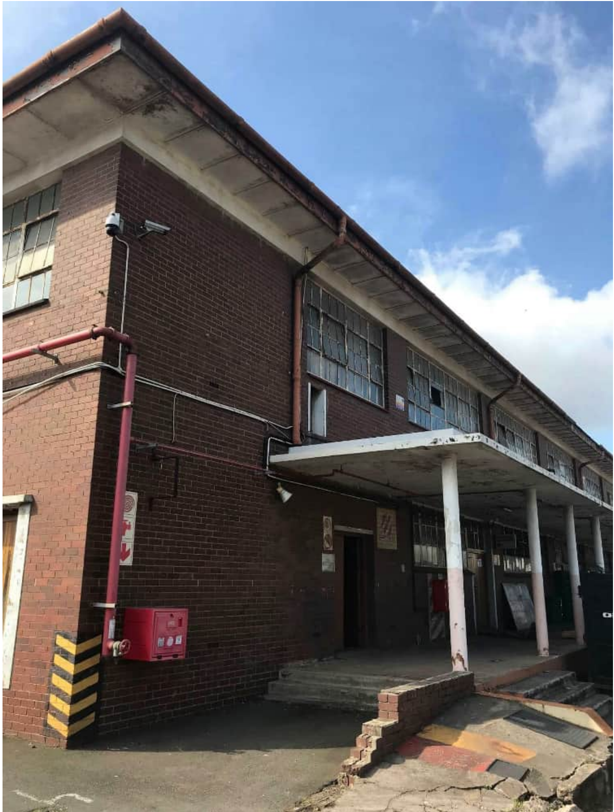
Figure 11.) Image illustrates South Western/South façade view of the existing Laboratory building in which the demolition of the First floor is proposed.