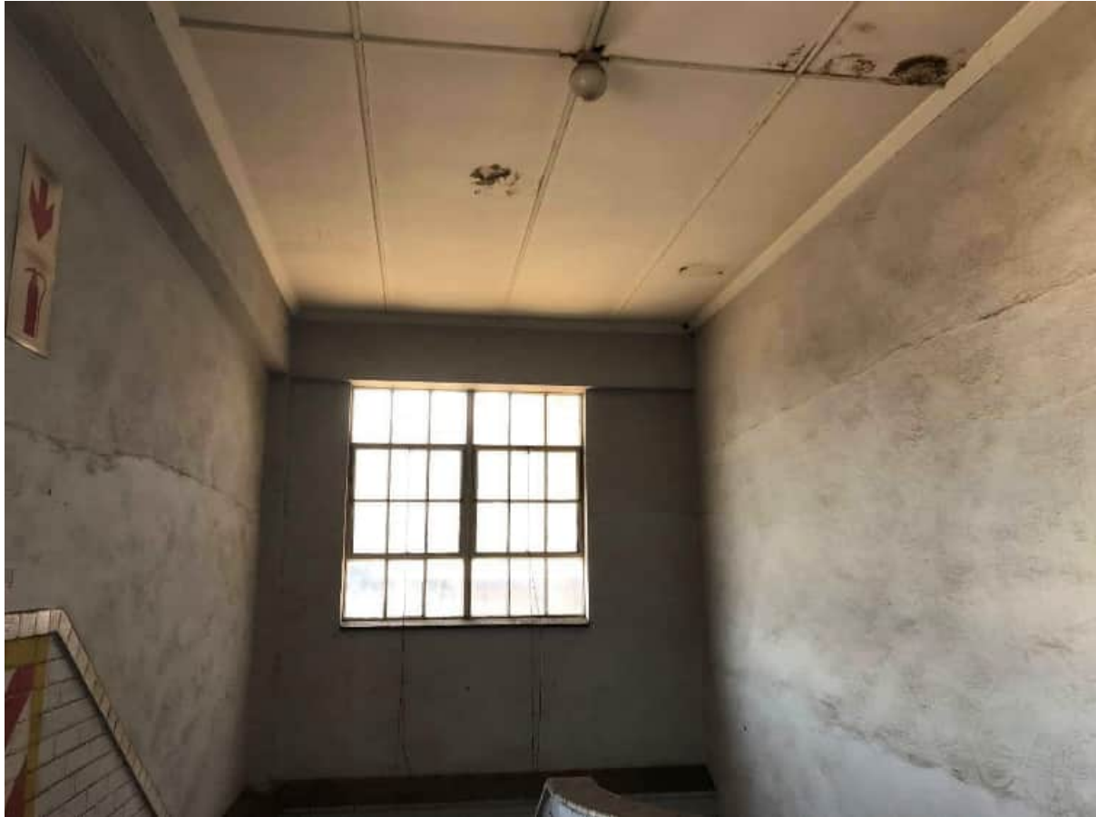
Figure 16.) Image illustrates first floor internals. The proposed includes demolition of all first-floor items.