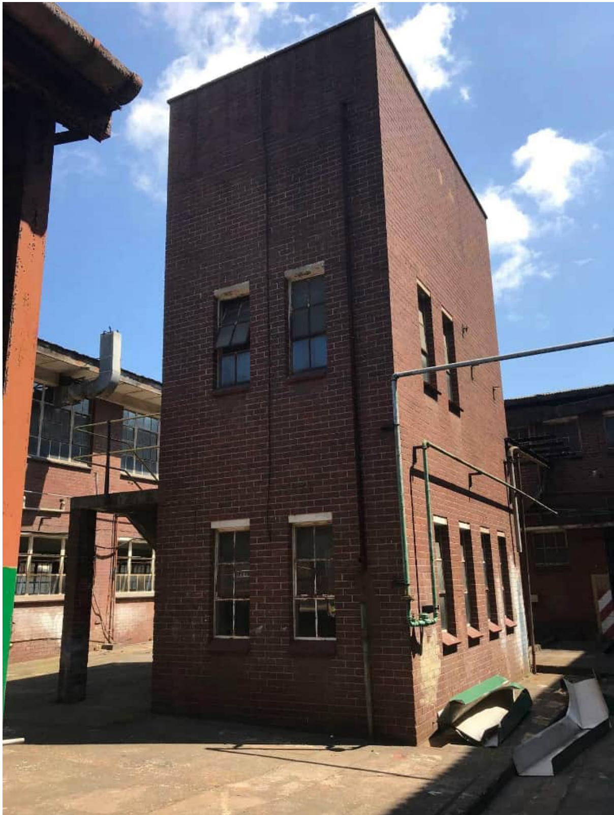
Figure 29.) North Eastern view of staff quarters. Building is proposed for demolition given the condition of the structure.