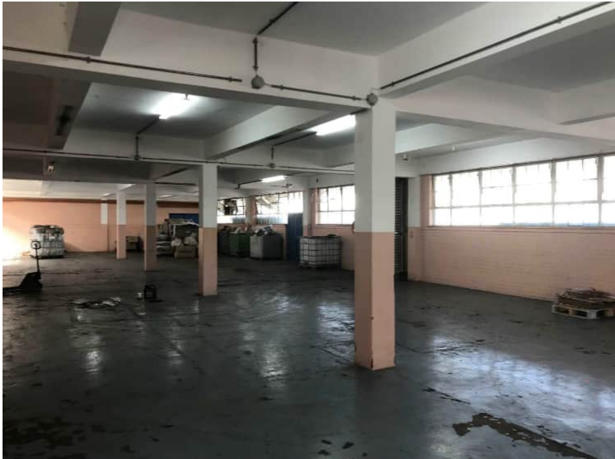
Figure 24.) Image illustrates Ground floor internals (laboratory) .. Refer to plans for items that are removed, refurbished or demolition.