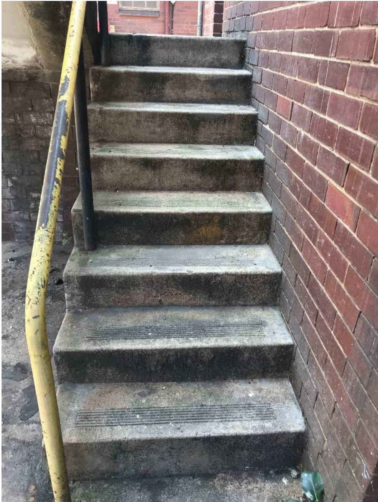
Figure 35.) View illustrating spalling concrete staircase.