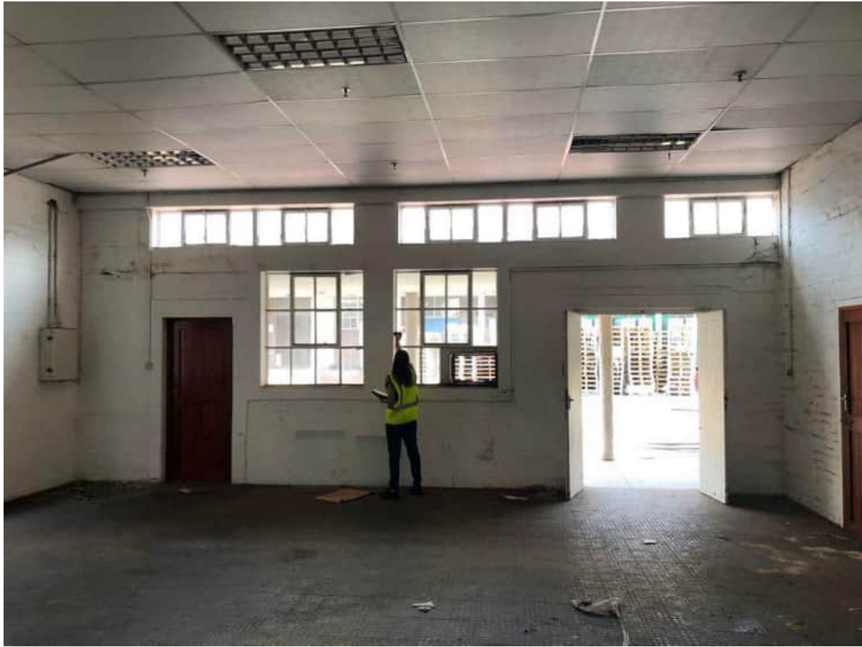
Figure 54.) View illustrating the internals of the office building and store. Refer to plans for list of additions, alterations & proposed demolition.