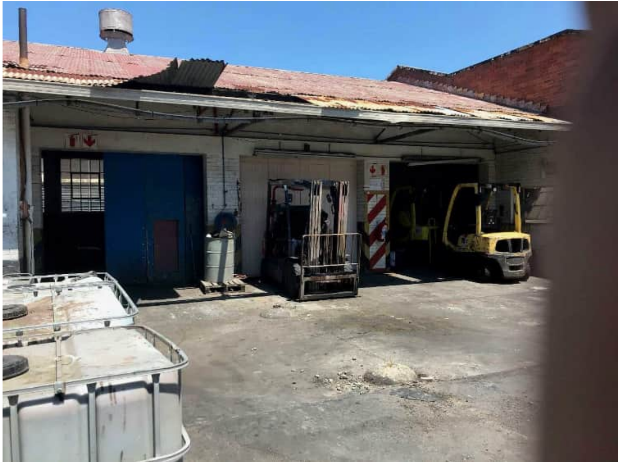
Figure 46.) View illustrating the front facade of the garage bays. Refer to plans for list of additions, alterations & proposed demolition.