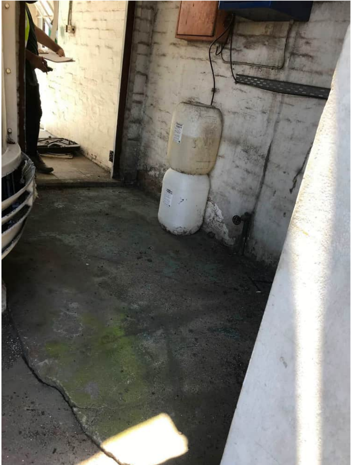
Figure 43.) View illustrating the internals of the garage Store and plant room. Refer to plans for list of additions, alterations & proposed demolition.