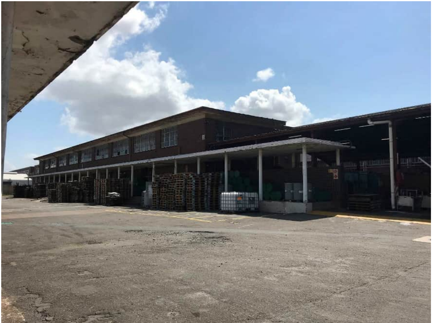
Figure 1). Image illustrates a South Eastern façade view of the existing Laboratory building in which the first-floor items are proposed for demolition.