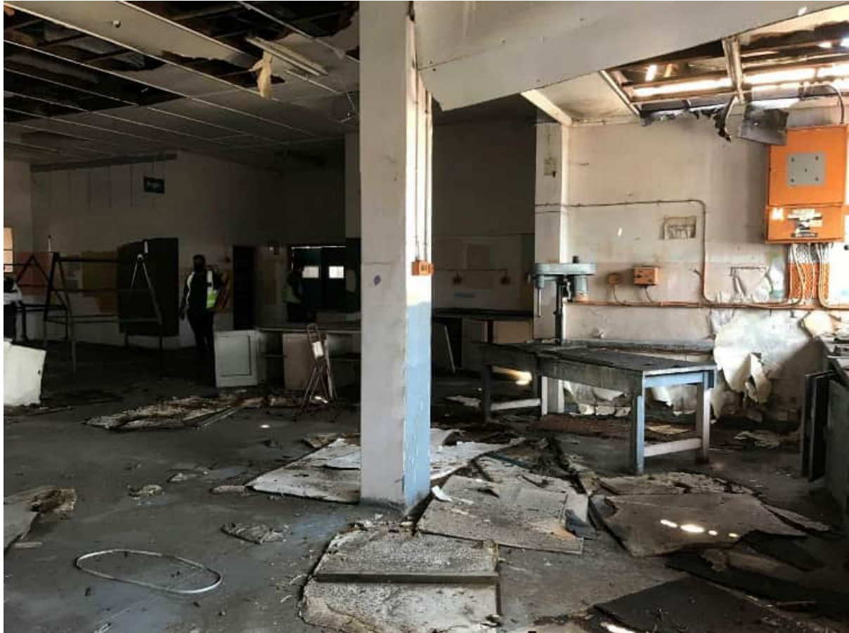
Figure 17.) Image illustrates first floor internals. The proposed includes demolition of all first-floor items.