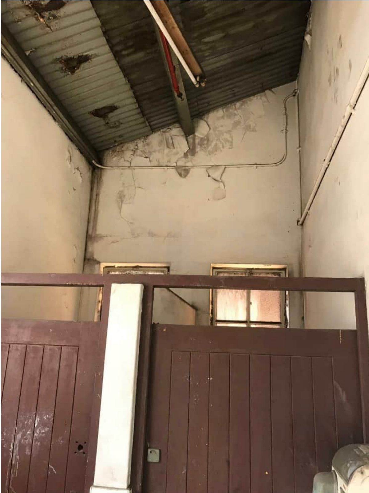
Figure 47.) View illustrating the internals of the ablutions. Refer to plans for list of additions, alterations & proposed demolition.