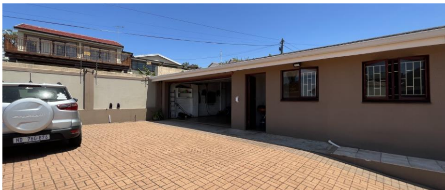
(Authors Picture) FRONT VIEW OF GARAGE