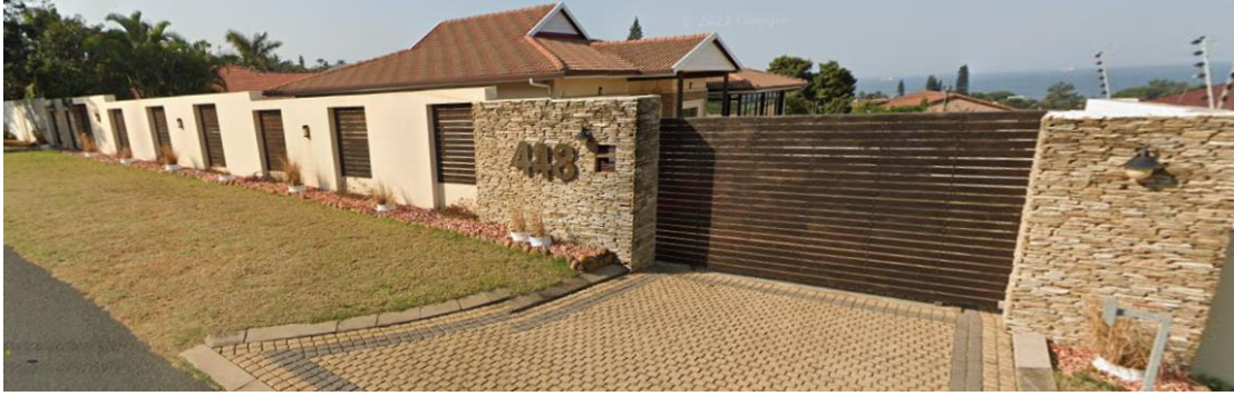
(Authors Picture) (NEIGHBOURS PICTURE) 48 LAUGHTON AVENUE