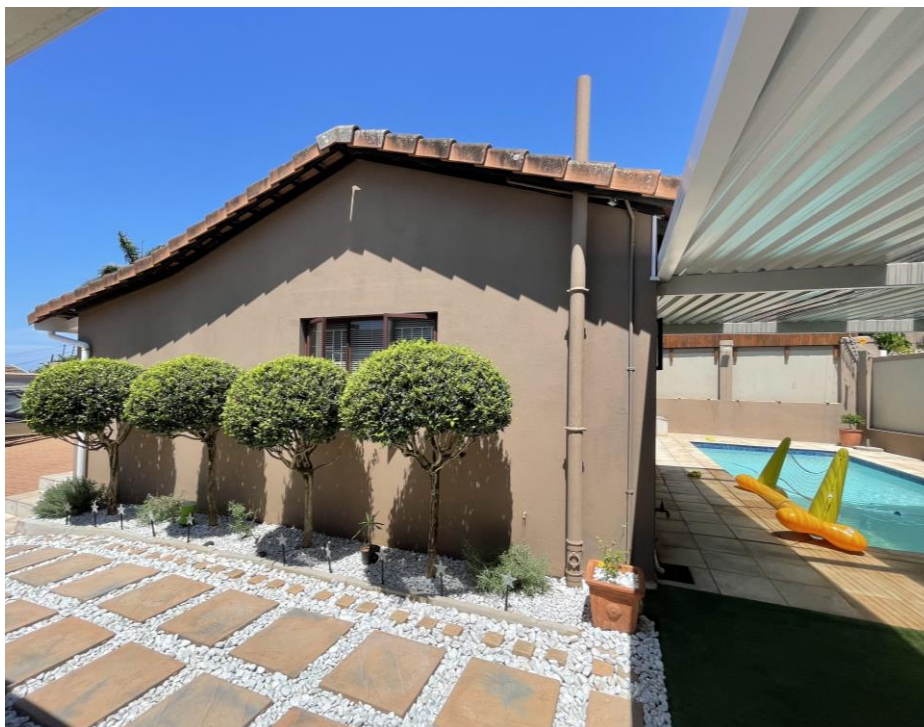
RIGHT VIEW OF GARAGE