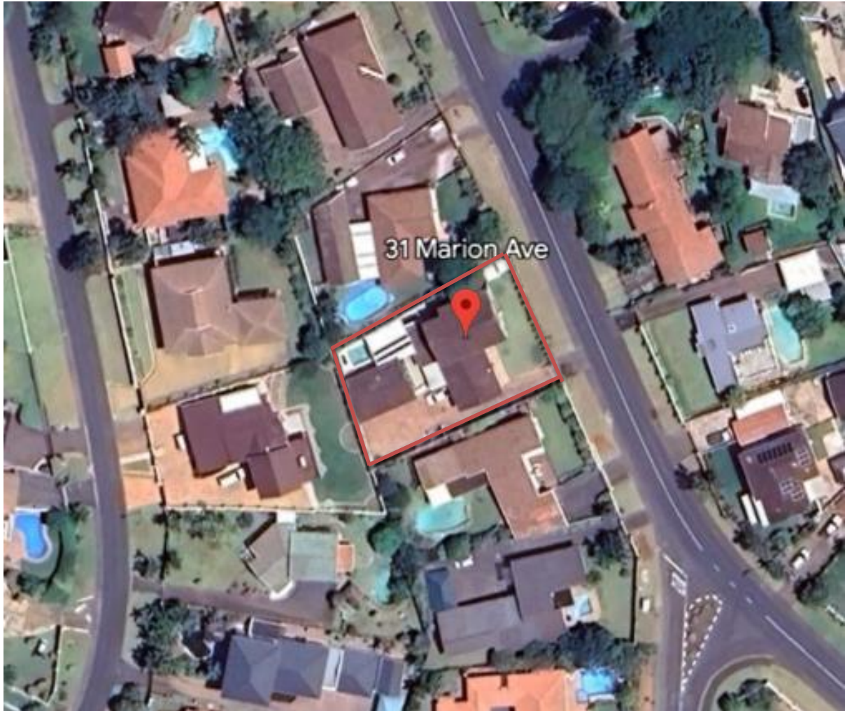
(GOOGLE EARTH) ARIEL SITE: 1: 50 000