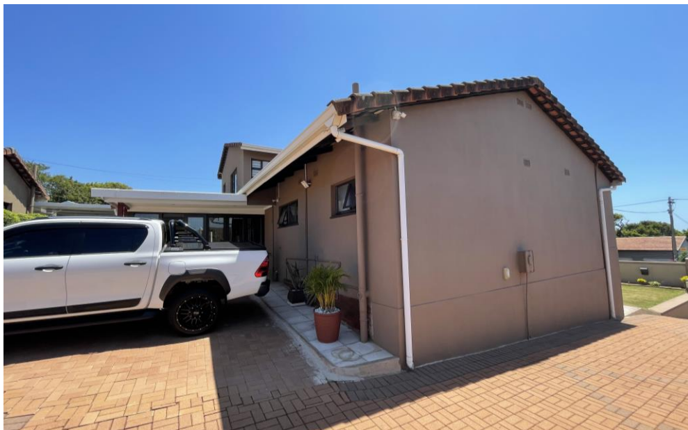
(Authors Picture) LEFT VIEW OF DWELLING