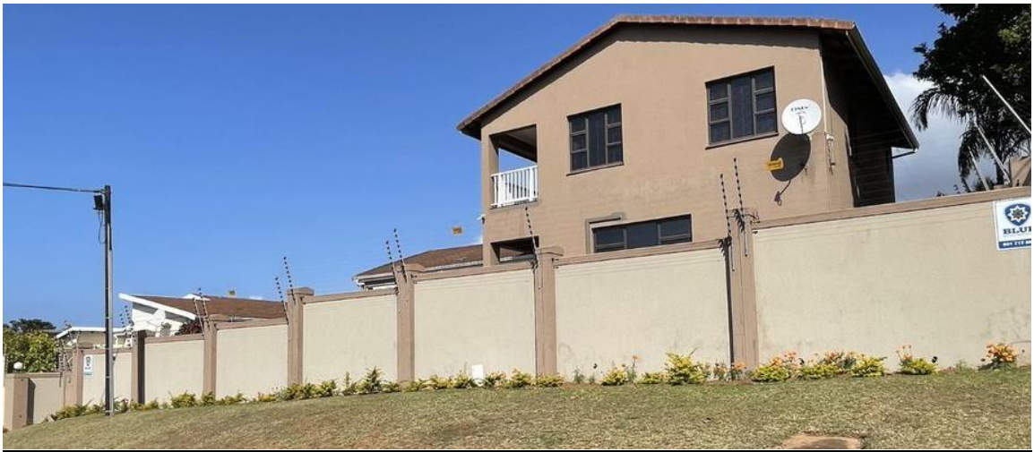
(Authors Picture) (NEIGHBOURS PICTURE) 31 MARION AVENUE