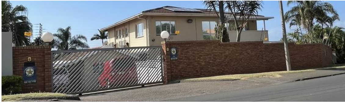
(Authors Picture) (NEIGHBOURS PICTURE) 8 MARION AVENUE