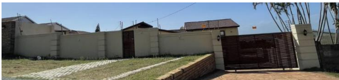
(Authors Picture) (NEIGHBOURS PICTURE) 46 LAUGHTON AVENUE