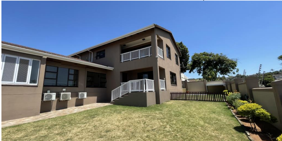
FRONT VIEW OF DWELLING