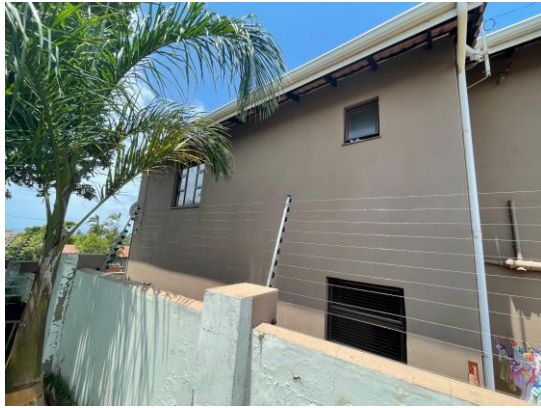
LEFT VIEW OF DWELLING