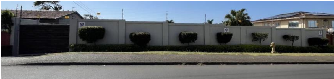
(Authors Picture) (NEIGHBOURS PICTURE) 10 MARION AVENUE