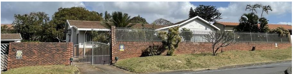
(Authors Picture) (NEIGHBOURS PICTURE) 35 MARION AVENUE