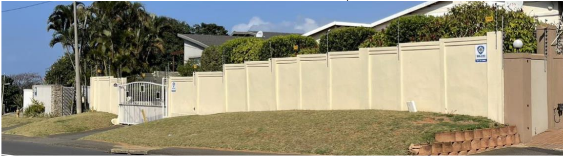
(Authors Picture) (NEIGHBOURS PICTURE) 29 MARION AVENUE