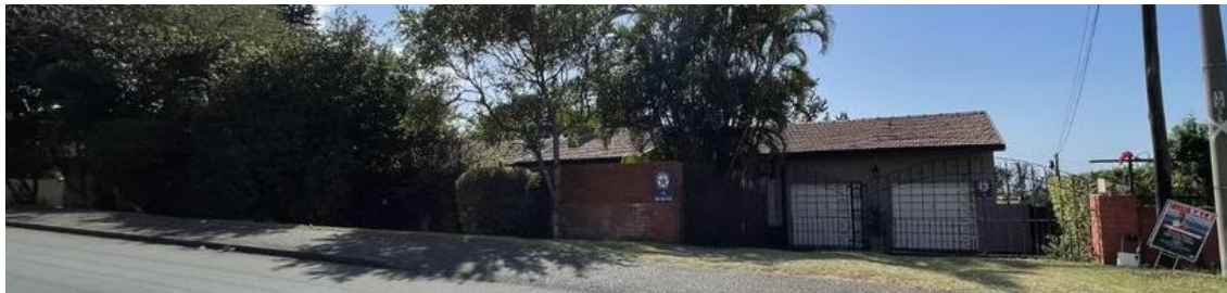
(Authors Picture) (NEIGHBOURS PICTURE) 12 MARION AVENUE