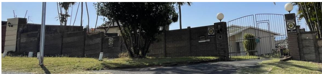
(Authors Picture) (NEIGHBOURS PICTURE) 44 LAUGHTON AVENUE