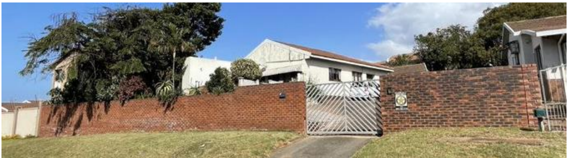
(Authors Picture) (NEIGHBOURS PICTURE) 33 MARION AVENUE