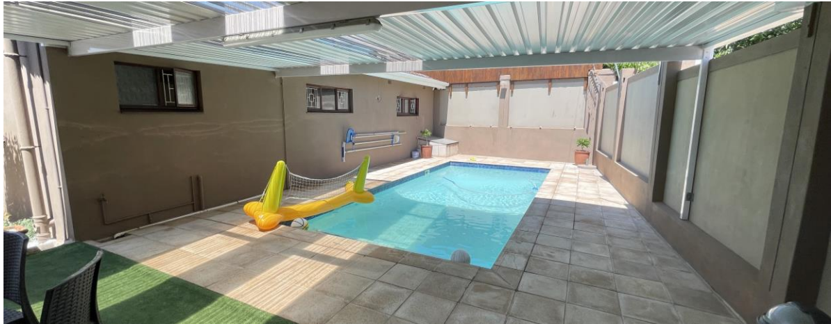
REAR VIEW OF GARAGE