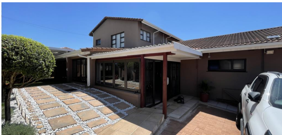
REAR VIEW OF DWELLING