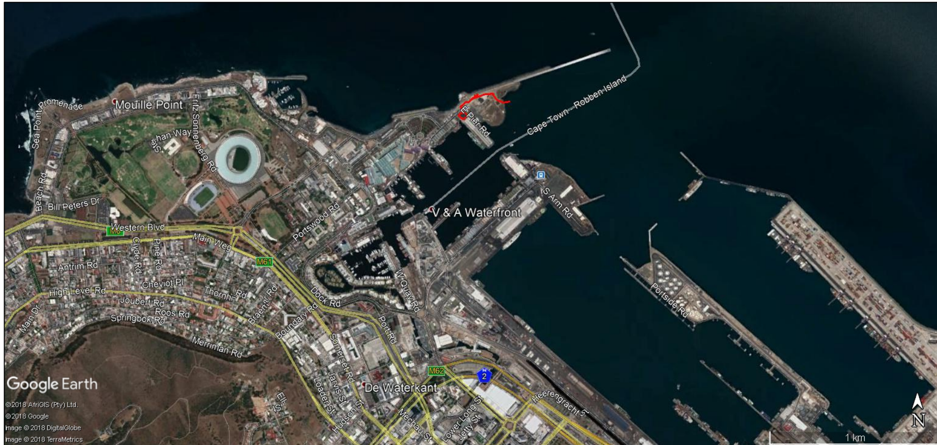
Figure 1.2: Proposed V&A Waterfront site and associated infrastructure (red lines) in context.