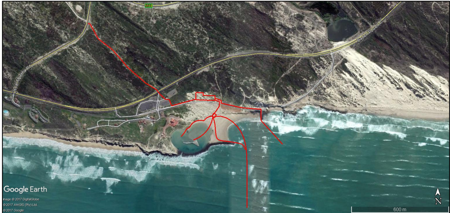
Figure 1.3: Proposed Monwabisi site and associated infrastructure for Phases 1 and 2 combined (red lines) in context of Monwabisi Resort and portion of Wolfgat Nature Reserve