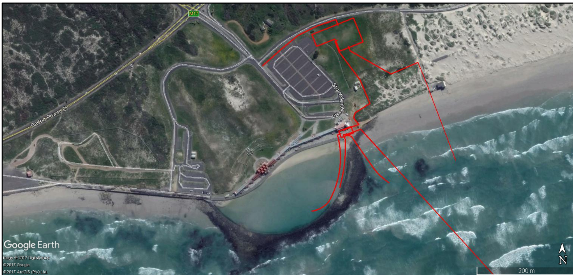
Figure 1.3. Proposed Strandfontein desalination site and associated infrastructure for Phases 1 and 2 combined (red lines) and immediate surrounds.