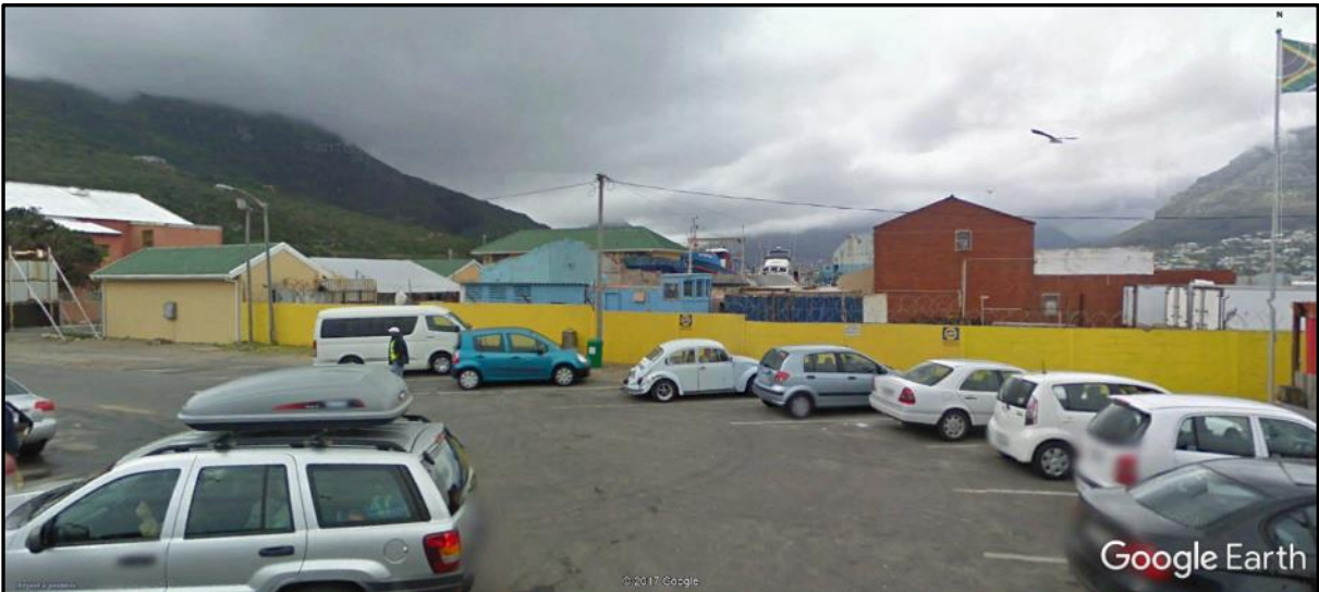
Photograph 10: Raw water pump station seen from parking area outside Fish on the Rocks adjacent to its south. The site is obscured by the yellow wall.