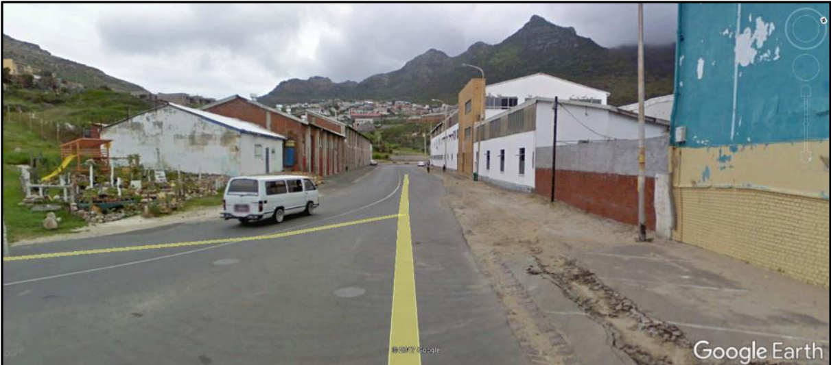
Photograph 7: Portion of Harbour Rd west of intersection with Atlantic Skipper Rd seen from east.

Both the raw water and brine discharge pipelines would be aligned on the pavement in the left of the photo.