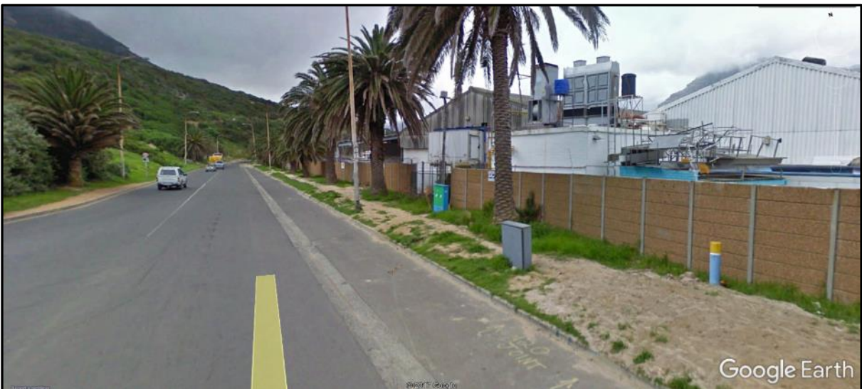
Photograph 6: Looking north from the same spot along Harbour Rd as Photograph 5.