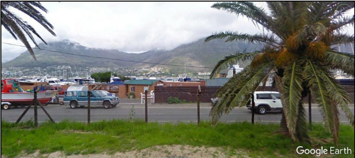
Photograph 4 The Hout Bay harbour area to the south of the desalination plant site, looking east from Harbour Rd.