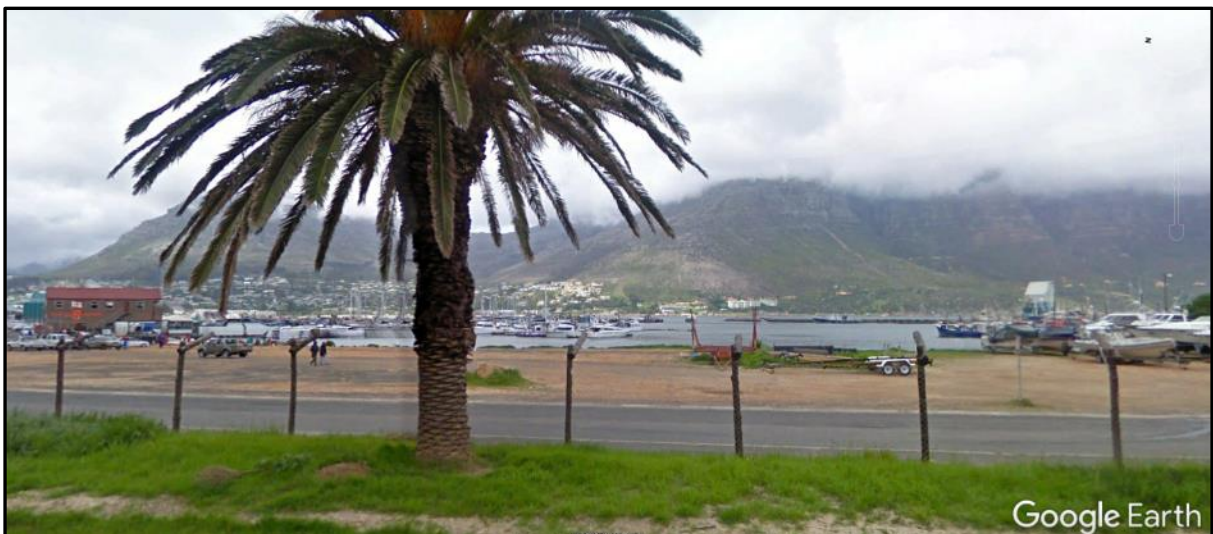
Photograph 2. Desalination plant site (denuded area along the shore) looking east from Harbour road.