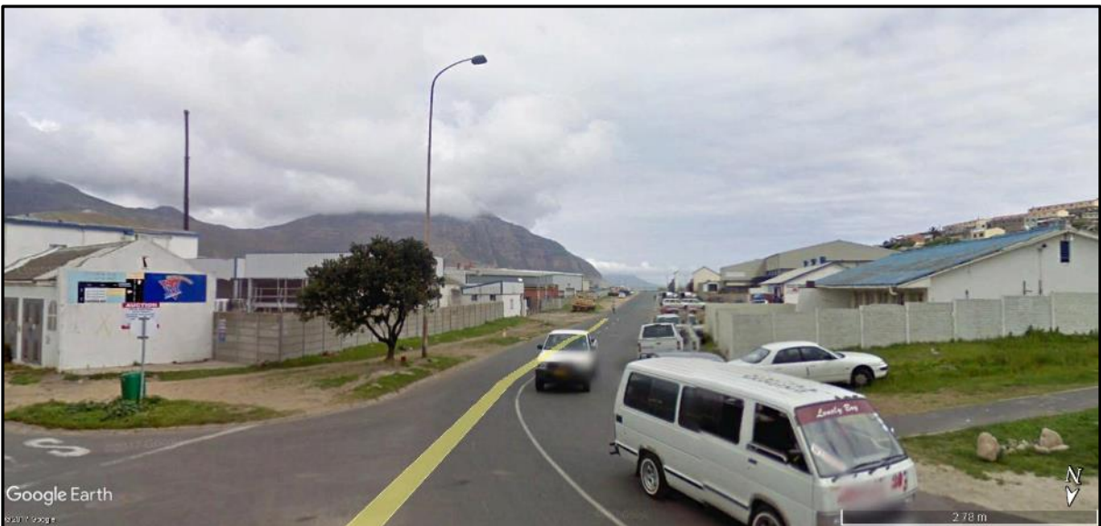
Photograph 14. Looking south down Atlantic Skipper St from intersection with Harbour Rd.

The mid portion of the brine discharge pipeline would be allocated on the pavement to the east of the road, i.e. on the left in the photo.