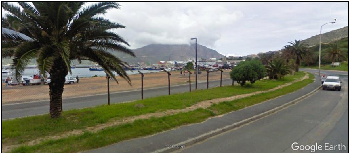
Photograph 1. Desalination plant site (denuded area along the shore) seen from north along Harbour road.