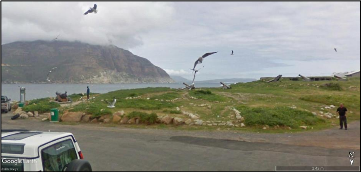
Photograph 13: West Fort on York Point ~40 m south of the raw water plant site. (Source: Google Earth Street View, September 2009).