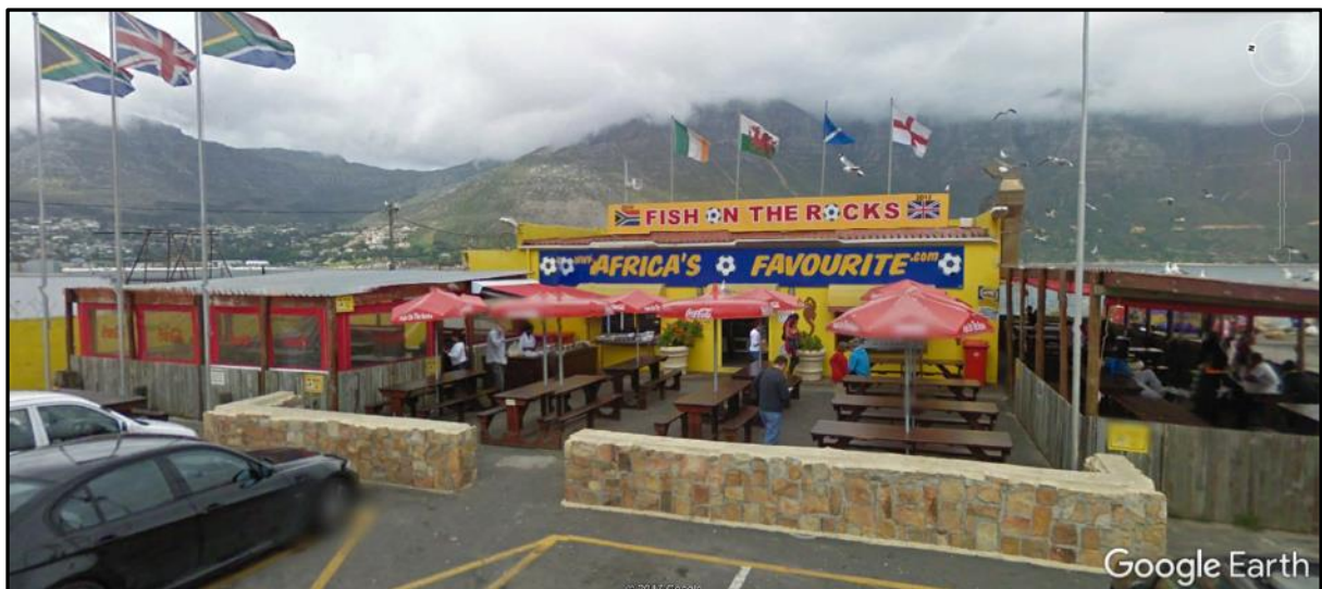
Photograph 12: Fish on the Rocks at the terminus of Harbour Rd, immediately to the south of the raw water pump station site.