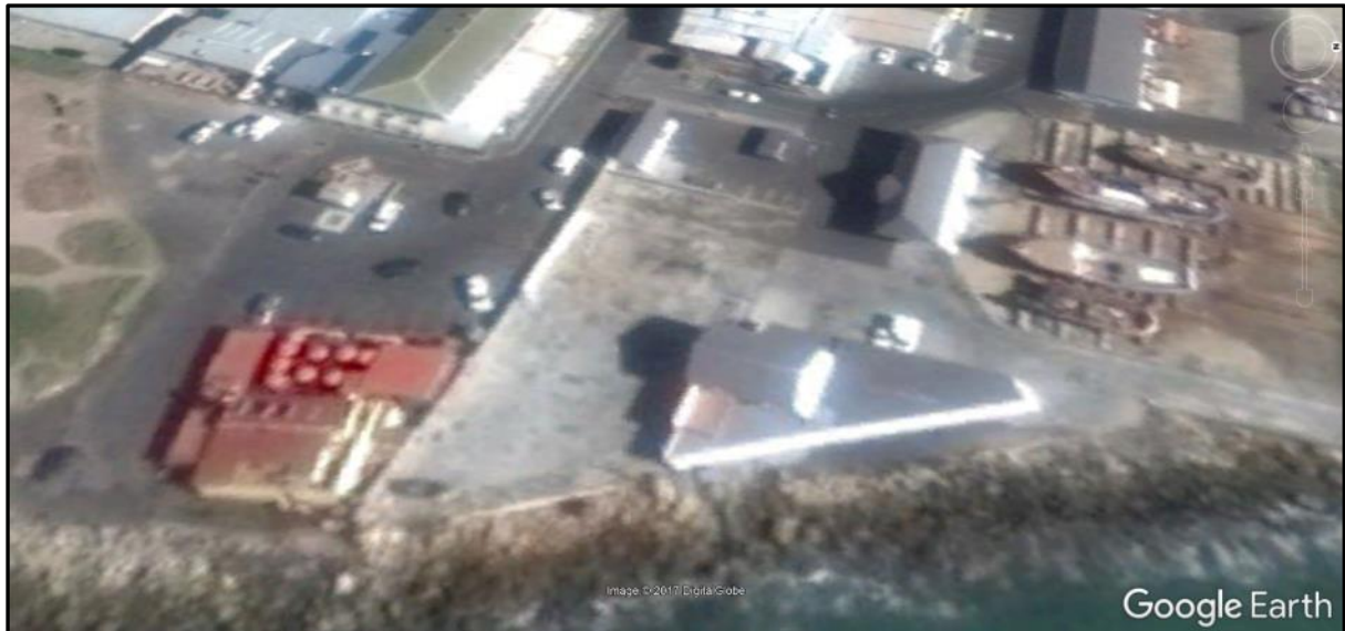
Photograph 11: Satellite image of raw water pump station site viewed from the east.