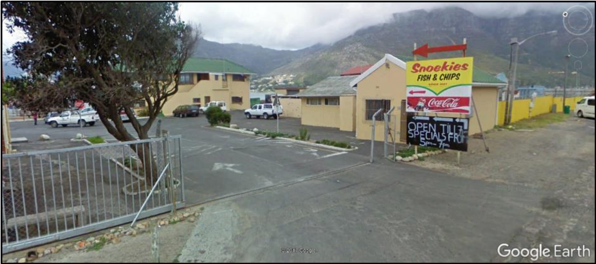
Photograph 9. Entrance to raw water pump station site at southern terminus of Harbour Rd. The site is obscured by the yellow building in the foreground.