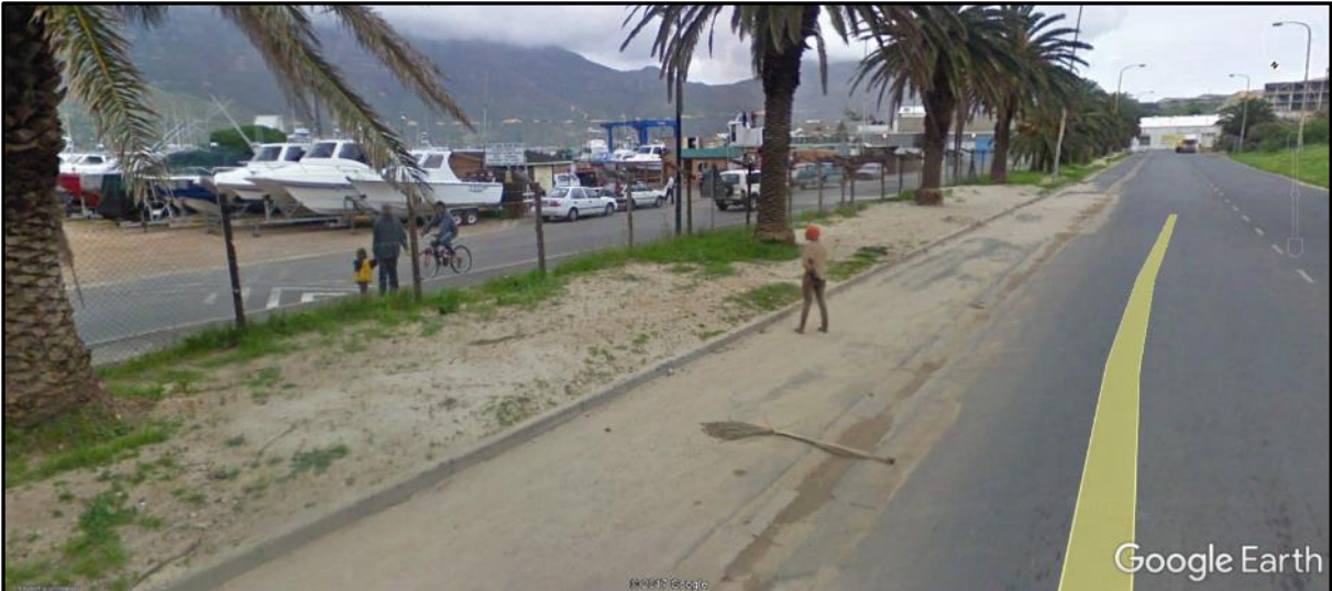
Photograph 3. Approximate point where fresh water injection pipeline would terminate (on the palm planted raised area) seen from north along Harbour road.