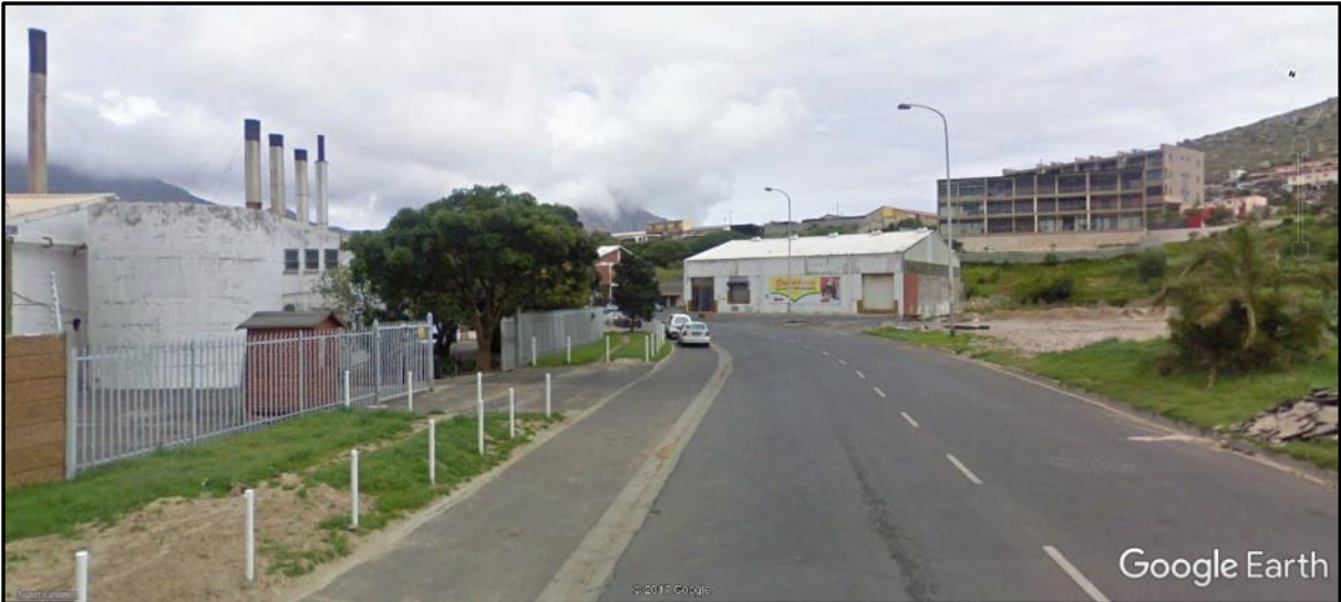
Photograph 5: Factory buildings in the Hout Bay Harbour area to the east of Harbour Rd. to the left, seen from the north.

Both the raw water and brine discharge pipelines would be aligned on the pavement in the left of the photo.